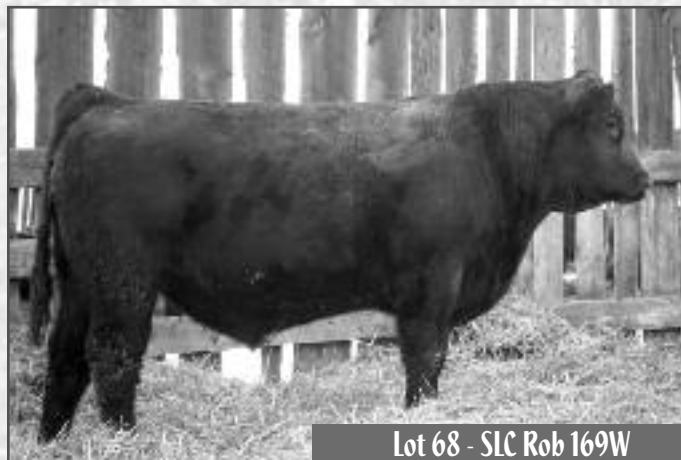
Lot 68 - SLC Rob 169W