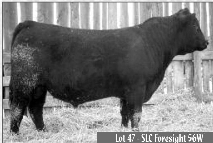
Lot 47 - SLC Foresight 56W