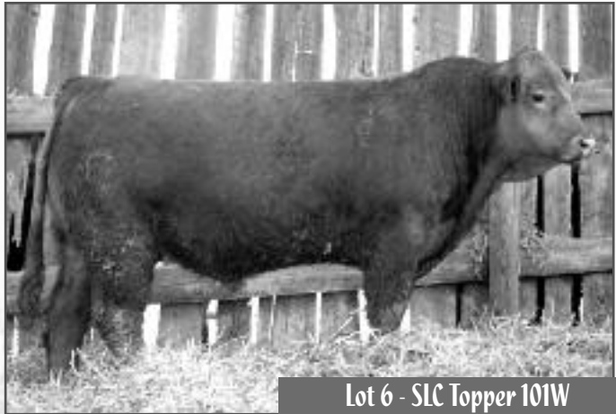
Lot 6 - SLC Topper 101W