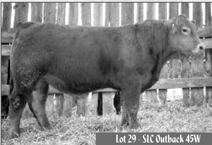
Lot 29 - SLC Outback 45W