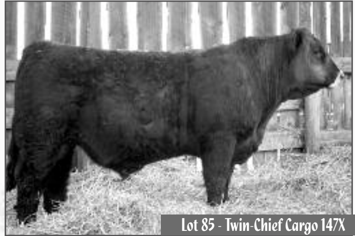
Lot 85 - Twin-Chief Cargo 147X