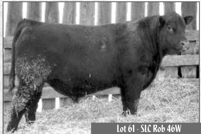
Lot 61 - SLC Rob 46W