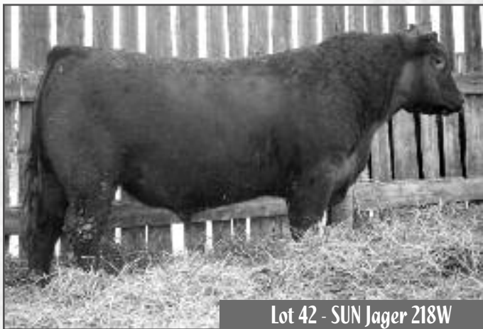
Lot 42 - SUN Jager 218W