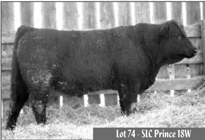
Lot 74 - SLC Prince 18W