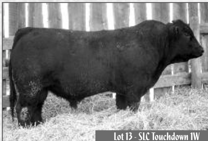
Lot 13 - SLC Touchdown 1W