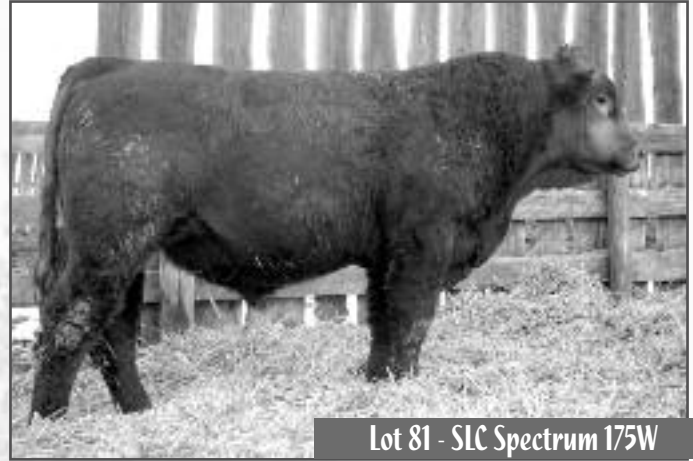
Lot 81 - SLC Spectrum 175W