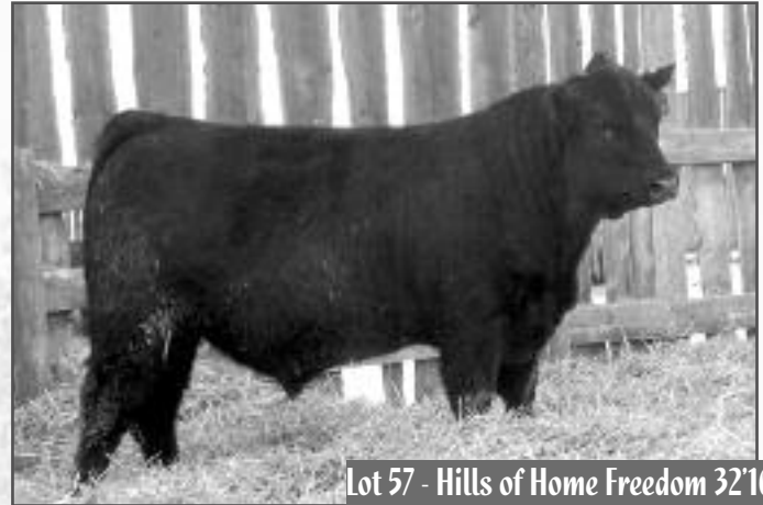
Lot 57 - Hills of Home Freedom 32'10