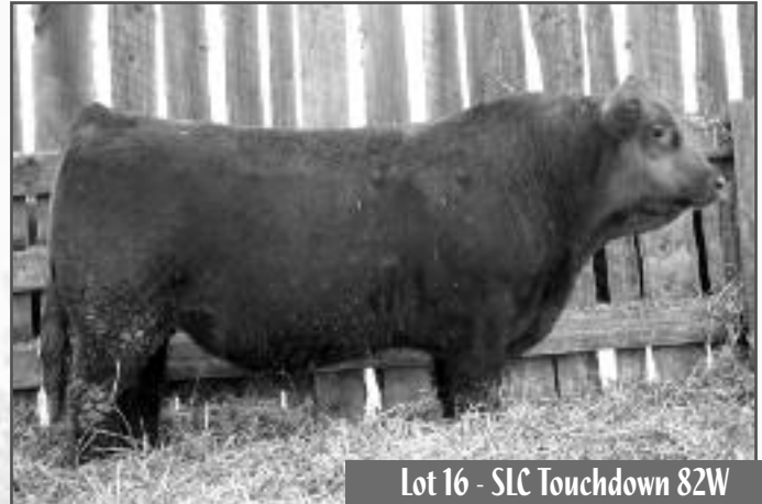
Lot 16 - SLC Touchdown 82W