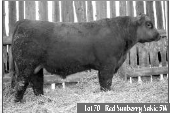
Lot 70 - Red Sunberry Sakic 5W