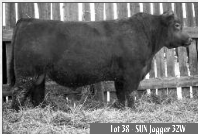
Lot 38 - SUN Jager 32W