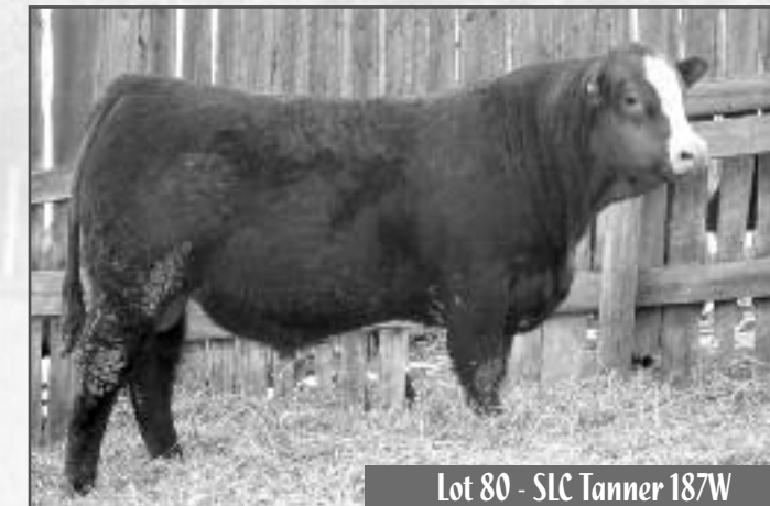
Lot 80 - SLC Tanner 187W