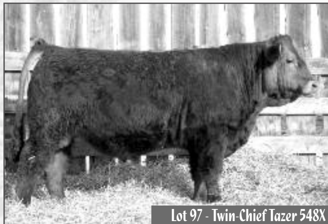
Lot 97 - Twin-Chief Tazer 548X