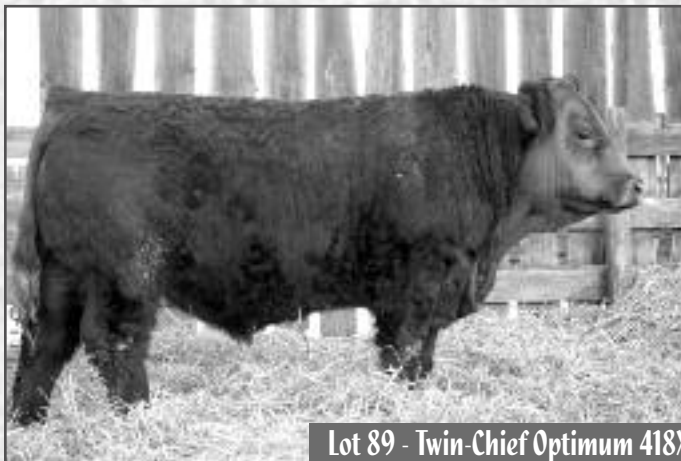
Lot 89 - Twin-Chief Optimum 418X