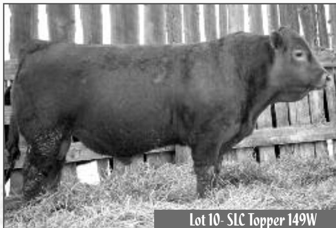
Lot 10- SLC Topper 149W