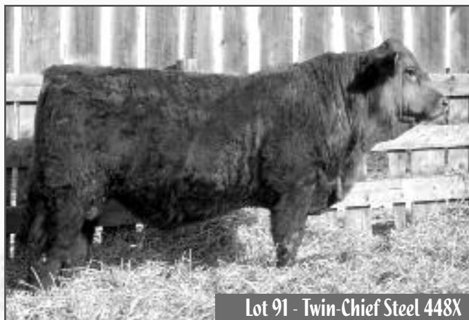
Lot 91 - Twin-Chief Steel 448X