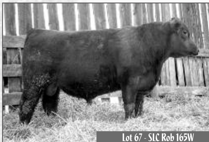
Lot 67 - SLC Rob 165W