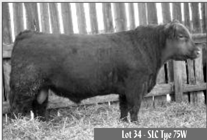
Lot 34 - SLC Tye 75W