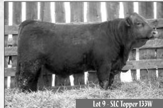
Lot 9 - SLC Topper 133W