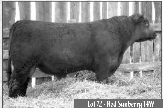
Lot 72 - Red Sunberry 14W