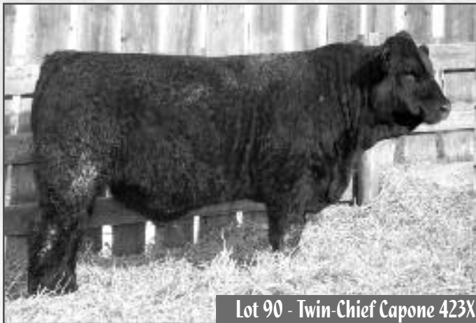
Lot 90 - Twin-Chief Capone 423X