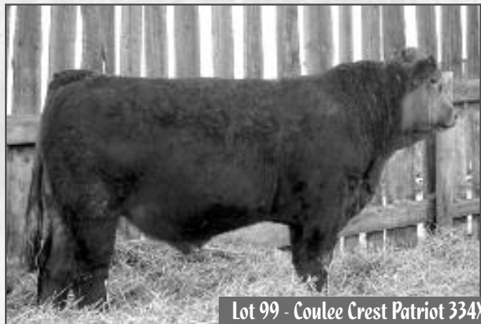
Lot 99 - Coulee Crest Patriot 334X