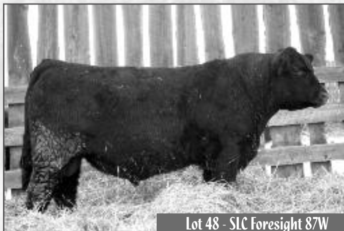
Lot 48 - SLC Foresight 87W