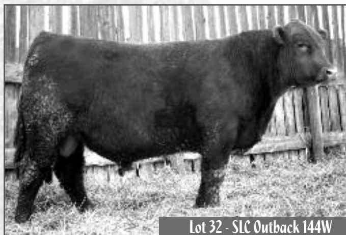
Lot 32 - SLC Outback 144W