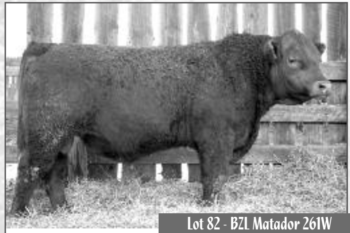
Lot 82 - BZL Matador 261W