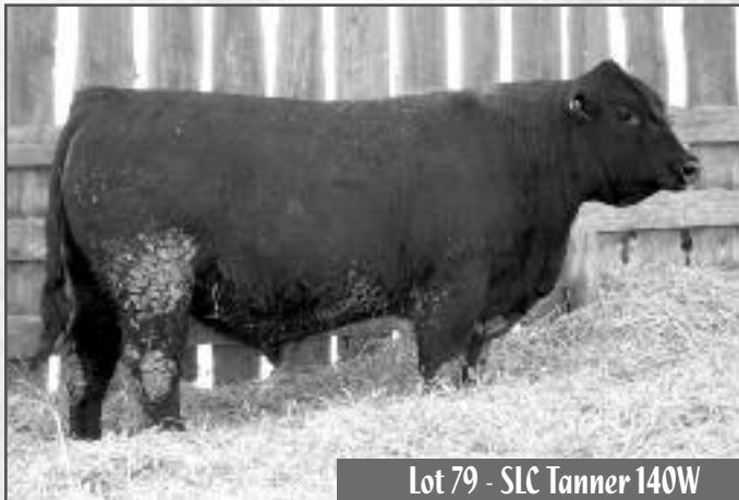
Lot 79 - SLC Tanner 140W