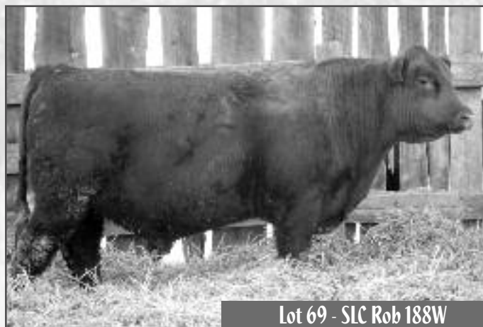
Lot 69 - SLC Rob 188W