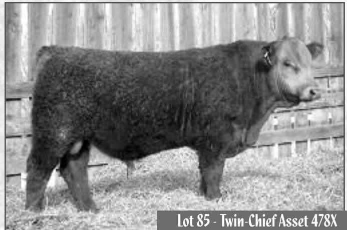
Lot 85 - Twin-Chief Asset 478X