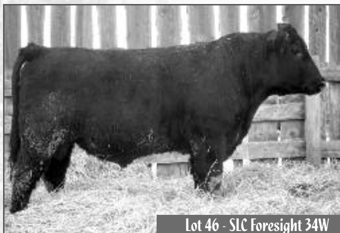
Lot 46 - SLC Foresight 34W