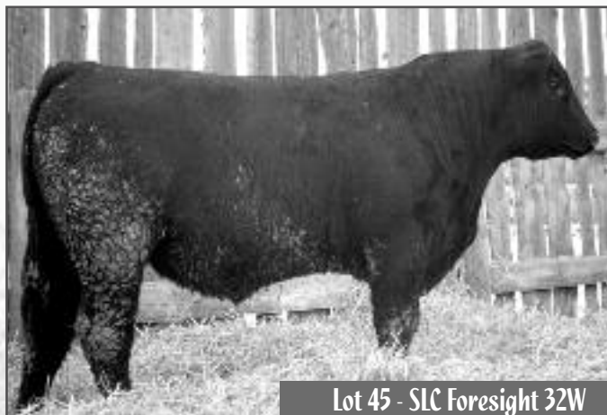
Lot 45 - SLC Foresight 32W