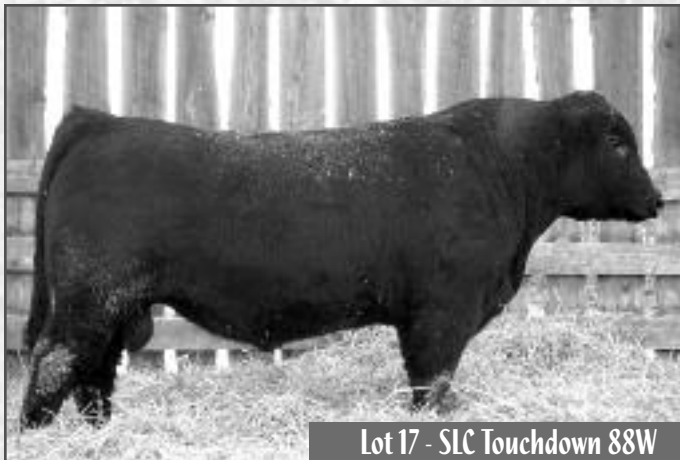
Lot 17 - SLC Touchdown 88W