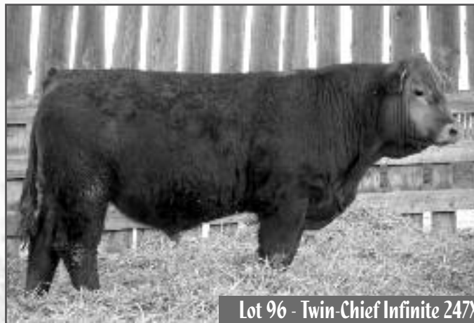
Lot 96 - Twin-Chief Infinite 247X