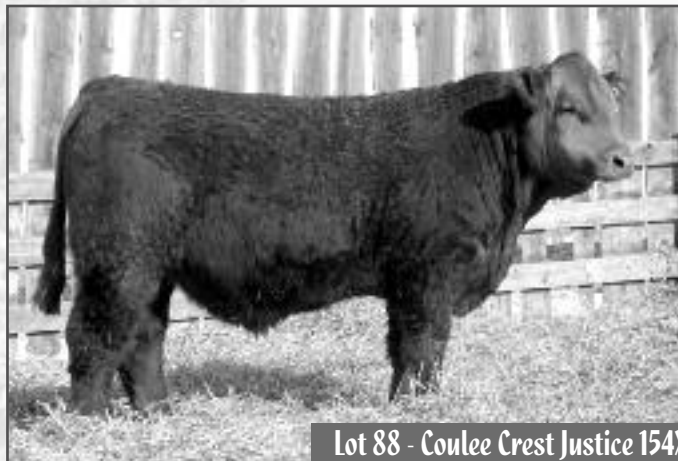
Lot 88 - Coulee Crest Justice 154X