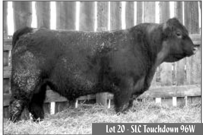
Lot 20 - SLC Touchdown 96W