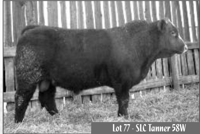
Lot 77 - SLC Tanner 58W