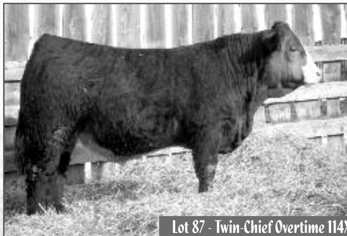
Lot 87 - Twin-Chief Overtime 114X