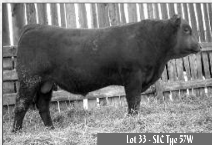
Lot 33 - SLC Tye 57W