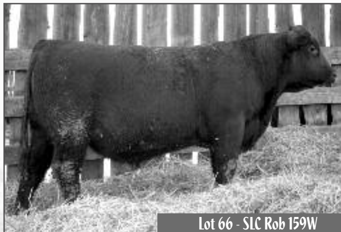
Lot 66 - SLC Rob 159W