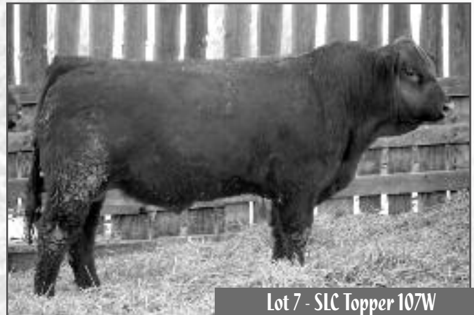
Lot 7 - SLC Topper 107W