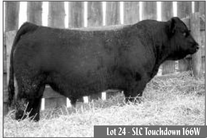
Lot 24 - SLC Touchdown 166W