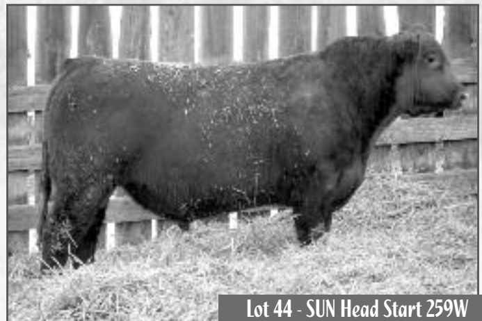
Lot 44 - SUN Head Start 259W