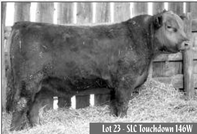
Lot 23 - SLC Touchdown 146W