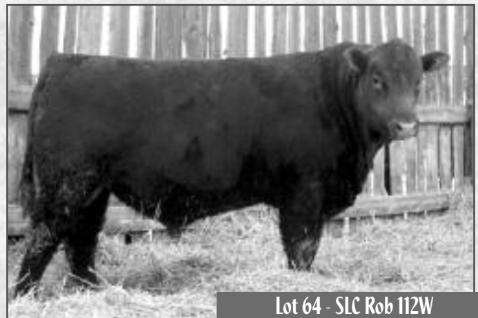
Lot 64 - SLC Rob 112W