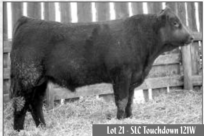
Lot 21 - SLC Touchdown 121W

TJB JAGERMEISTER 229M - ET SLC JAGERMEISTER 40R SFL SLC CHOTEAU SUE 95H SLC TOUCHDOWN 71T SLC FREEDOM 178F ET SLC FREE EMPRESS 32H SLC 218F SLC BLACK JACK 48F ET VG VALLEY BLACKJACK JR 37H VG VALLEY SC SWEETIE 80D SLC PARKLAND 7S XZR 165A SLC PARKLAND 200D (UNRECORDED)