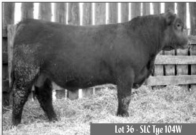
Lot 36 - SLC Tye 104W