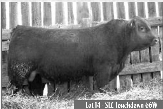
Lot 14 - SLC Touchdown 66W