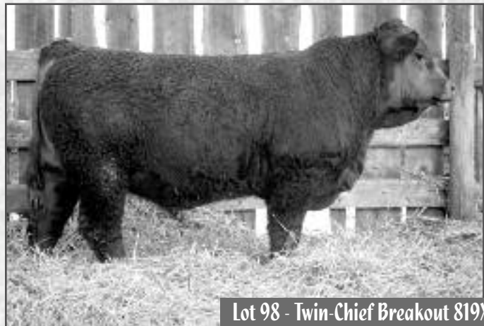
Lot 98 - Twin-Chief Breakout 819X