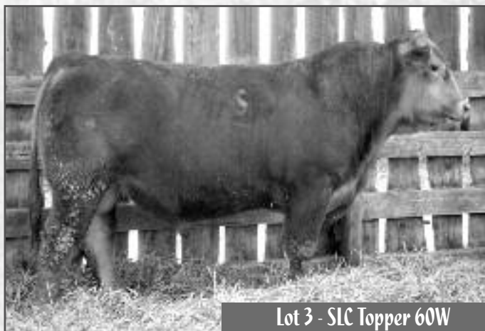
Lot 3 - SLC Topper 60W