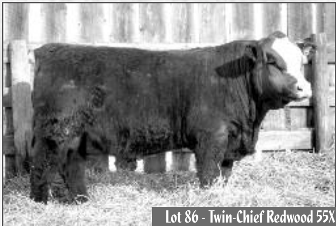
Lot 86 - Twin-Chief Redwood 55X