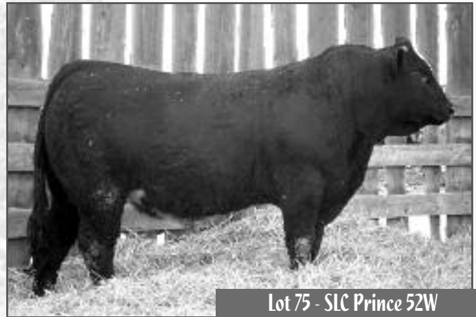
Lot 75 - SLC Prince 52W