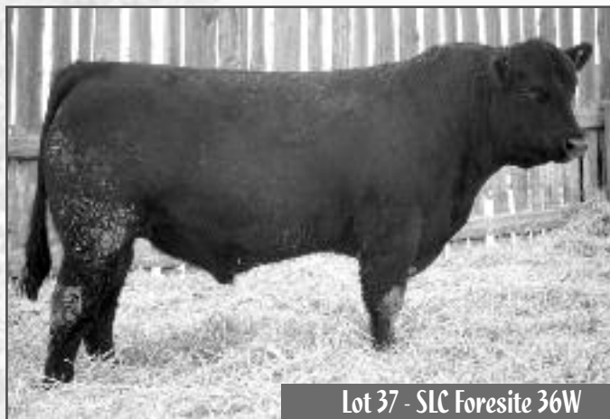
Lot 37 - SLC Foresite 36W