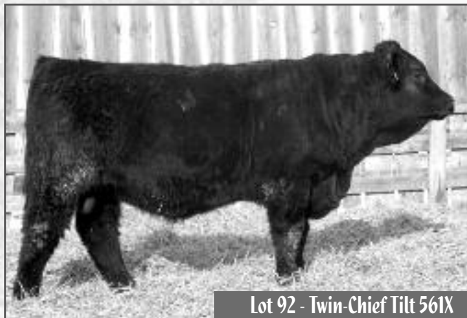
Lot 92 - Twin-Chief Tilt 561X