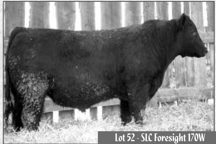
Lot 52 - SLC Foresight 170W