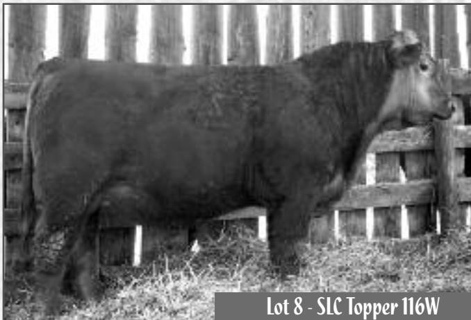
Lot 8 - SLC Topper 116W