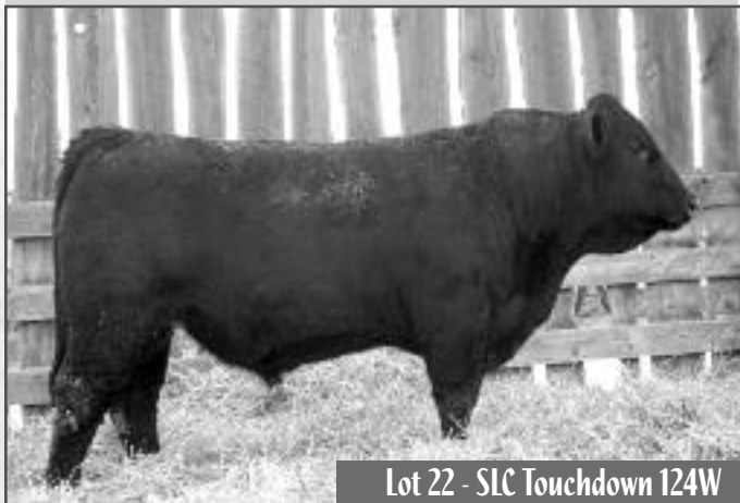
Lot 22 - SLC Touchdown 124W