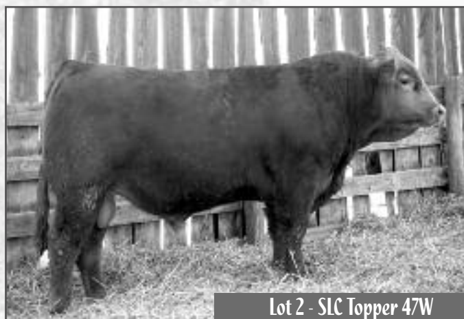
Lot 2 - SLC Topper 47W