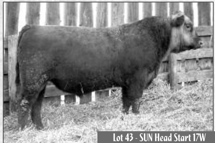
Lot 43 - SUN Head Start 17W