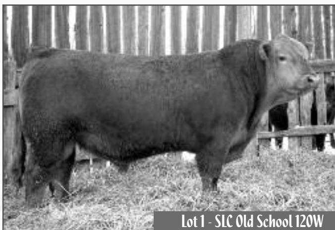
Lot 1 - SLC Old School 120W