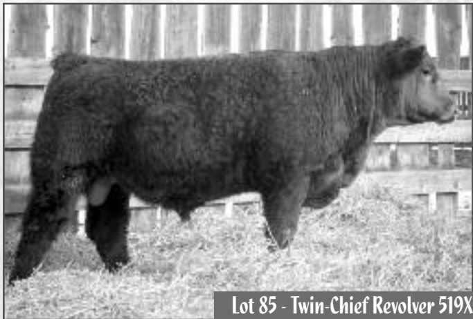
Lot 85 - Twin-Chief Revolver 519X