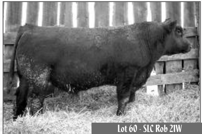
Lot 60 - SLC Rob 21W