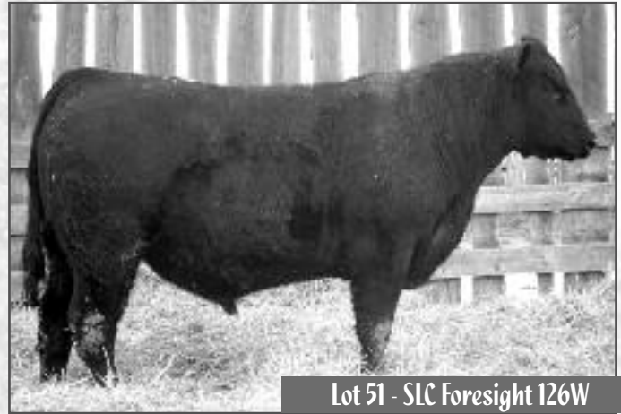
Lot 51 - SLC Foresight 126W