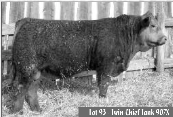
Lot 93 - Twin-Chief Tank 907X