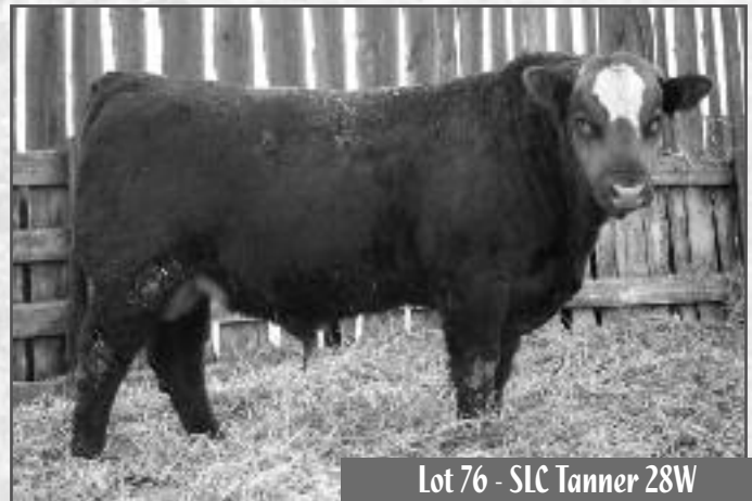
Lot 76 - SLC Tanner 28W