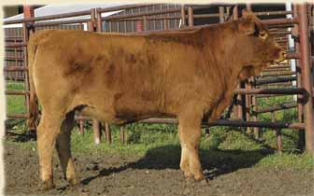
Lot 19 - KCC Yes Dad Shes Very Pretty

DDN Xtra Special's grand mother was purchased from the Winders in 2001. Every female she has raised has stayed in the herd. 0118X's mother's first calf weaned at 1060 lbs with a 3.29 lb ADG. Her calves weaning index have averaged 109. This gal is sired by one of the high selling bulls at V & V Sale in 2009. This heifer has been bred to be a great one.