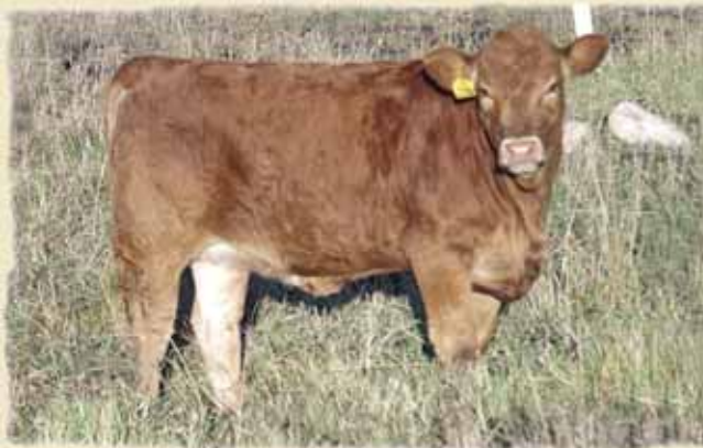
Lot 23 - EV Foxy-X 13X