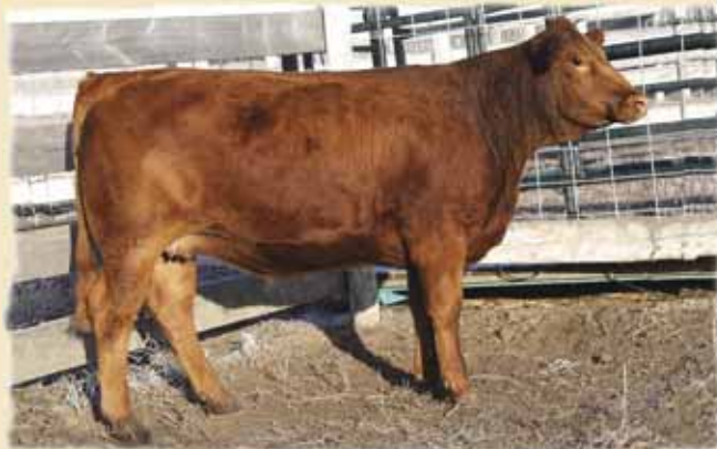
Lot 10 - VV Winnie 96W