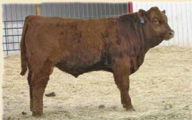
VV Ubet On Me 160U - Sire of Lot 18

DDN Belly River Xemplify's dam is a perfect picture in every way. 301N's calves consistently have a weaning index that averages over 100 and all her daughters have remained in the Nelson's herd. 0112X shows the thickness that comes from her outstanding genetics. With calving ease and growth potential she will certainly demand your attention.