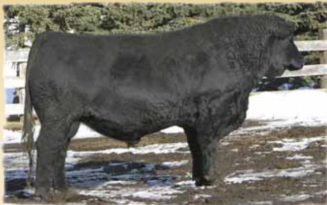
Elk Ck Iron Horse 42T - Sire of Lot 16 & 17