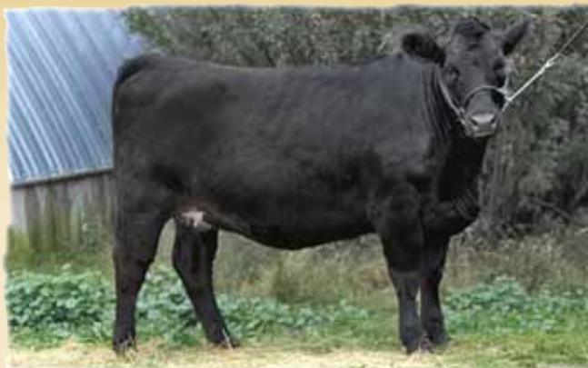
Lot 5 - TVR Wanda 10W

TVR Wanda 10W is a very fancy, feminine black daughter of SLC Latigo 118L and out of a top producing SLC Rated-R dam. You will appreciate the outstanding conformation and genetics that this gal can offer your program. Her service sire, STON 11W, was the high selling bull at the 2010 Saskatoon Gelbvieh Bull Sale. He will offer a tremendous set of EPD values.