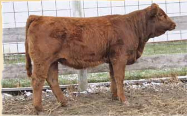
Lot 25 - VV Xtremley Hot 116X