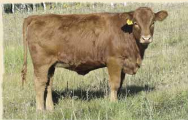
Lot 22 - EV Dam Good 6X

EV Dam Good 6X is developing as the Fecho's expected. She is very thick and moderate. She has Humbug 72H breeding on both sides of her pedigree. After Humdinger was sold to Stone Gate Farms, EYOT missed him so much they bought a son back. 6X is a gal that should add thickness and performance into her off spring.