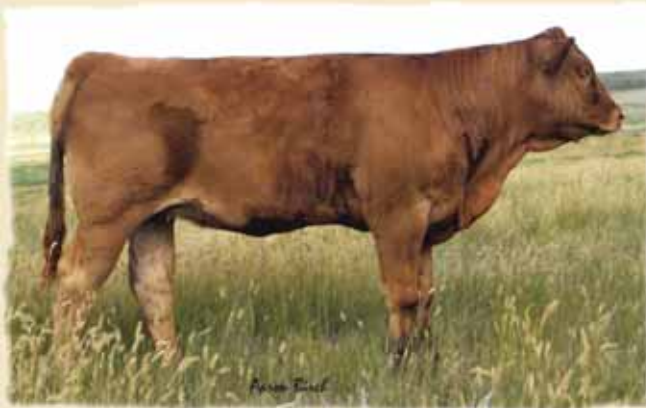
Donation Heifer - SA Birch's Faithful 65X