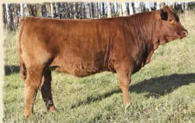
Lot 15 - CK Xanadu 71X

CK Xanadu 71X is sired by SLC Head Start 124T, a bull who has sure made his impact at Brittain Farms. She is out of a top producing young female in the herd. 71X has been a great one since birth. She is moderate framed, thick made and eye appealing.