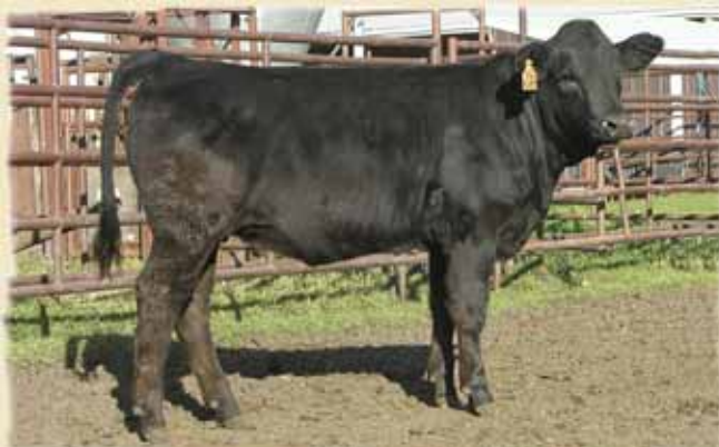
Lot 20 - JLD Xtra Toasty 42X

KCC 94X is a very attractive, thick made, well balanced brood cow prospect. Her dam, WL T30, is definitely proving her worth in the Ness program. If you are looking for that exceptional stout, heifer calf this gal should be on your list.