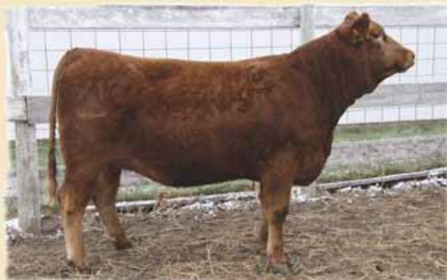
Lot 12 - VV Wilfrida 169W