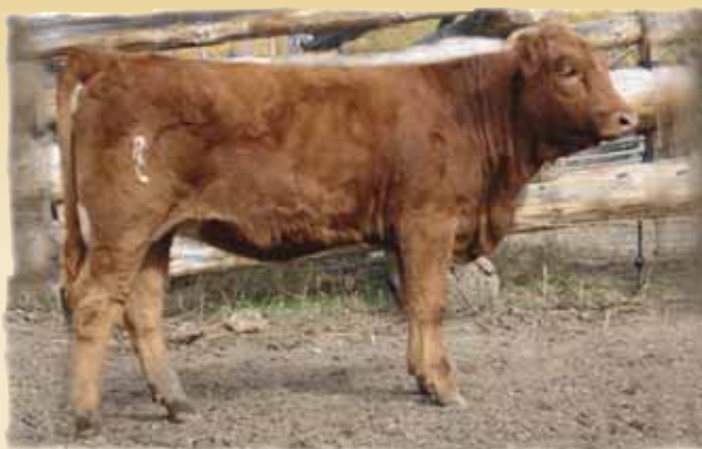
Lot 21 - RAC X's and O's 27X

RAC X's and O's 27X is a red, polled, long, thick female prospect out of two powerful cow families. 27X is sired by the 2007 People's Choice Futurity Champion and out of V V 27S who is leaving her mark at RAC Gelbvieh. Check out her exceptional EPDs.