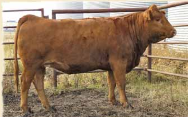
Lot 7 - FRSQ Foursquare Whisper 40W

This stylish heifer is dark cherry red, very smooth and feminine. She is out of an excellent cow and goes back to the WJW Jericho 644S a son of TJB Absolute. This heifer will be an excellent addition into anyone's herd.