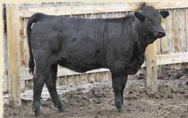
Lot 16 - DDN Belly River Xclusive

DDN Belly River Xclusive is one of only two Iron Horse heifers that may ever sell as Nelsons have lost this top herd sire. 061X comes a very moderate framed and perfectly uddered dam. She is a very feminine, classy gal with a well balanced set of EPDs that should fit in anyone's breeding program.