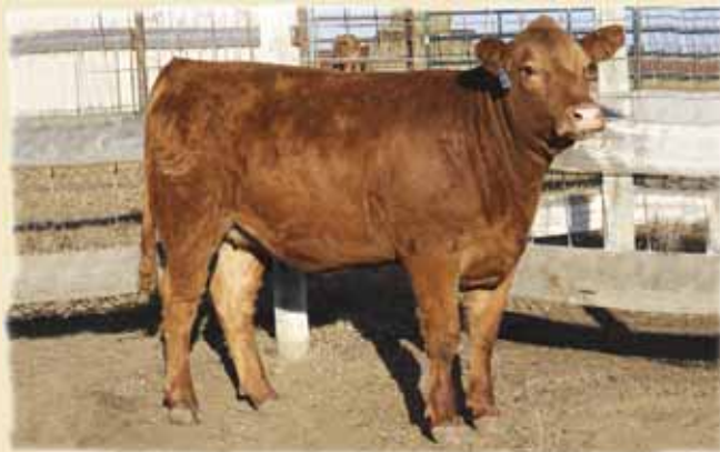
Lot 11 - VV Wendy 111W