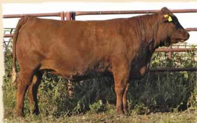
Lot 4 - KCC Who's The Red Head 75W