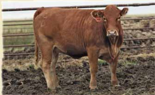
Lot 6 - TVR Who Are You 16W

TVR Who Are You 16W is sired by the high selling bull that Towerview purchased from the Watsons. Her dam, TVR 17S, is a direct daughter of GCC Newton - a genetic line that is very prominent in the Towerview breeding program. The fancy red female will definitely attract attention sale day. Her mating to STON 11W will bring awesome results.