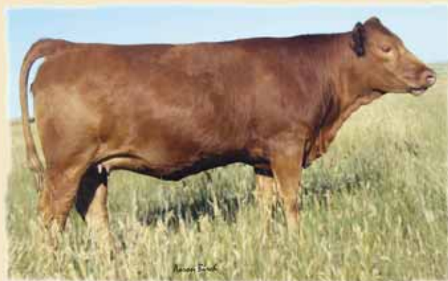
Lot 3 - SA Birch's Marion 73W