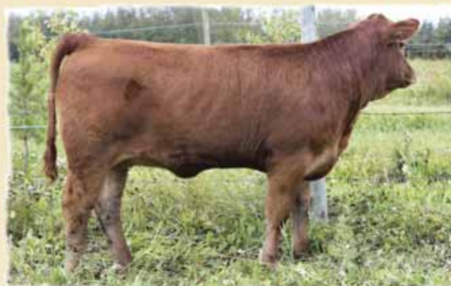
Lot 14 - CK Makita 33X

CK Makita 33X is from the junior herd sire, Undercover Agent 7U, at Brittain Farms. 7U's calves are stand outs at the farm. 33X's dam is a very easy fleshing, sound, functional female. 33X herself, is a dark red, deep sided female who is sure to be appreciated on sale day.