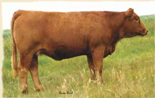
Lot 2 - SA Birch's Merit 37W