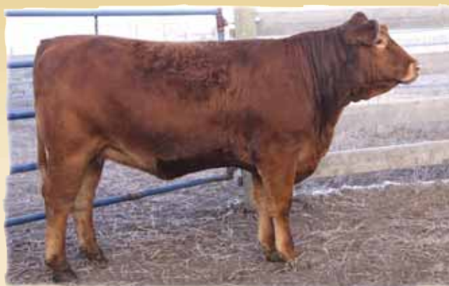
Lot 13 - VV Western Music 191W ET

V V Western Music 191W is the daughter of DF Profit 5D, a high selling bull when he was purchased to work in the V & V program. Her dam is by the Agribition Reserve Senior Champion Bull - V V Boodom. You will appreciate the style, femininity, and dark red colour that this female has to offer.