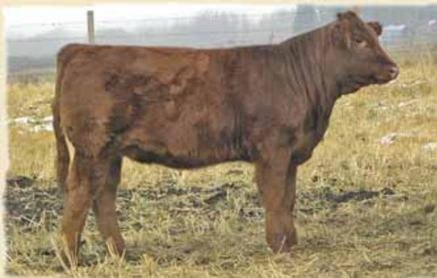
Lot 24 - SLC Charla 33X

SLC 33X is a dark cherry red, very feminine, well balanced female. The maternal side of her pedigree includes the Charla cow family and her grandam, 65M, has produced a high selling bull at Severtson's Annual Bull Sale. Be sure to check out 33X in Severtson's show string at Farmfair and Canadian National.