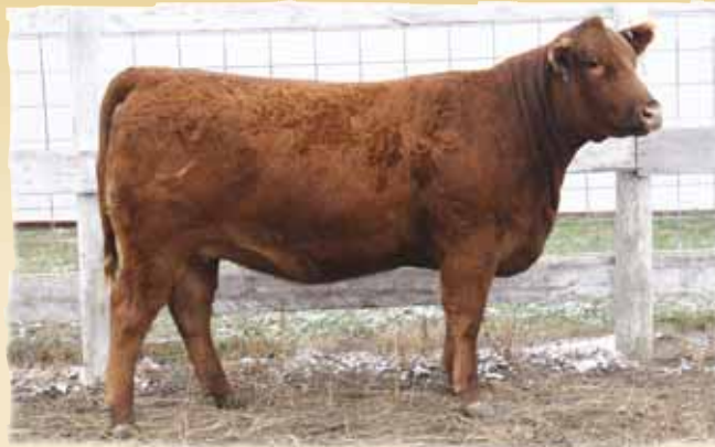
Lot 9 - VV WEstern Princess 45W