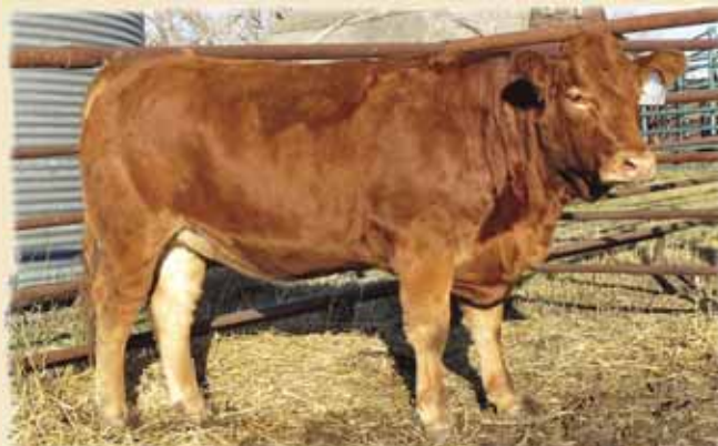
Lot 8 - FRSQ Foursquare Miss Wynne 63W

Here is a pen favorite of mine. This red heifer is a brood cow in the making, out of one of the top cows in Foursquare's herd. She is a Foursquare Rambo daughter and her dam is one of the original purebreds purchased from Twin Star Cattle Co, TSCC 248K. She has produced many top selling bull calves including her calf this year, who will sell at our bull sale in March.