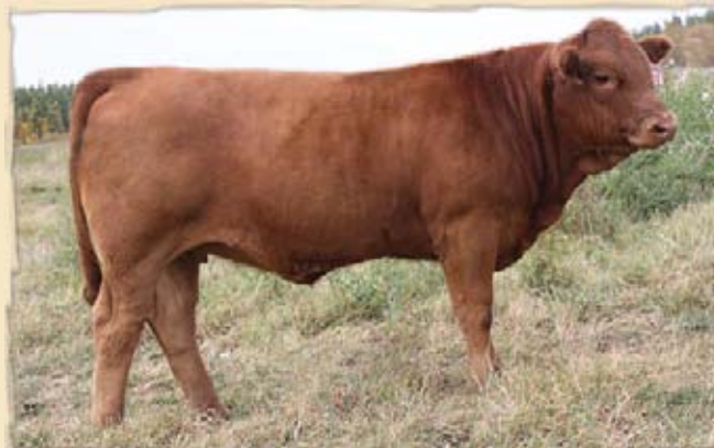
Lot 25 - CK Twilight 57Y

CK Twilight 57Y is sired by Brittain's new herd sire, ULL Salvador 43W and out of a first calf heifer sired by WGG Rawhide. Her grandam is one of the favourite cows at Brittain's and she is sired by the incomparable WGG 90J. She'll make a great brood cow.