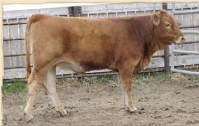
Lot 33 - TVR Towerview Yvonne 126Y

TVR 126Y is an elite female, the kind that is hard to come by. This will be the only female offered for sale this year sired by TVR 6W. Yvonne 126Y exudes cow power; she is very complete.