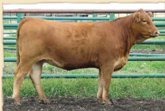
Lot 4 - DCC Ruby Red 26X