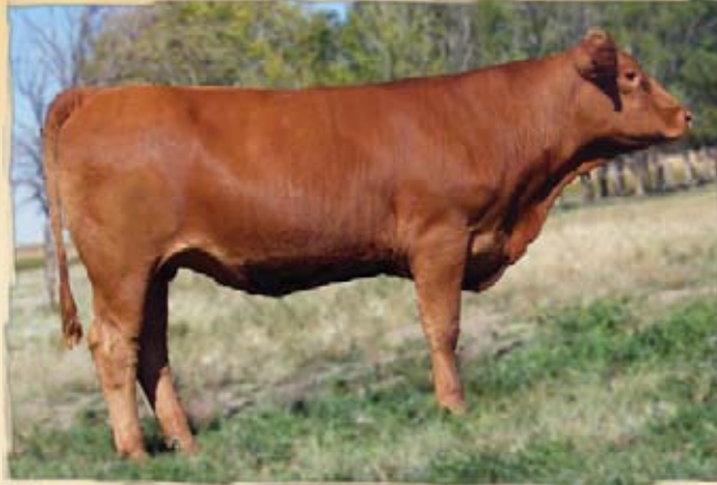
Lot 14 - AWB Birch's Jade 46X