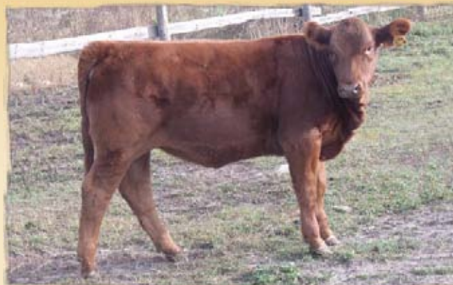
Lot 23 - EV Foxy 24Y

EV Foxy 24Y is a dark red, fancy heifer in a moderate frame. Her grandam 34R has been a consistent producer and you can expect the same from 24Y. There is loads of paternal power on the sire's side of her pedigree.