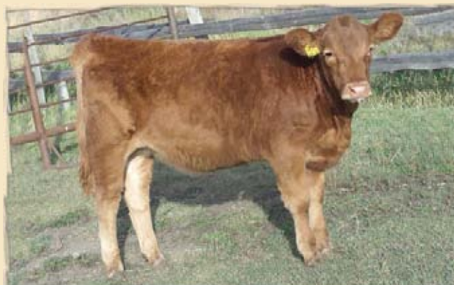
Lot 24 - Slam's Fox 53Y

EV Slam's Fox 53Y is a daughter of EV 10S, a Humdinger daughter who always produced a great one. 53Y is stylish, moderate and feminine. You should expect awesome offspring from this future brood cow.