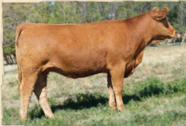
Lot 15 - AWB Birch's Lovebug 100X

Jade 46X is a long thick cherry red female with eye appeal to burn. Twin Bridge chose to add her dam and maternal sister to their breeding program from the RJD Gelbvieh Dispersal. Her sister's SLC Merv 49S sired son sold to Jen-Ty Gelbvieh. Jade should turn into a very productive female just like her dam and sister. Her mating to the outcross sire Totally Exposed should make for a great calf. Safe to AI.