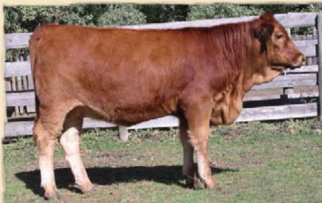
Lot 28 - BLC Yoko 76Y

BLC Yoko 76Y is another fancy, long bodied daughter of V V Peso 63T. You will not go wrong by adding these good Beamish heifers into your herd. They come from a great cow herd.