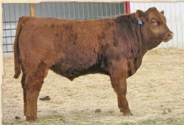
VV UBet On Me 160U - Sire of Lot 19

DDN Belly River X-Me-On 42X is a direct daughter of the high selling V V Ubet-On-Me 160U, a sire that has left a number of good females at the Nelsons. Her dam, 302N, is considered to be one of the prominent females in the herd.