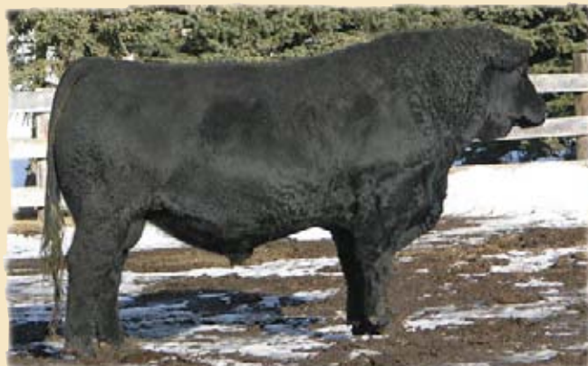
Elk Ck Iron Horse 42T - Sire of Lots 29 & 30