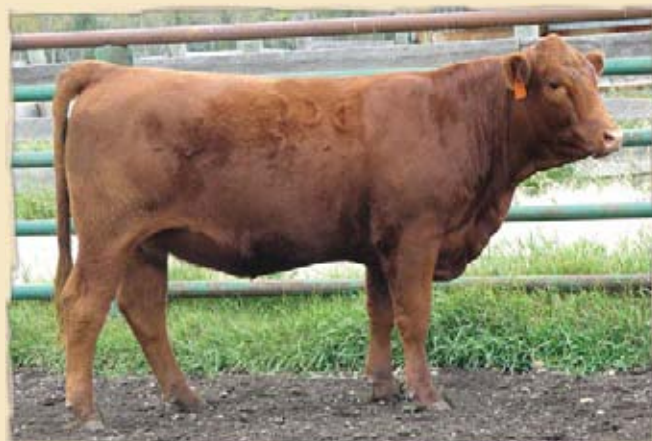
Lot 3 - DCC Rachel 21X