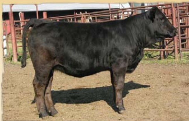
Lot 31 - KCC I Was His First 4Y