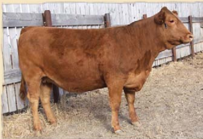
Lot 7 - VV Xtra Concerned 75X

VV Extra Concerned 75X is a very stylish dark red daughter of the calving ease sire Sir Arnold and out of the top producing SLC Rebello 14P dam. You are sure to be impressed with this brood cow prospect as the maternal side of her pedigree includes Remitall Polled Excel and DTJ Heavy Fire Power.