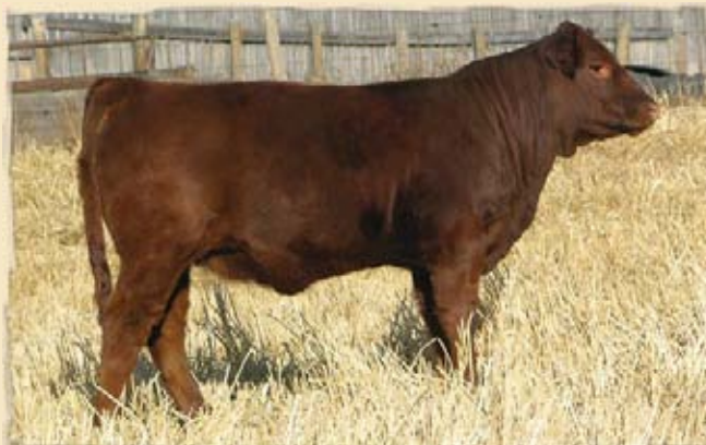
Lot 34 - SLC Lass 91Y

SLC Lass 91Y is as pretty as her picture. Sired by SLC Master Plan and out of one of the greatest cow families at SLC, you are sure to appreciate her future value to your herd. This cow family has produced many high sellers including the high selling bull at SLC's 2011 Bull Sale to V&V Farms, Redcliff, AB for $16,000. Check her out at Farm Fair.