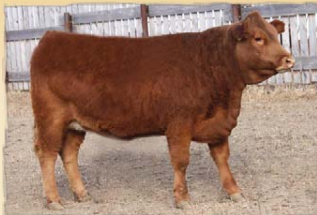
Lot 11 - VV Xternal Element 210X

V V Xternal Element 210X is a moderate, thick, easy keeping daughter of the high selling bull at Severson's - SLC Tye 476T. Note the Leachman New Day and Davidson breeding on the dam's side of her pedigree.