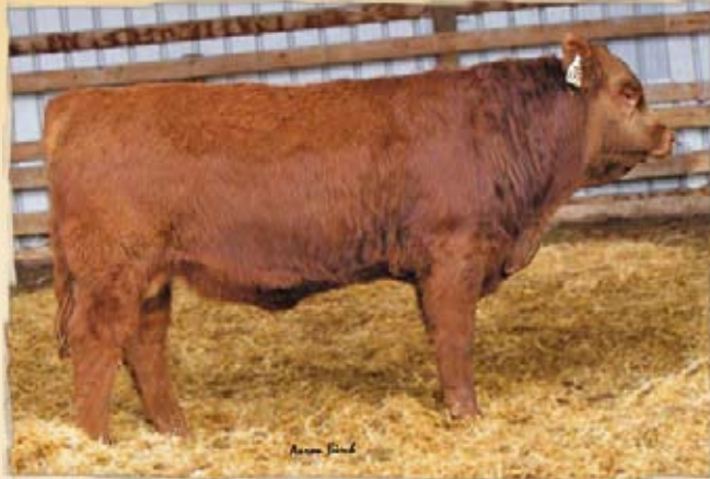
AWB Birch's Iron Man 35X - Service Sire on Lots 19 & 20