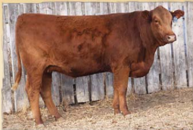
Lot 8 - VV Xtra Keen 86X