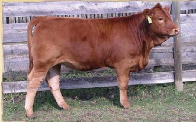
Lot 27 - BLC Yesterday 50Y