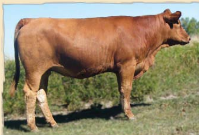
Lot 12 - SA Birch's Nina 95X

Nina 95X is a feminine eye catching female that is sure to turn into a great brood cow. Her Deletor sired dam has become a great producer including an ATC Gold Star 5D daughter that got a lot of attention in our show string last fall. Twin Bridge were so happy with her sister they were sure to mate 95X to 5D. Safe to AI.