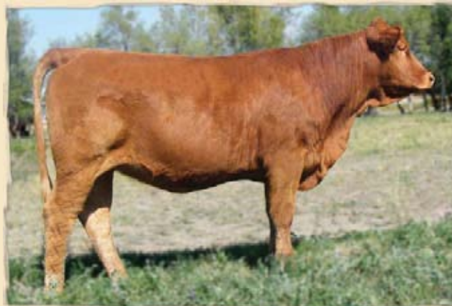
Lot 13 - SA Birch's Disco 101X

SA Disco 101X is a thick strong performing female with a terrific set of EPDs. The Disco family is easily one of Twin Bridge's best and it has produced many 4-H champions including 101X's grandmother who was a Grand Champion Female. This female should produce the type of bulls that commercial cattlemen are after.