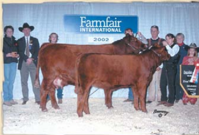
AR Julie 14J - Dam of Lot 36 Embryos