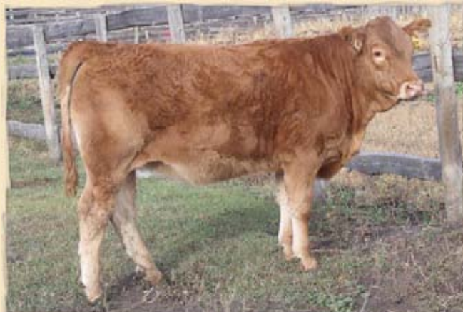
Lot 22 - EV Melissa 11Y

EV Angel 6Y is a very stylish, easy fleshing daughter of XXB Big N' Rich 911P and out of a great producing young dam. With lots of depth and hair this moderate female already shows her broodiness.