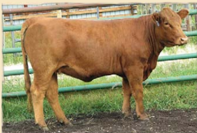
Lot 2 - GCC Ribbon 11X