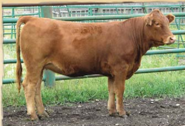
Lot 5 - GCC Vixen 27X

Vixen is a moderate heifer with a powerful top and loads of eye appeal. Her maternal side traces to SLC Empire 31E, a sire know for producing superior udder quality. Observed bred May 26, 2011.