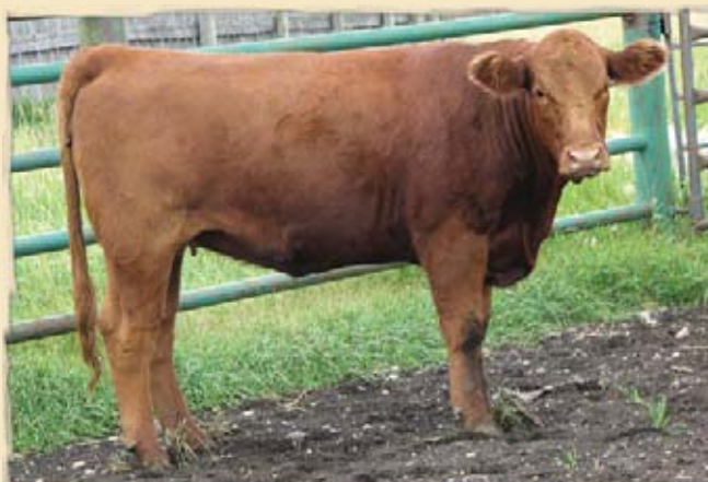
Lot 6 - GCC Lory 36X

P/E April 30 to July 13, 2011 to GCC Chronicle 9WGCC Lory 36X is another outstanding daughter of Showdown 3S. She exhibits structural soundness and is a long bodied, dark red brood cow prospect. Expect her red February calf sired by Chronicle to be born with ease.