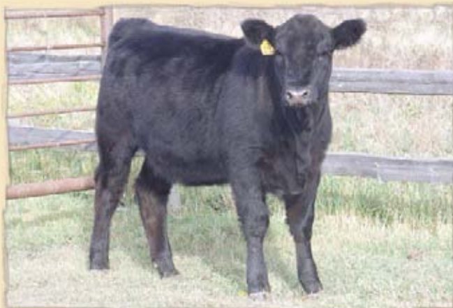
Lot 21 - EV Angel 6Y