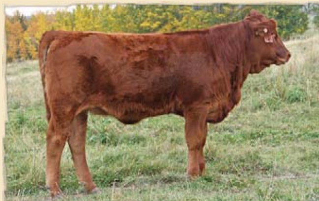
Lot 26 - CK Diva 146Y

CK Diva 146Y is one of the youngest calves in the herd this year but she sure has performed well keeping up to her contemporaries. This dark red daughter of OHF Pld Titan is sure to attract your attention.