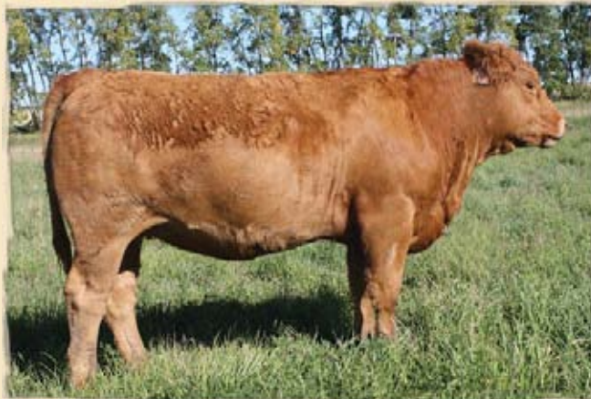
Lot 16 - CK Thea 18X

AWB 100X is a very well put together bred heifer that is going to be one of those easy fleshing moderate females that always out produces herself. She comes from a great cow family being a great granddaughter of the great WGG Miss Wind 8B, Calgary Stampede Supreme Champion Female. The first set of Tiree daughters have turned into a great set of brood cows. Her service to Fir River Exposure should be very successful as he has become one of Birch's top producing sires. Safe to AI.