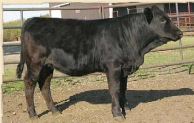
Lot 32 - JLD Miss Bee Haven 53Y

JLD Miss Bee Haven 53Y is a real sweetheart. She is moderate framed, long bodied and shows a good meaty thickness. This gal was only 6.4% of her dam's body weight at birth.