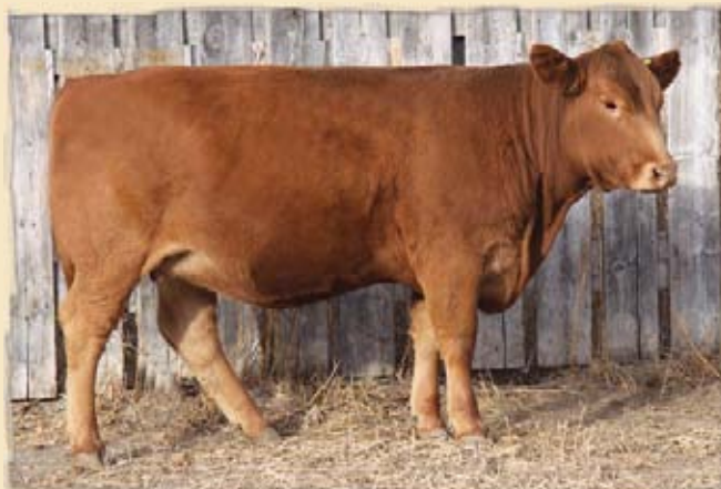
Lot 9 - VV Xmas 114X

V V Xtra Keen 86X is sired by the Leachman Chronicle bull, a sire whose calves have been widely accepted in both the show and sale ring. What could be better than having two of the great Gelbvieh sires on the dam's side of the pedigree - GT Louie and Freedom.