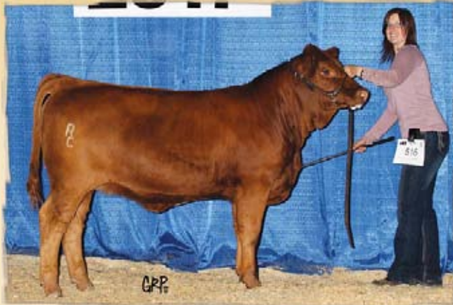
Lot 35 - COX You're Sugar & Spice 24Y