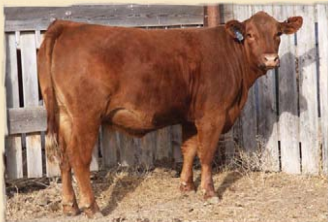
Lot 10 - VV Xplosive Gal 167X

V V Xmas 114X is a very fancy, feminine daughter of the high selling top producing sire, VCR Six Pack. His sons have been well accepted at V & V Farms Annual Bull Sale. The dam, bred in the Goodview program, has become a very reliable brood cow at the Pancoasts.