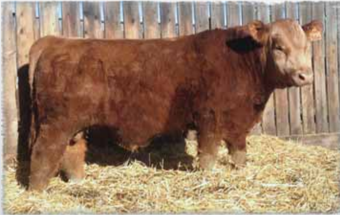
Lot 38 - CCC Gold Star Adam 36A