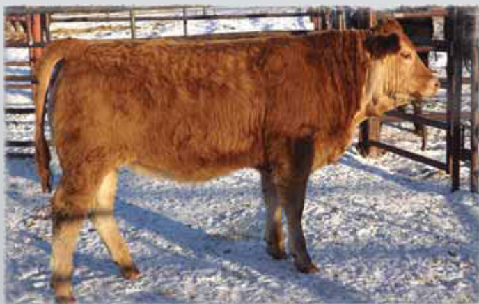
Lot 60 - KCC Keriness Trader 94A

KCC 81A is a very strong, feminine female with top maternal genetics. She will become a great brood cow.