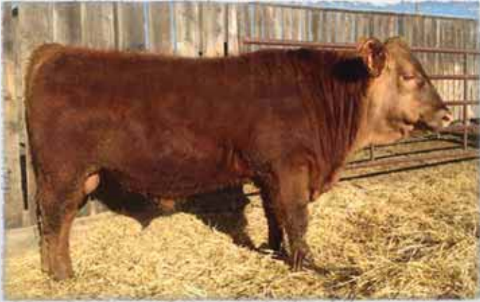
Lot 46 - CCC 12A