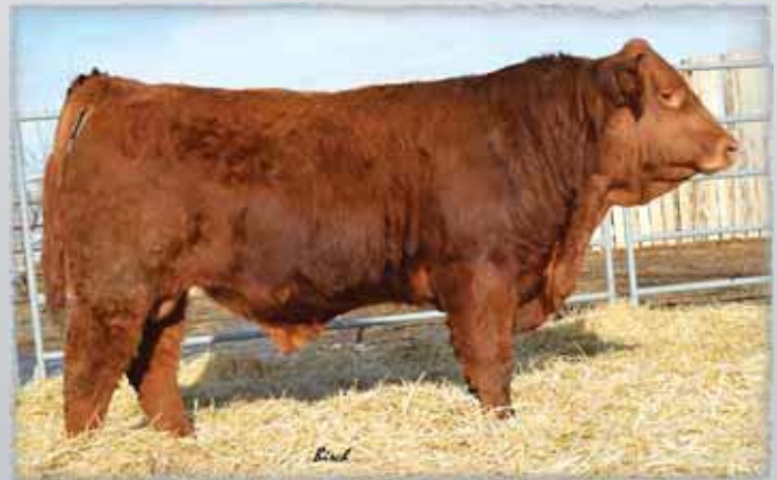
Lot 10 - SA Birch's Happy Hour 92A