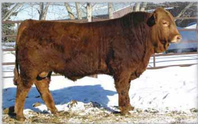
Lot 53 - KCC Heavy Asset 266A