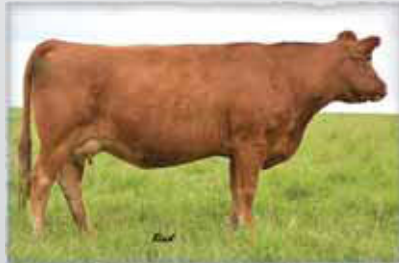
SA Birch's Verna 82S - Dam of Lot 9

This herd sire prospect is going to make a lot of friends sale day. You don't often come across a bull, in any breed, with the amount of volume and capacity that Bulldozer has. When looking at him you can just imagine those thick soggy calves the feedlots search for and those broody females that we all want in our cow herds. He will be sure to make a big impact on someone's program. It is no surprise this bull is from the Verna cow family. His eye catching dam is a Dam of Merit and grand dam is a Dam of Distinction. A maternal sister sold in last year's Gelbvieh Wish List Sale to Davidson Gelbvieh. 50% Leptin positive.