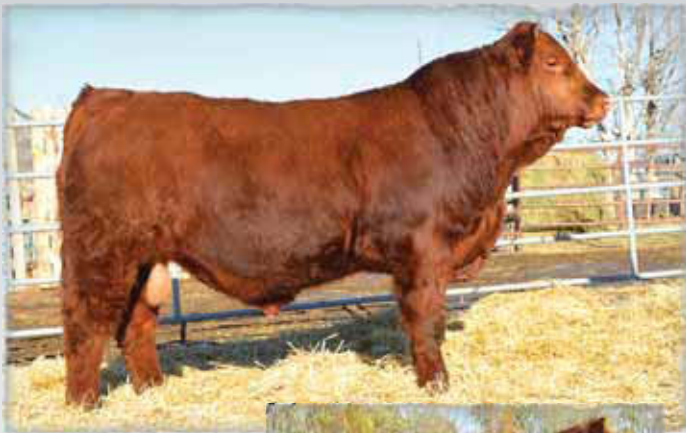
Lot 21 - SA Birch's Marshall 178A