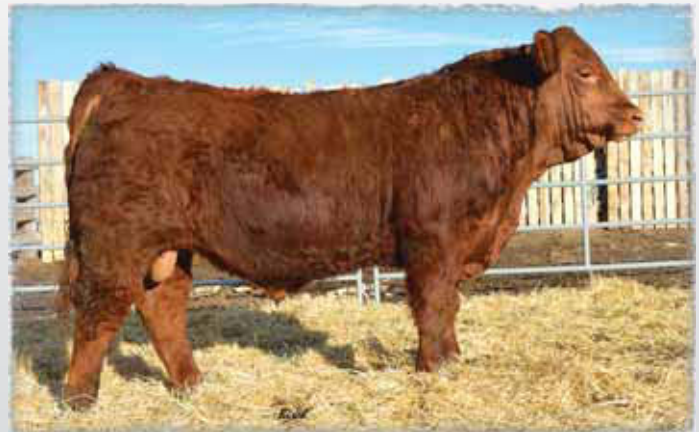
Lot 15 - AWB Birch's Lance 79A

Here is an extremely eye catching bull with lots of thickness and extension. He has that thick Yoicks hair coat that we are finding more and more beneficial in our cattle. He comes from a good cow family originating from Carlson's program and includes some great sires including Post Rock Top Brass and Gold Star Polled 5D. His dam has the same cherry red colour and a picture perfect udder. A son sold in last year's sale to V&V Farms and a daughter is one of our top young females. 50% Leptin positive.