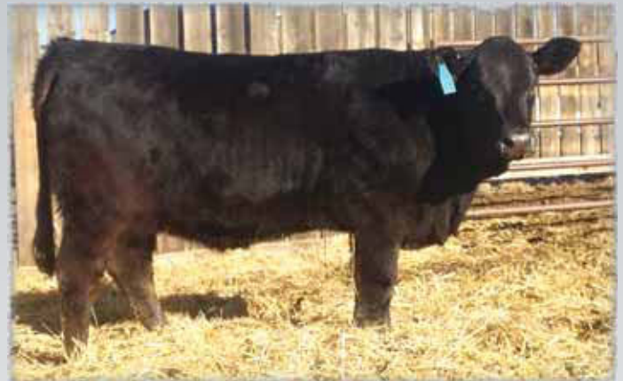
Lot 51 - CCC Gold Star Alexa 59A

This black prospect heifer is a granddaughter to Davidson Harmony 446J and ATC Gold Star 4W. She is a fine fronted female with great eye appeal - despite her lack of cooperation picture day! The dam, Gold Star Lale 268L, continues to maintain good feet and udder which is important for longevity. Alexa has a mild disposition, moderate thickness, with a great hair coat and would make an excellent addition to any cow herd.