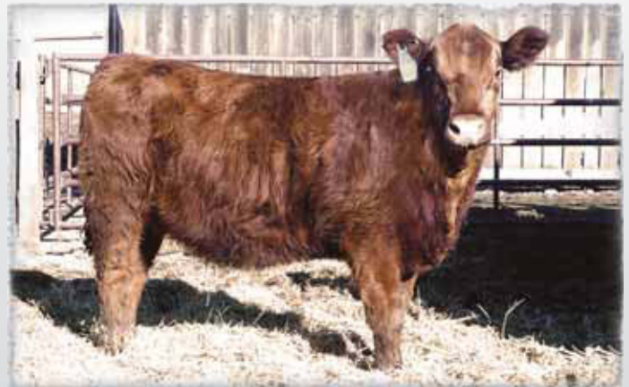
LOT 49 - CCC Gold Star Annabelle 15A

Annabelle is a darker red female with a good hair coat and a clean front end. She has a low 65 lb BW and above average CE and BW EPDs. Her depth of rib and straight back line help to contribute to her eye appeal. Breed her to a performance bull and you have the makings of a champion.