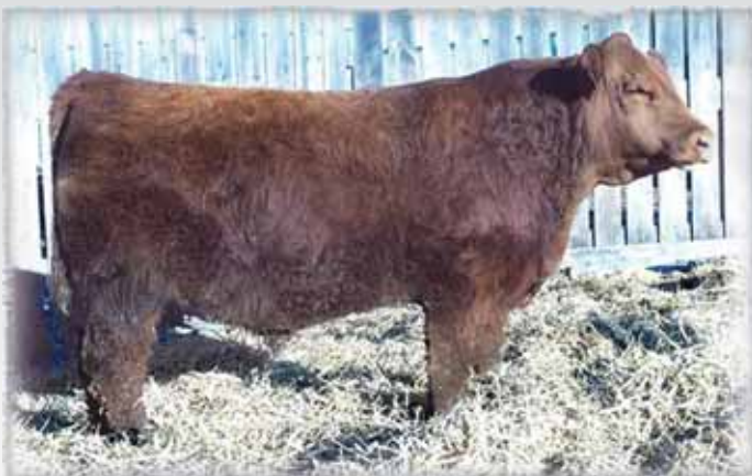
Lot 40 - CCC Gold Star Arthur 77A

Apollo is a product of Gold Star 197P, a 10 year old daughter of Gold Star 5D. His dam continues to have exceptional eye appeal and a great udder. Apollo has performed well on test with an ADG of over 3.37 lbs per day. 50% Leptin positive.