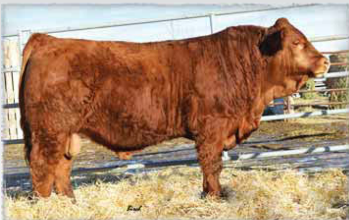
Lot 2 - SA Birch's Load Up 61A