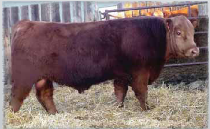
Lot 35 - CCC Gold Star Albert 28A

We are very proud of Albert. He is a dark red, calving ease bull that combines length, thickness and depth of rib in an attractive muscle pattern. The dam, Gold Star Salinas 163S, is an 8 year old deep bodied Gelbvieh styled cow with an ideal udder that goes back to Gold Star 49C. 100% Leptin positive.