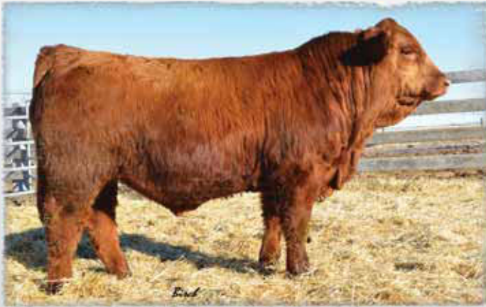
Lot 25 - AWB Birch's Total Recall 33A