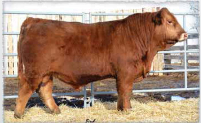
Lot 9 - SA Birch's Bulldozer 81A