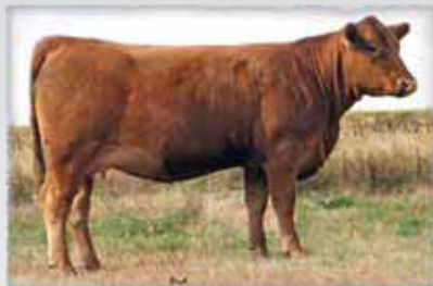
SA Birch's Wruffle 11Y - Dam of Lot 5

Here is a calf that is going to get a lot of attention on sale day. He is very smooth fronted and angular with a wide topline and big hip. He really showcases what his sire can do. His dam was part of our show sting as a bred heifer and did a great job raising her fist calf. She also has an impressive pedigree. Her sire, Master Plan, sires progeny that have a rare combination of thickness and eye appeal and have done well in show and sale rings across North America. Her dam is our donor female that was our pick of V&V Farms' heifer calves and has reached Dam of Merit status. She has already produced some great individuals in our program including our junior herd sire AWB Birch's Blk Powder 37Z and her 2013 son that sells in this sale. Homozygous Polled pending. 50% Leptin positive.