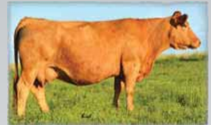
SA Birch's Marion 101S - Dam of Lot 20