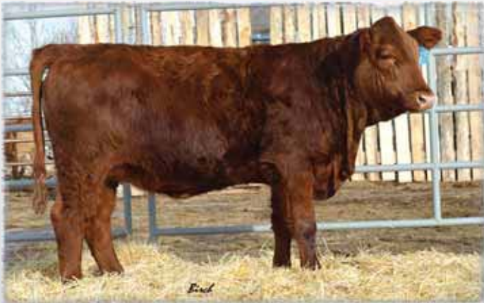
Lot 32 - SA Birch's Thora 157A