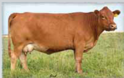
SA Birch's Daisy 16U - Dam of Lot 17

121A is a deep bodied calf that should be very easy fleshing. He has loads of cherry red hair. His dam is a broody Heavy Equipment daughter with a great udder. She has become a great producer including a daughter that sold in the Wish List Sale to Foursquare Gelbvieh and 3 more daughters that have been retained in our program. Twin raised as single. 100% Leptin positive.