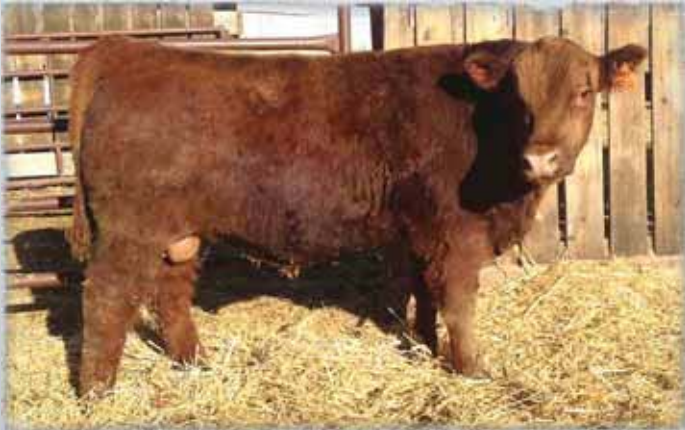
Lot 47 - CCC 18A

This commercial bull is one of the heaviest in the pen with a January 18 weight of 1313 lbs and a solid ADG of 4.48 while on test. He is out of a purebred Dam, ATC 277T, that goes back to SLK Super Jet 23K. A very interesting, extra large, deep bodied, red, commercial herd sire prospect. 100% Leptin positive.