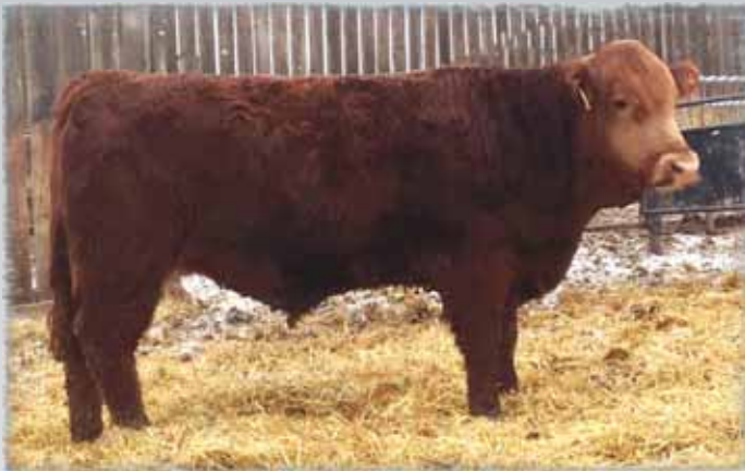
Lot 40 - CCC Gold Star Apollo 60A

With an 85 lb. BW and an above average WW, Milk and TM EPDs this eye appealing calving ease bull combines performance and maternal strength. Adam displays good depth of rib and muscling rarely found in low birth weight cattle. A sure bet to complement any herd. 100% Leptin positive.