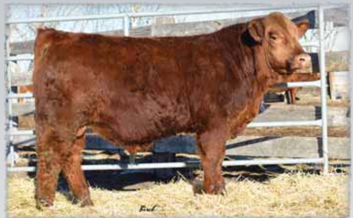
Lot 17 - SA Birch's Gambler 121A