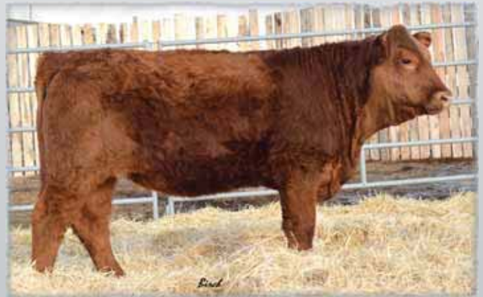
Lot 29 - AWB Birch's Sacha 116A

Here is a thick powerful female with a bright future. She has a unique pedigree on the top side. Thor was a bull we used to cover a few females and now wish we would have used him heavier. He gave us a super set of females. Sacha 116A's dam is a moderate framed female with a good udder that was our pick of the bred heifers in the Unger Land & Livestock Dispersal. A son is working for Roy & Gaye Lucas.