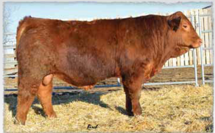
Lot 11 - SA Birch's Daytona 27A