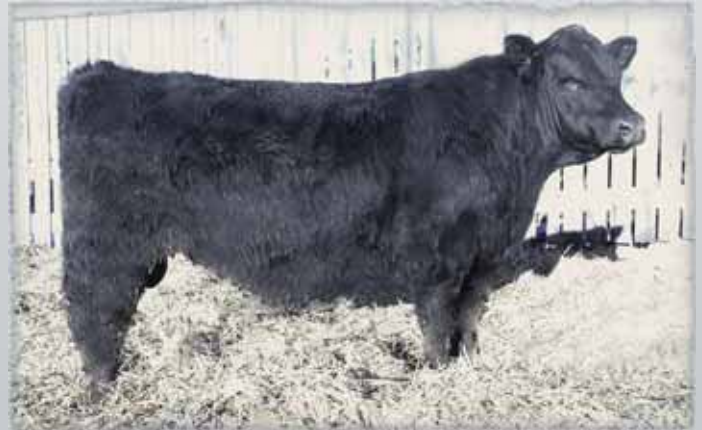
Lot 43 - CCC 3A

This commercial bull is a big, long, performance minded herd prospect. His dam is one of our yearly top performers with an outstanding udder. He comes to you out of a black half blood cow that goes back to Ridge Star Lucy 94L and a red half blood top performing bull out of Gold Star19S. 50% Leptin positive.