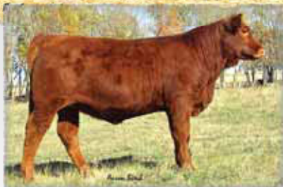
SA Birch's Marion 45U Dam of Lot 21