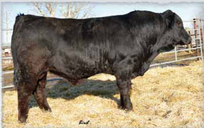
Lot 14 - AWB Birch's Black Magic 69A