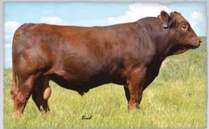
VV Yoicks 107Y