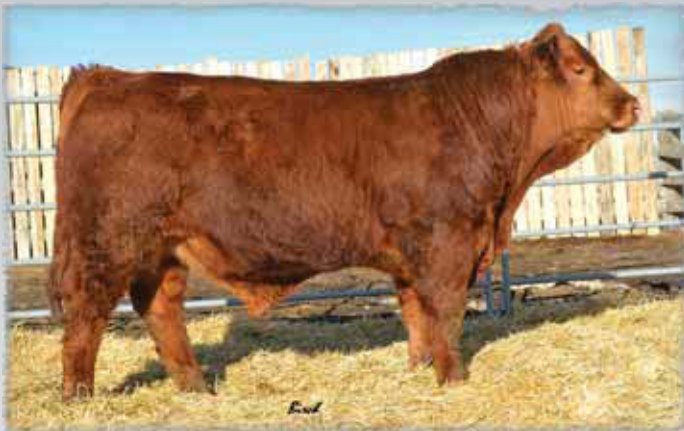
Lot 1 - AWB Birch's Heavy Hauler 14A