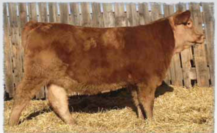
Lot 52 - CCC Gold Star Aliza 1400A

This feminine heifer has a great hair coat and good structure. The 11 year old dam still has a great udder and feet which should contribute to longevity in her progeny. If you are looking for a heifer that is eye appealing with good structure and balance, Aliza 1400A is an ideal replacement choice.