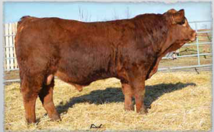
Lot 16 - SA Birch's Bandit 114A