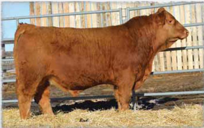
Lot 6 - SA Birch's Cruise 23A