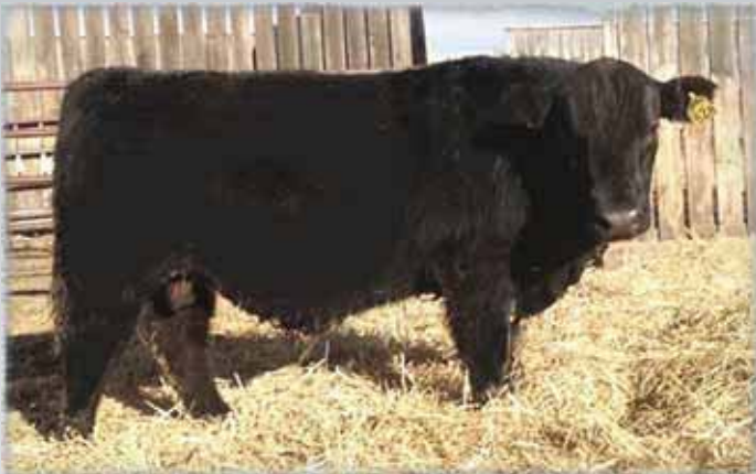
Lot 48 - CCC 52A

18A is a strong Angus influence commercial bull with a popular dark red hair coat. This attractive calf with a 70 BW has built in calving ease for heifers but enough performance for cows. He has gained 3.29 lbs per day while on test and has good depth of rib and thickness. 100% Leptin positive.