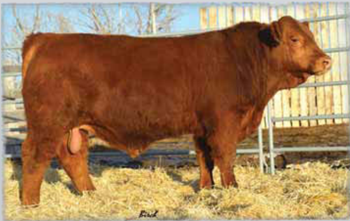
Lot 20 - SA Birch's Monopoly 168A