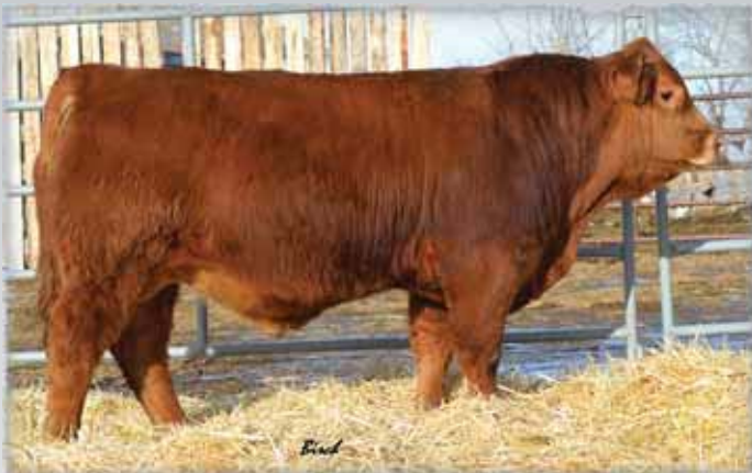
Lot 27 - AWB Birch's Outlaw 176A