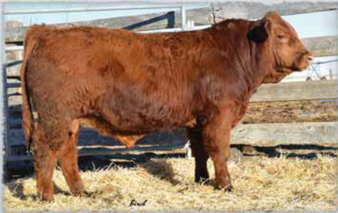
Lot 26 - SA Birch's Infinity 54A