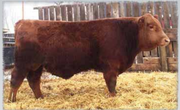
Lot 44 - CCC 9A

9A is one of our top performing commercial bulls with extra depth and spring of rib combined with excellent muscling to make this maternally strong bull very appealing. He is the product of one of our eye appealing purebred Angus cows and a half blood high performing Gelbvieh sire, making him 75% Angus. He retains some of the stronger Gelbvieh traits making him a good crossbred herd sire. 100% Leptin positive.