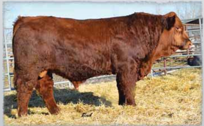
Lot 3 - AWB Birch's Momentum 3A

Baxter has a surprising amount of thickness considering he could be used on heifers. His pedigree is stacked with three generations of sires that not only calve easily but make great females. The Beryl cow family is one of our "up and coming" group of females that have really started to set themselves apart the last few years. Although they may be smaller framed females they produce big calves that stand out. Homozygous Polled pending. 50% Leptin positive.