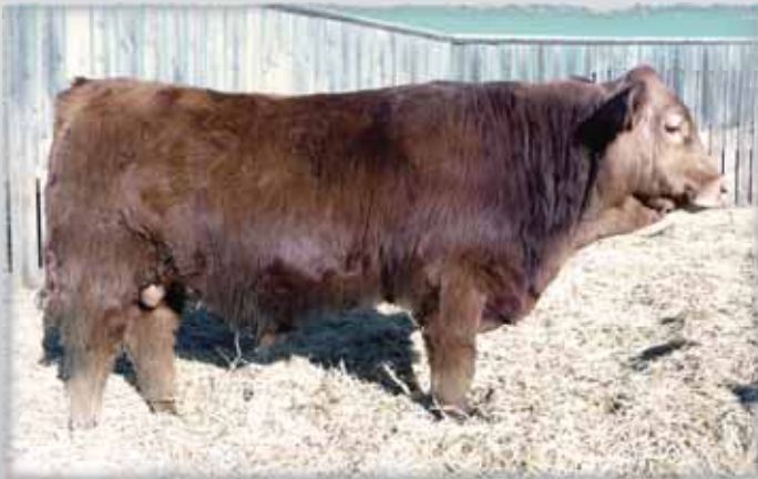
Lot 39 - CCC Gold Star Adam 54A

Adam has great performance averaging well over 4 lbs per day on test coupled with above average EPDS on WW, Milk and TM. This maternal, well balanced herd prospect should help push down the scale on his calves in the fall. 100% Leptin positive.