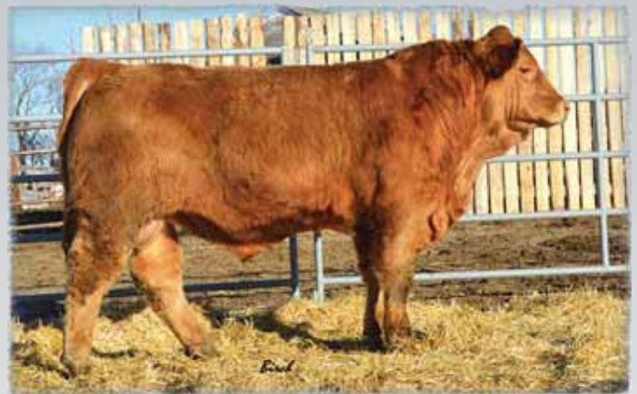
Lot 23 - SA Birch's Card Shark 62A