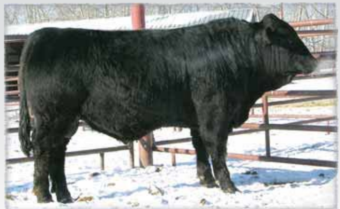
Lot 58 - KCC Keriness Superior 111A

11A is a black prospect that has plenty of natural thickness, depth and muscle. He too has an excellent disposition and will add nothing but pounds into his calves.