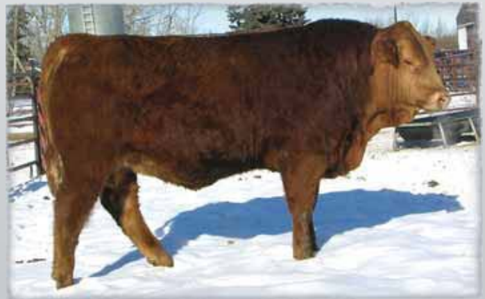
Lot 56 - KCC Keriness Sonic 99A

KCC 99A is a very smooth made, eye appealing bull who has plenty of depth and muscle. This easy moving bull will certainly cover the pasture.