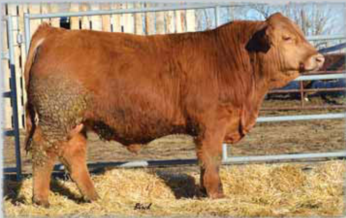
Lot 7 - SA Birch's Victor 10A