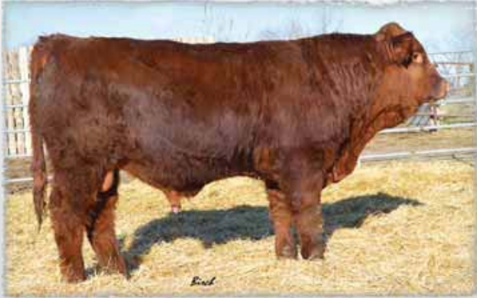
Lot 12 - AWB Birch's Back Draft 32A