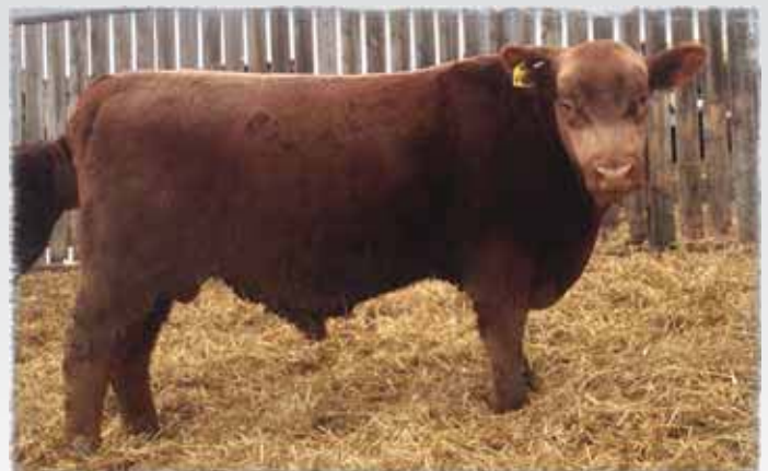
Lot 45 - CCC 10A

Here is another commercial bull that exhibits thickness, length and eye appeal. His 8 year old Dam, ATC 197S, is one of our maternal purebreds that goes back to Gold Star 5D. Our high performing half blood Gelbvieh bull was his sire, which makes him a 75% Gelbvieh bull. 10A is another very complete and well balanced herd bull. 50% Leptin positive.