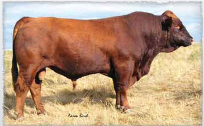
VV Tiree 150T

Momentum is a cherry red, smooth made bull that can be used on heifers without sacrificing performance. With only an 80lb BW he is one of our top gainers at 3.9 lbs/day. His dam is a full sib to our Captain sire and is a female that we are positive will continue to produce the right type, just like her dam. By combining the Morgan cow family and Tiree you can be assured that this herd sire prospect will be consistent in siring cattle that include all the desirable traits of the Gelbvieh breed. Homozygous Polled pending. 100% Leptin positive.