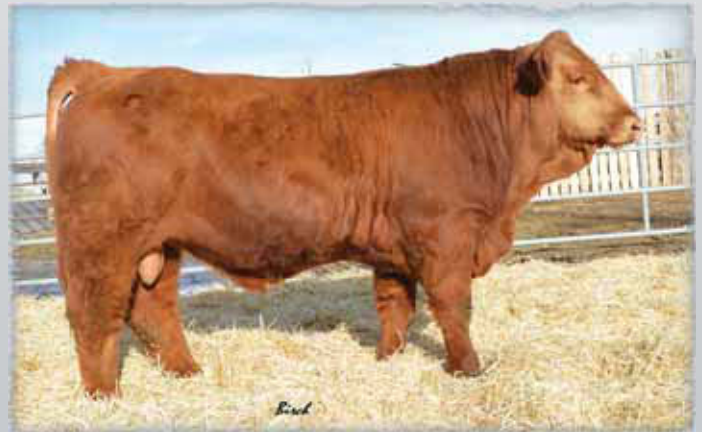
Lot 22 - SA Birch's High Roller 50A