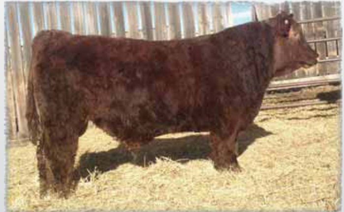
Lot 34 - CCC Gold Star Alistair 24A

Gold Star Alistair 24A is a big, long, excellent muscling herd bull. The dam, Ridge Star Unice 329U, is one of the most attractive cows in our herd, dark red and deep bodied with a perfect udder. Alistair is also that rich dark cherry red that is in demand, coupled with an extremely gentle demeanor that is sure to make a great addition to any cow herd. 100% Leptin positive.