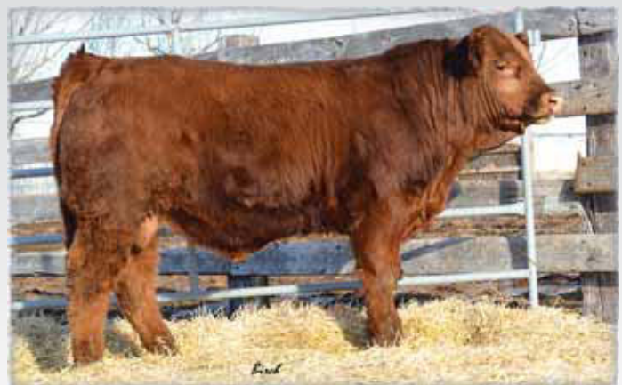
Lot 18 - SA Birch's Power Play 161A

Power Play is a thick made calf that is going to be more moderate framed than Yoicks's typical progeny. With Rally Lou and Yoicks in his pedigree his calves should have plenty of performance. He comes from the same cow family as one of our top selling bulls in last year's sale. 50% Leptin positive.