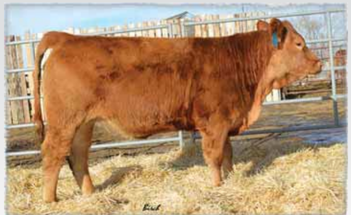
Lot 31 - SA Birch's Faithful 46A