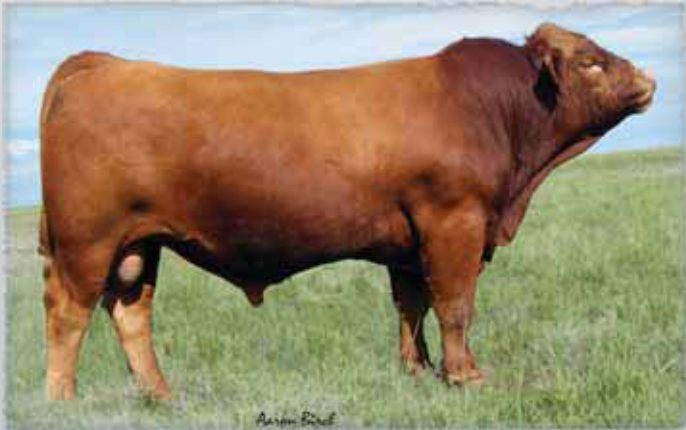
FRL Fir River Exposure 8U ET