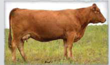
ULL Savanna 45S - Dam of Lot 19

Jet Pack is a very correct made bull with lots of extension through his front end and plenty of thickness and eye appeal. His dam is a front pasture type of cow that has produced well since she was purchased from the Unger Land & Livestock Dispersal. Its bulls from cows like 45S that we like to keep replacements from. 100% Leptin positive.