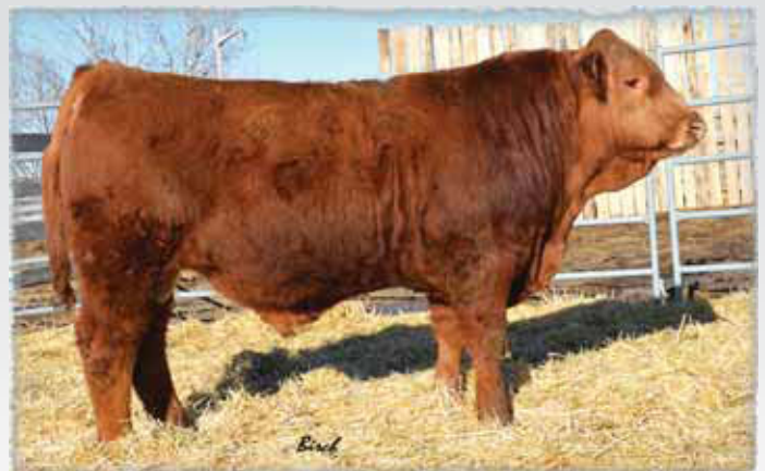
Lot 24 - SA Birch's Premium 162A