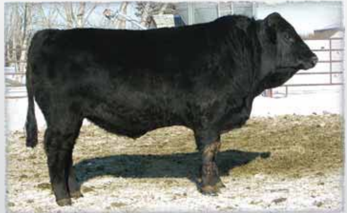
Lot 55 - KCC Keriness Ultraston 96A

KDD 96A is a thick, deep bodied meat machine who will add pounds into his calf crop. He has the hip and length to get the job done.