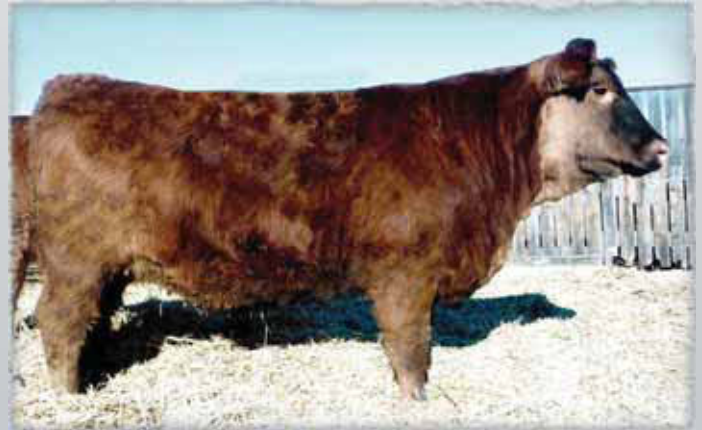
Lot 50 - CCC Gold Star Aleisha 27A

Alesha is an extremely long and deep heifer with solid performance. She has above average EPDs for BW, WW, YW and Milk. Her January 24 weight was 1212 lbs with an ADG since weaning of over 3.5lbs per day—a trait likely to pass on to her offspring. Her thick healthy hair coat correlates with many good qualities including fleshing ability. The dam had a perfect udder and you should expect the same in this replacement.