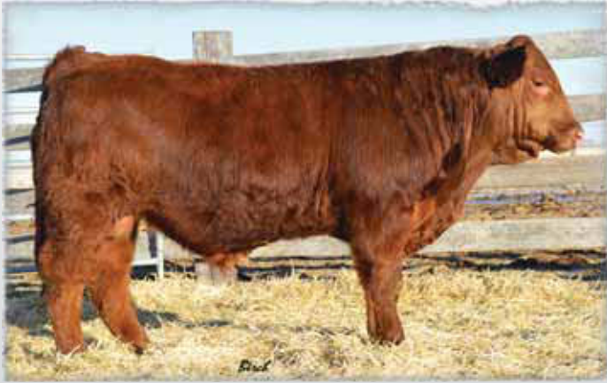
Lot 19 - AWB Birch's Jet Pack 163A