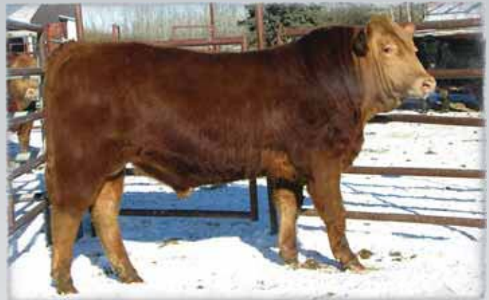
Lot 57 - KCC Keriness Superior 109A

KCC 109A is a clean fronted, stylish prospect who will make a great addition into any herd. He has an excellent disposition and he will leave a consistent stamp on his calf crop.