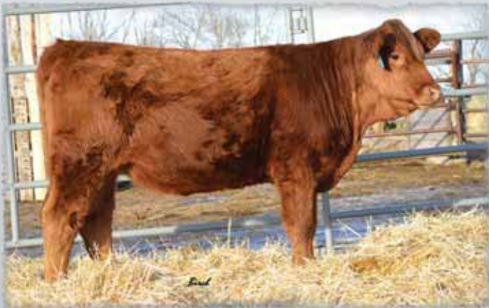
Lot 33 - SA Birch's Jan 186A