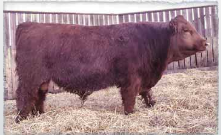
Lot 42 - CCC Gold Star Ace 90A

90A is a dark red, very attractive calving ease bull that combines a low birth weight with curve bending performance. The dam, Gold Star 125U, is one of the best cows in our herd complete with both Gold Star 5D and SLC Freedom in her pedigree. Ace will make a great addition to any cow herd. 50% Leptin positive.