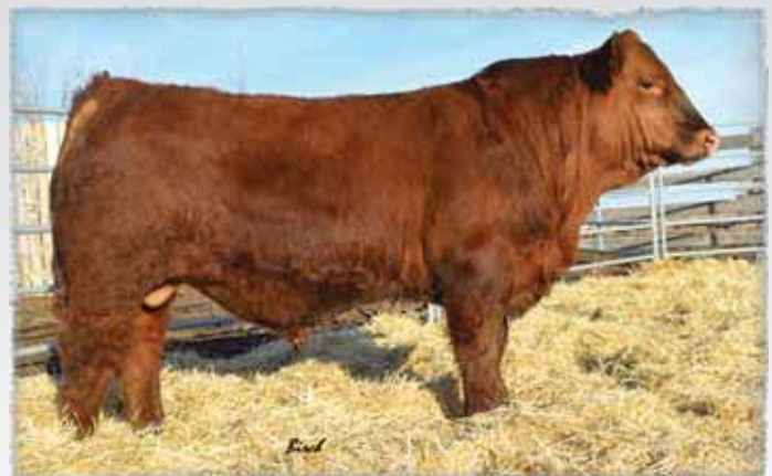
Lot 5 - SA Birch's Ranger 13A