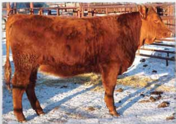
Lot 59 - KCC Keriness Erhart Lady 81A