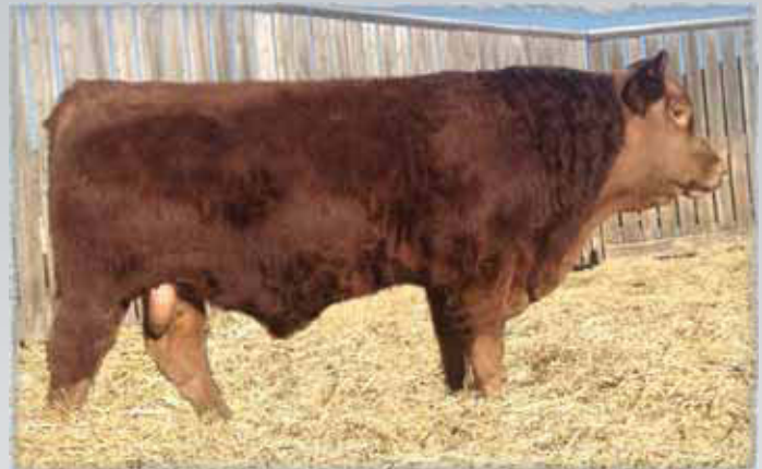
Lot 36 - CCC Gold Star Atlas 29A

Atlas 29A is a big, long, powerful bull that always catches my eye in the bull pen. Big performance on both grass and feed, with a WW of 946 lbs and an ADG of over 3.86 lbs/day on test. 29A is one of the thickest bulls in the pen, combine that with his length of body and strong top and you have the makings of a unique herd sire prospect. 100% Leptin positive.