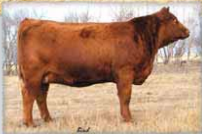
VV Wruffle Me 18W Dam of Lot 13

Wrangler is a definite sale feature. He has that perfect balance of phenotype, genotype and pedigree that we expect when we match up the top individuals in our program. His dam was our pick of the V&V Farms 2009 heifer calves and she has met and exceeded our expectations. Through embryo transplant and natural means she has already produced an impressive set of progeny. A son, AWB Birch's Blk Powder 37Z ET, was retained last year for our own use, a daughter was the high selling red heifer calf at the 2013 Wish List Sale and three more daughters have been retained in our program. One of these is the dam of the 13A bull in this sale. Even with being flushed Wruffle has already reached Dam of Merit status. If it were not for his brother already working in our program this bull may not be for sale. Homozygous Polled. 100% Leptin positive. Retaining 1/3 semen interest.