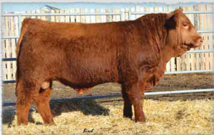
Lot 8 - SA Birch's Home Opener 47A