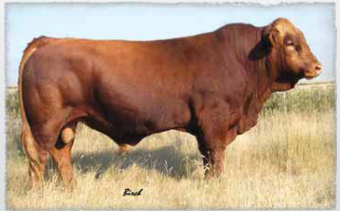
AWB Birch's Captain 10X ET