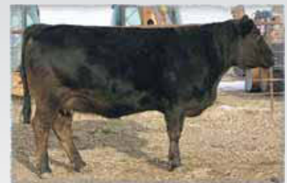
DF 20R - Dam of Lot 14