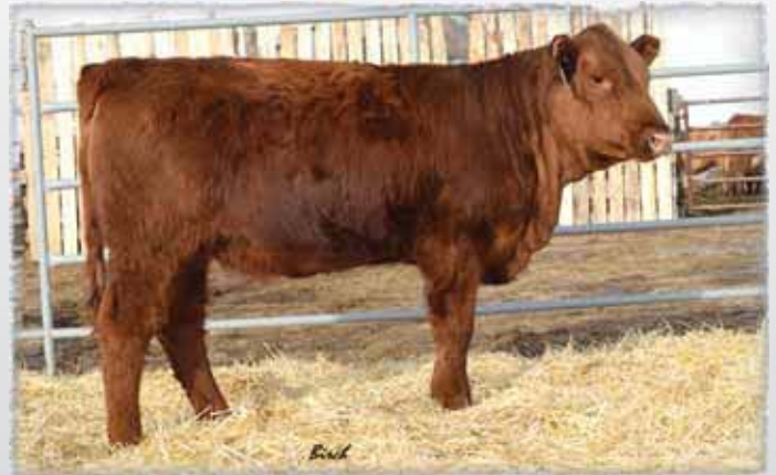
Lot 28 - AWB Birch's Macey 82A