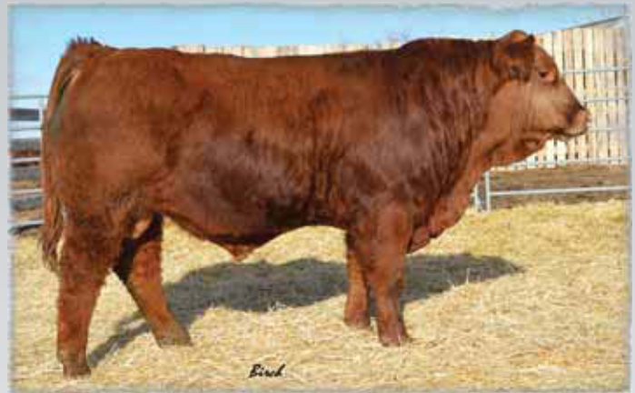
Lot 4 - SA Birch's Baxter 9A