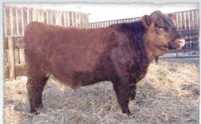
Lot 37 - CCC Gold Star Ambush 35A

This is a well rounded easy fleshing dark red bull out of a 12 year old dam with a great udder that goes back to Davidson Harmony 446J and Gold Star 49C. Another athletic herd bull with added length and an excellent WW of 775 lbs. 100% Leptin positive.