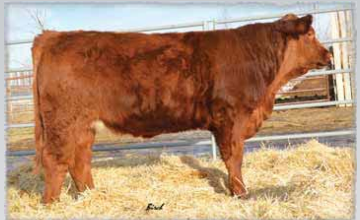
Lot 30 - SA Birch's Beryl 36A

Beryl 36A is a thick powerful female that is cherry red and has tons of hair. She is right out of the top of our replacement pen. This is the type of female we expect to produce bull calves that are in high demand. She is from a cow family that is starting to really stand out. You can see this by the bulls from this family in the sale. Her Grand dam is a Dam of Merit.