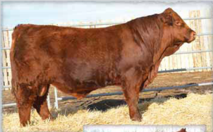
Lot 13 - SA Birch's Wrangler 58A