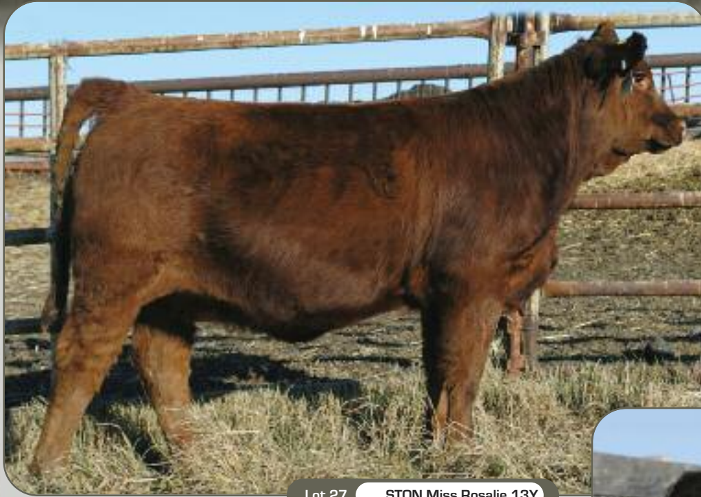
Lot 27 STON Miss Rosalie 13Y

27 STON Miss Rosalie 13Y Red • Double Polled • BW: 76 • WW: 659