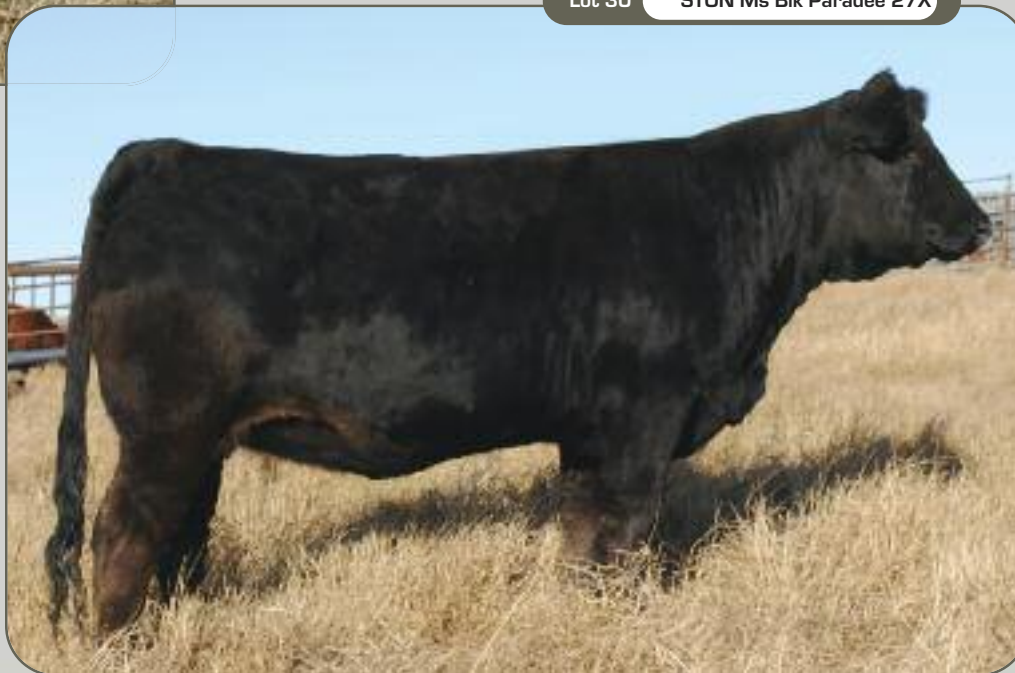
Lot 30 STON Ms Blk Paradee 27X

The older, darker sister to STON 25Y. This female is due mid-February to our new herd sire. The mother to these two females is the typical Paradee structure; moderate, feminine, an udder you can't fault, and fertility to rival the best of them! This is a sound investment!. Observed bred May 7th