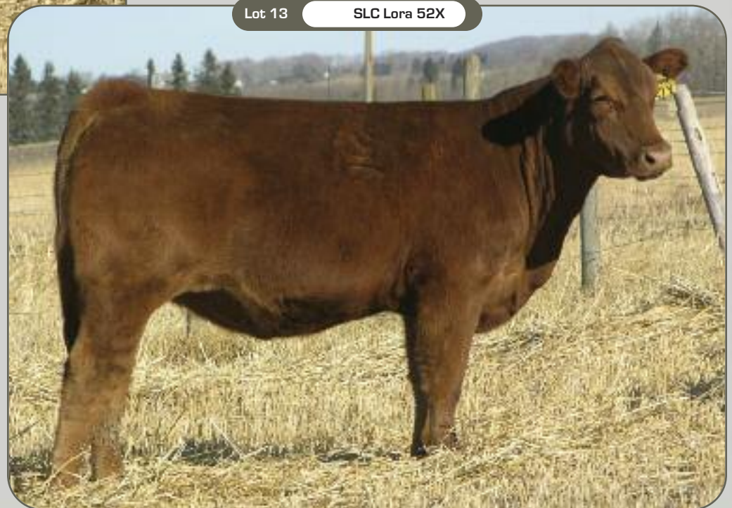
Lot 13 SLC Lora 52X

P/E July 14 to October 1, 2011 to SLC Touchdown 166W PD 13605