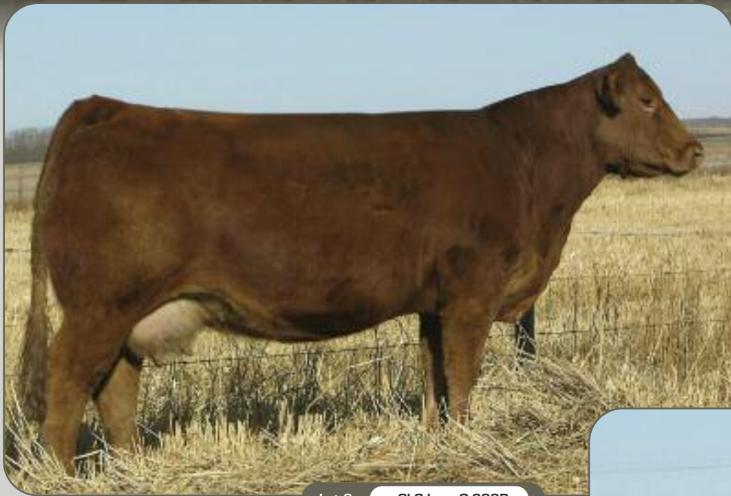
Lot 2 SLC Lora C 299P