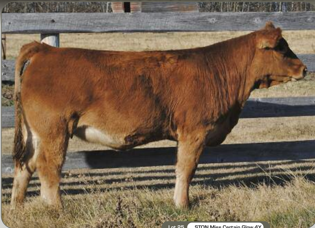
Lot 25 STON Miss Certain Glow 4Y