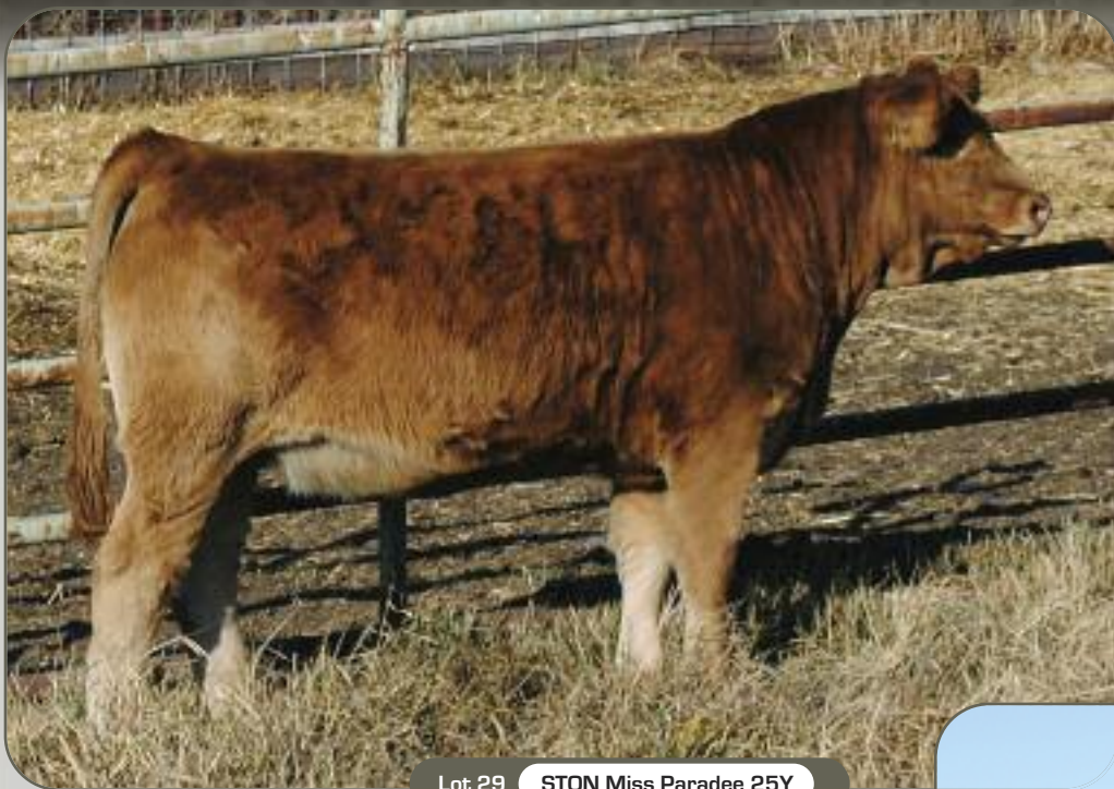
Lot 29 STON Miss Paradee 25Y