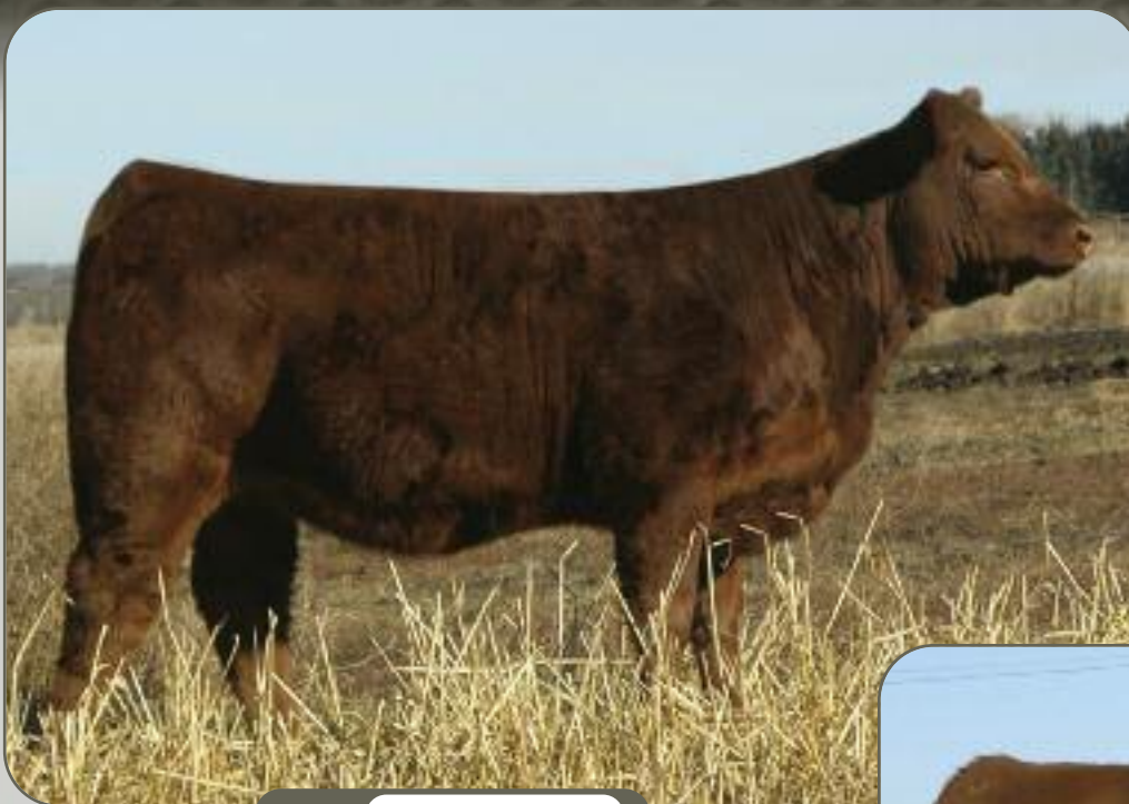
Lot 9 SLC Pam 112Y