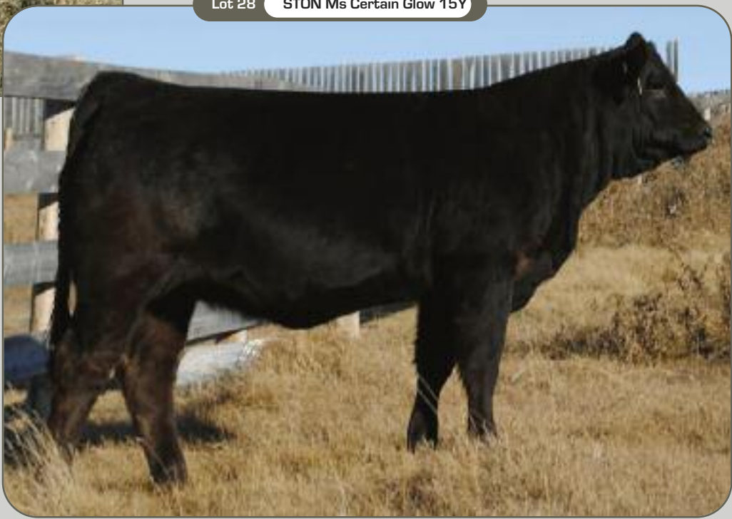
Lot 28 STON Ms Certain Glow 15Y

The other debutante of our Certain Glow females, except in a black wrapper. You will notice the similarity in these girls; pretty, well balanced, feminine, performance orientated cattle built for longevity. There is no gamble here.