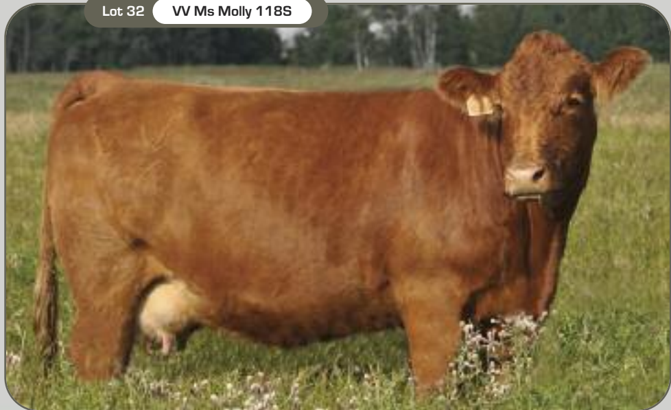
Lot 32 VV Ms Molly 118S

We first saw Molly at Lloydminster Stockade Roundup, and when she came into the barn she turned the heads of all cattlemen, no matter what their breed. We felt very fortunate to have purchased her after show won the Sweatheart Championship at Agribition in 2007. Since then, she has been National Reserve Senior Female, raised a Legends of the Fall Champion, herd sires, and replacement females anyone would be proud to own. Look at her, she is a tank with a presence. Perfect udder, massive square hip, the cleanest front end you will ever paint on a Gelbvieh, and delivers a dark red package every Spring. This is a cow family you will certainly hear more about in the future. Molly will calve late February and will be available to flush as soon as possible after. Again we will guarantee 6 embryos, and we are very happy to assist if needed with your sire choice selection. Molly is a Dam of Merit.