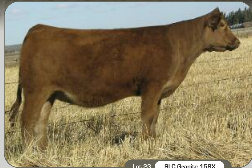
Lot 23 SLC Granite 158X

P/E July14 to October 1, 2011 to SLC Touchdown 166W PD 136058