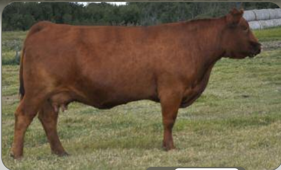
Lot 31 VV Rosalie 98R