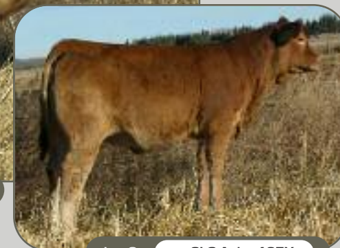
Lot 8 SLC Anita 137Y