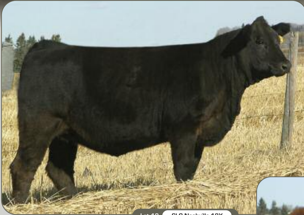
Lot 12 SLC Nashville 12X