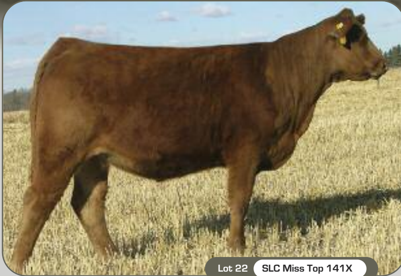
Lot 22 SLC Miss Top 141X

22 SLC Miss Top 141X Red • Double Polled • BW: 86