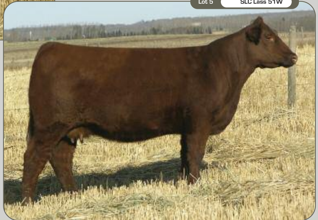
Lot 5 SLC Lass 51W

P/E July 14 to September 20, 2011 to SLC Roy Bean 141U PD 12836