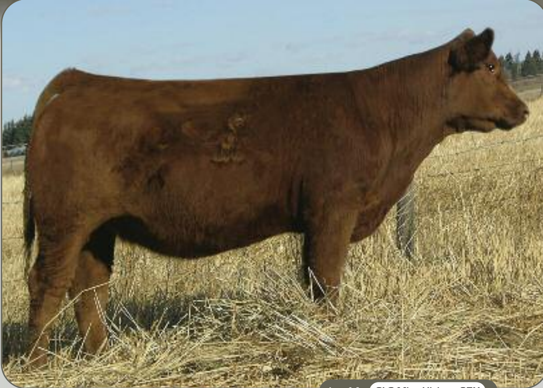
Lot 14 SLC Miss Hickory 67X