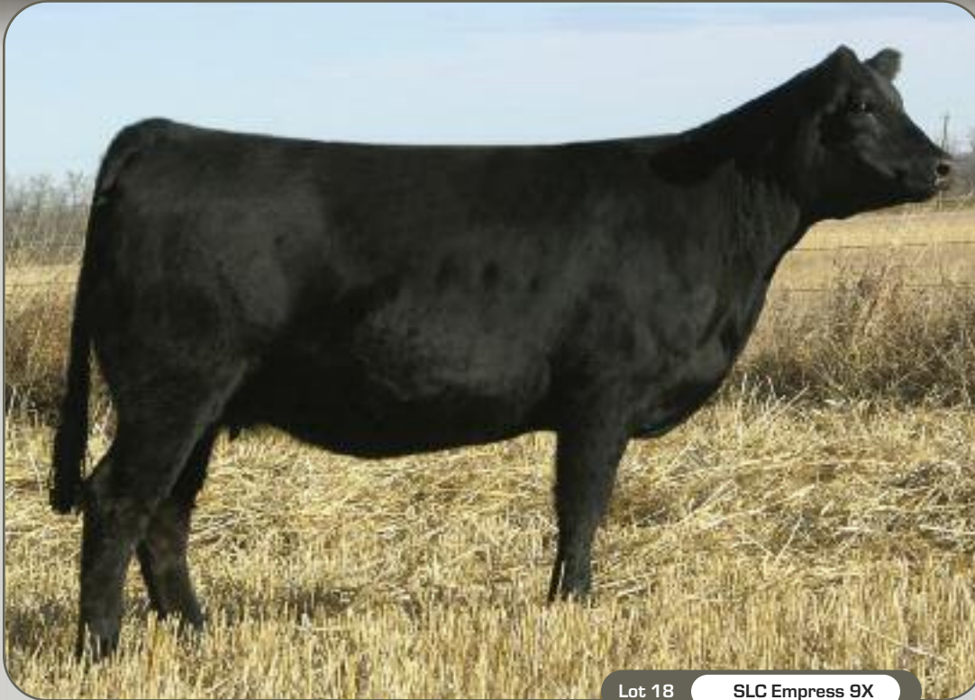
Lot 18 SLC Empress 9X