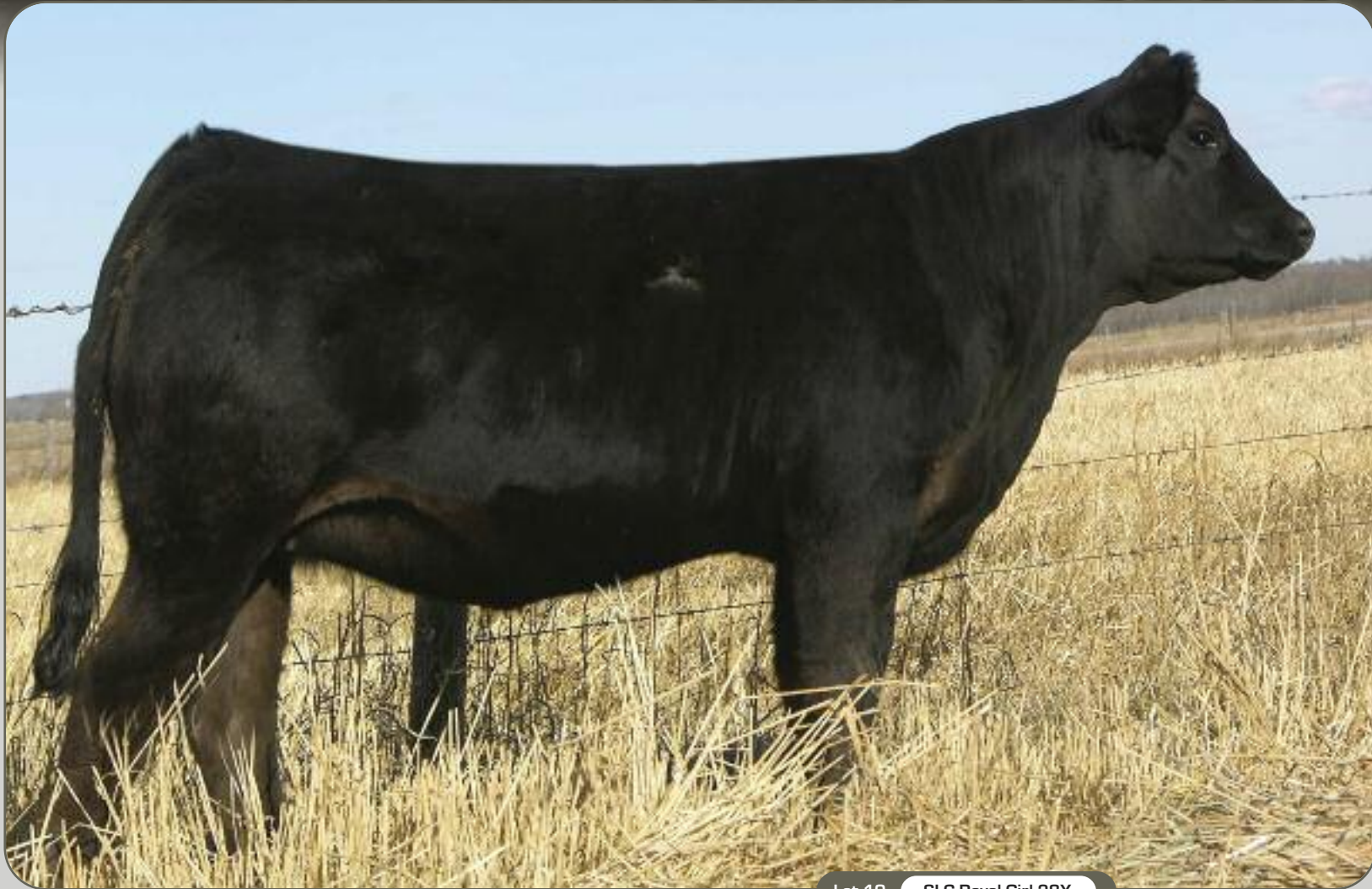
Lot 10 SLC Royal Girl 28X