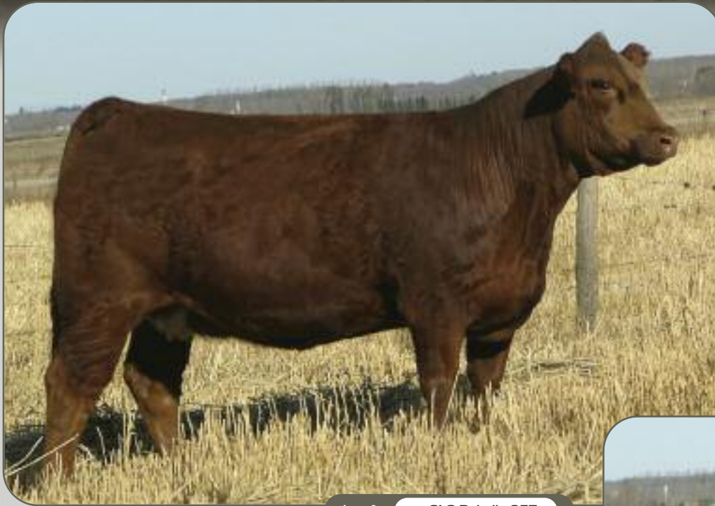
Lot 4 SLC Rebello 95T