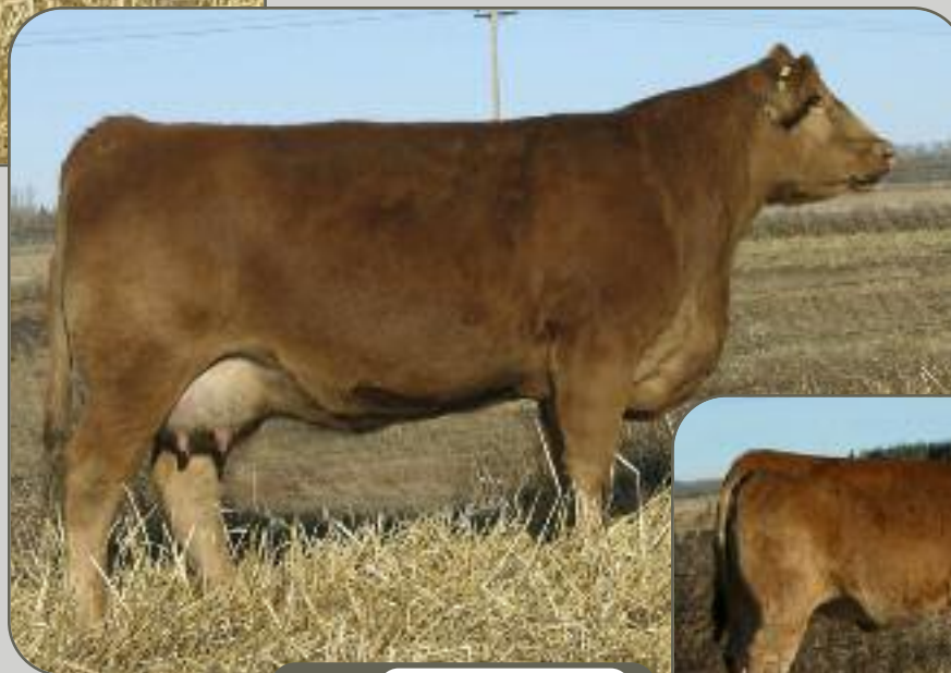
Ref SLC Anita 149U

SLC Anita 137Y's dam was Reserve Junior Champion Female at the 2009 National Show and her dam is a daughter to the feature cow 122R. She will show along side her mother at the National Show in Edmonton.