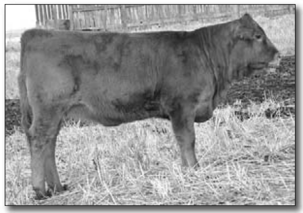
Lot 4 - SLC Lonnie 68X