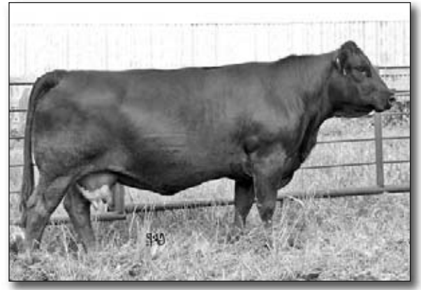
Lot 32 - AR African Queen 6N