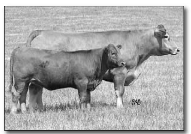
Lot 34 - TG Polled Kendra 31R & Lot 59 - PV Red Star 8X