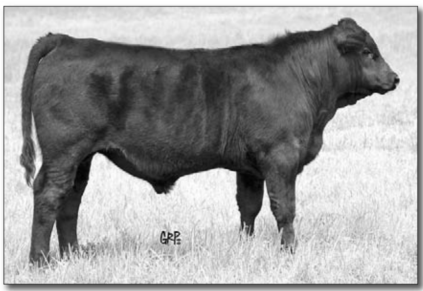
Lot 58 - PV Darth Vader 52X