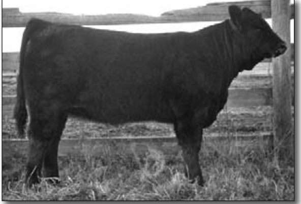
Lot 5 - SLC Ace of Spades 150X