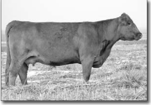
Lot 18 - SLC Miss Hickory 10R