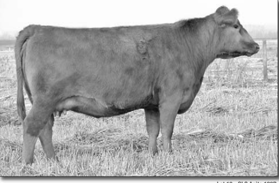
Lot 19 - SLC Anita 122R