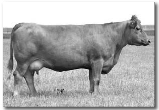
Lot 37 - DTJ Sweet Julie S50