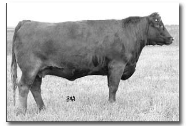
Lot 36 - DTJ N4 Miss Lisa S21

A I April 1, 2010 to RID R Collateral 2R P/E April 16 to May 9, 2010 to Red Brylor Smoker CVF 79S was purchased at the 2007 Gelbvieh Showcase Sale and has produced very well for Pura Vida.