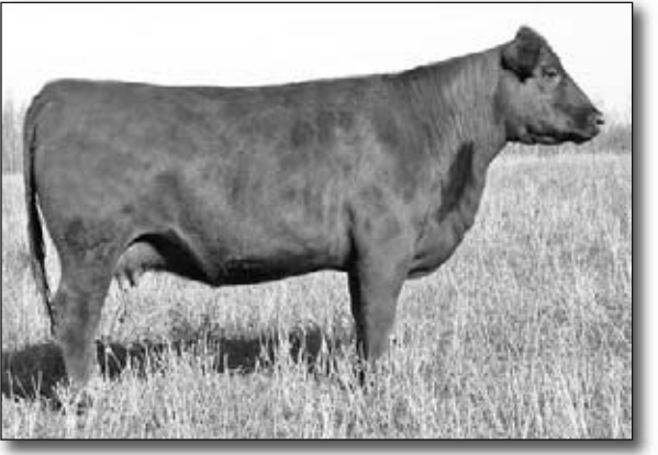
Lot 27 - SLC Jasmine 181T