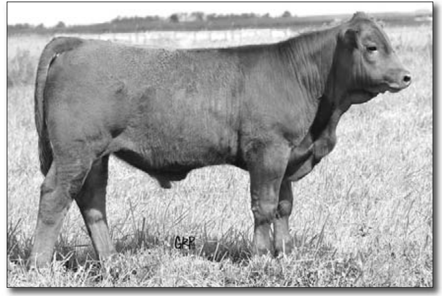
Lot 56 - PV Don Juan 34X

A I March 29, 2010 to JDPD Astro 407S P/E April 16 to May 9, 2010 to Red Brylor Smoker PV 64W will be a great calving ease heifer bred to the excellent A I sire JDPD Astro.