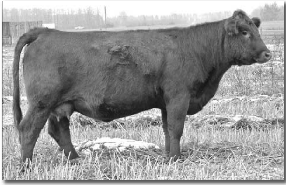
Lot 29 - SLC Lass 201U