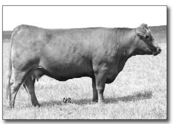
Lot 35 - DTJ Sister Effie S4