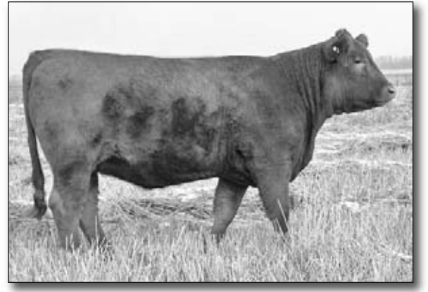
Lot 17 - ULL Red Felice 8W