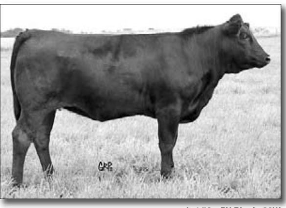
Lot 50 - PV Rhoda 20W

Pura Vida Farms added 35W this past spring into their herd from V & V Farms.