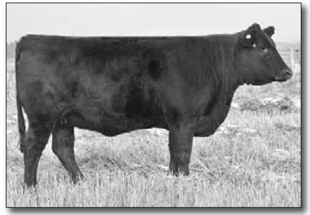
Lot 15 - SLC Queen Mother 214W