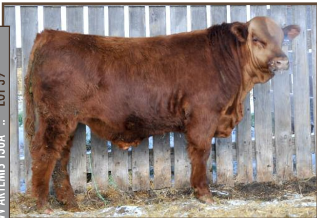
WV ARTEMIS 136A :: LOT 39