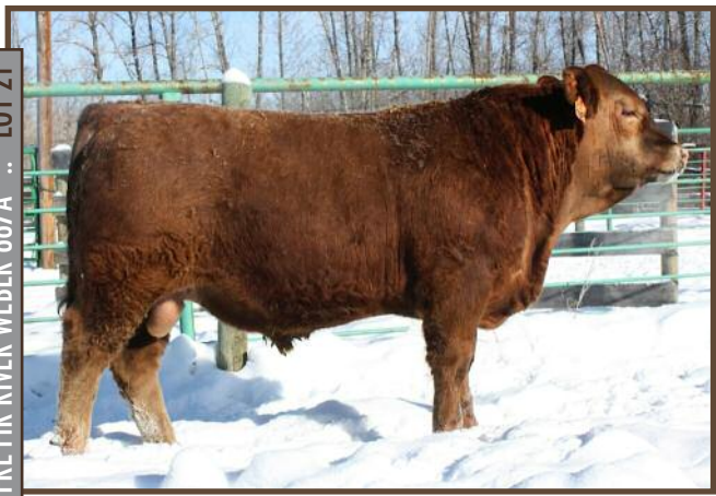
FRL FIR RIVER WEBER 887A :: LOT 21

Beef, butt, and guts. This guy has it all. Thick made and sound. Dam is an excellent ut-tered brood cow.