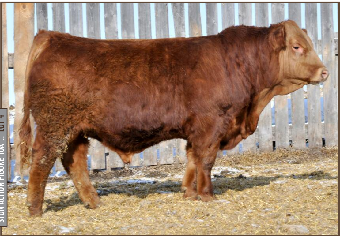
STON ACTION FIGURE 10A :: LOT 4