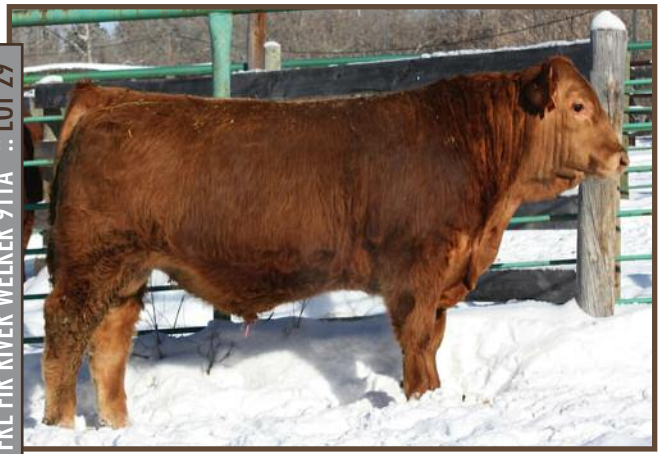
FRL FIR RIVER WELKER 911A :: LOT 29

Lots of stretch, middle, hip and hair. Really like the way this bull has developed. Great phenotype, he'll be easy to find sale day.