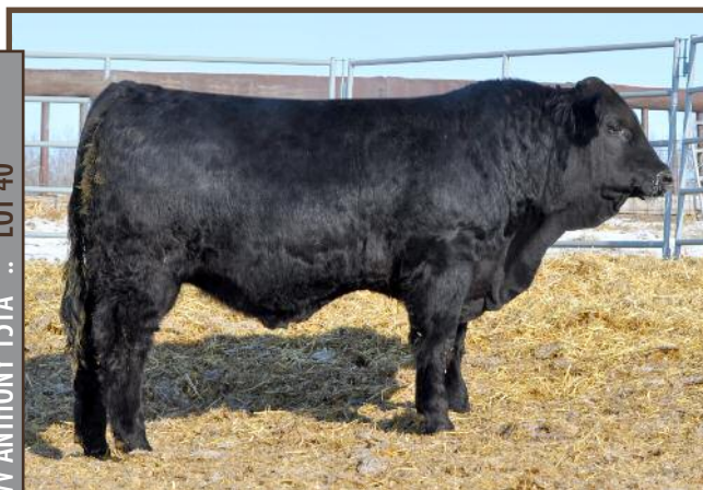
WV ANTHONY 151A :: LOT 40

Style, presence, and power describe WV 136A. Performance and carcass plus genetics are in high demand and gaining ground as the industry evolves, have a look at WV136A and you will easily see quality of this caliber is not easy to find. He will sire scale busting calves, but also has a powerful cow family behind him to ensure the females will be the highest quality replacements.