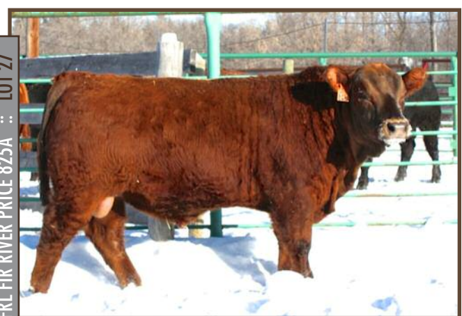
FRL FIR RIVER PRICE 825A :: LOT 27