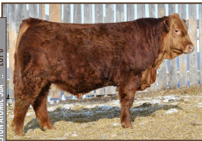
STON ATOMIC 36A :: LOT 8