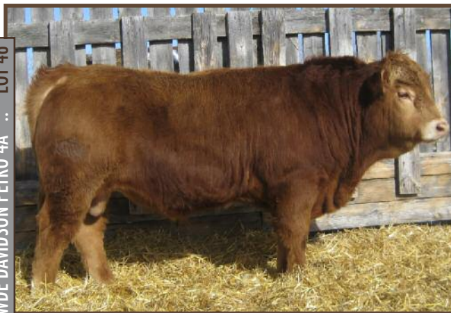
WDE DAVIDSON PETRO 4A :: LOT 46