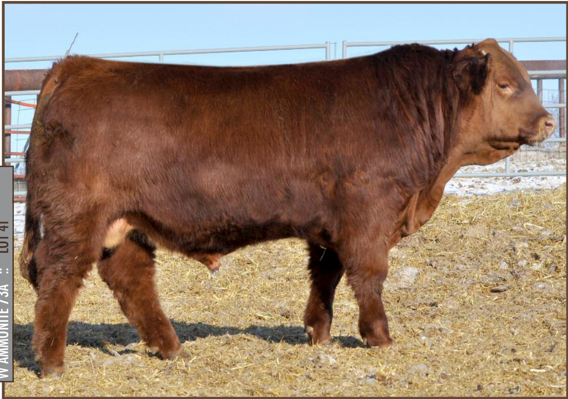
WV AMMONITE 73A :: LOT 41