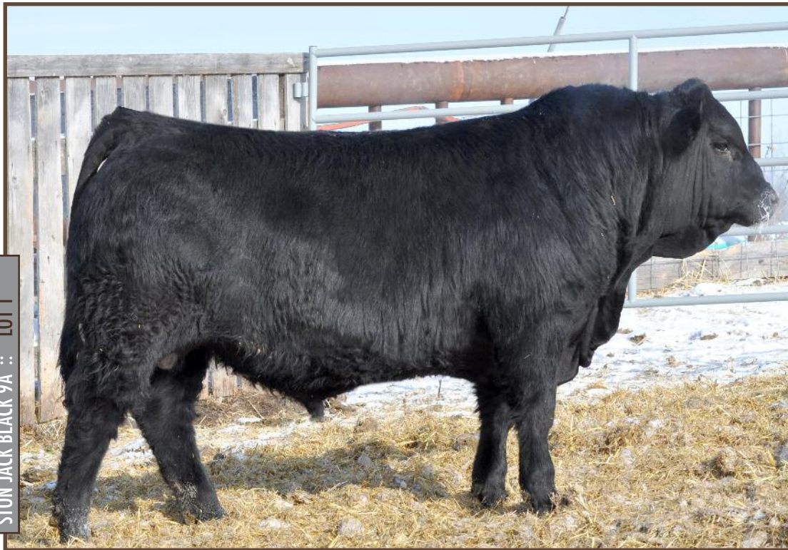
STON JACK BLACK 9A :: LOT 1