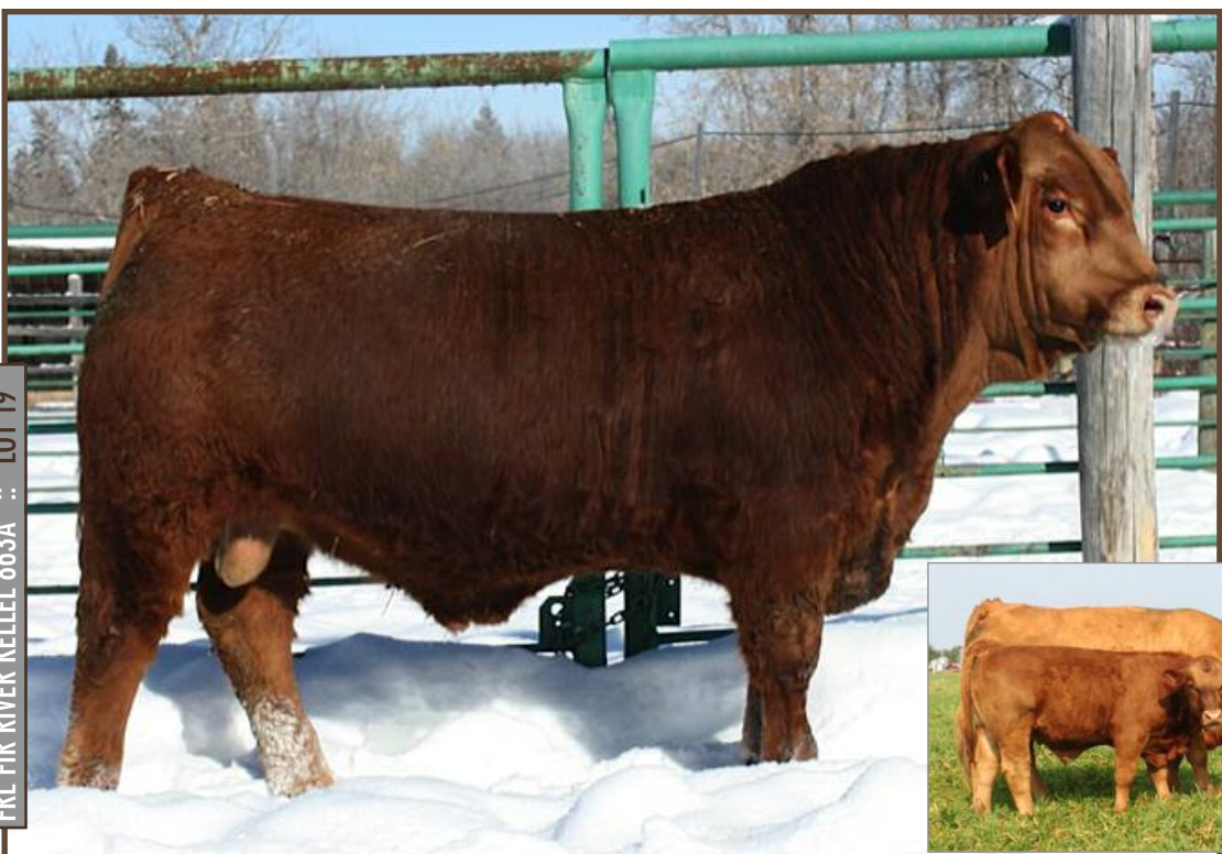
FRL FIR RIVER KELLEL 863A :: LOT 19