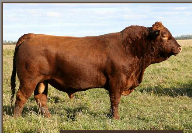
SLC MASTERPLAN 512T :: REFERENCE SIRE