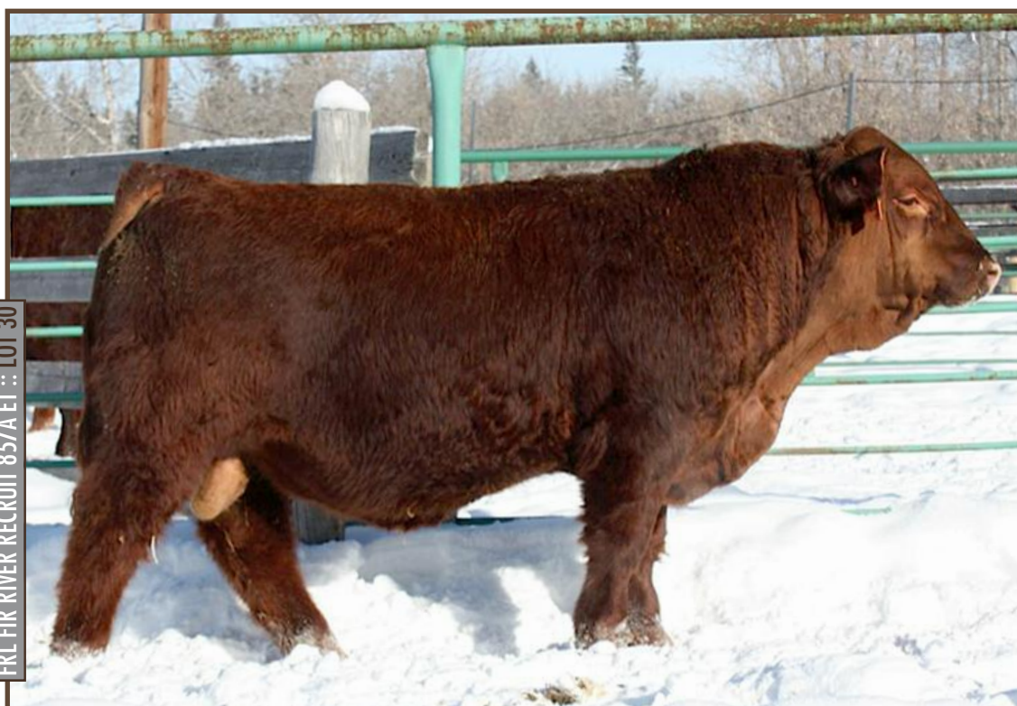
FRL FIR RIVER RECRUIT 857A ET :: LOT 30