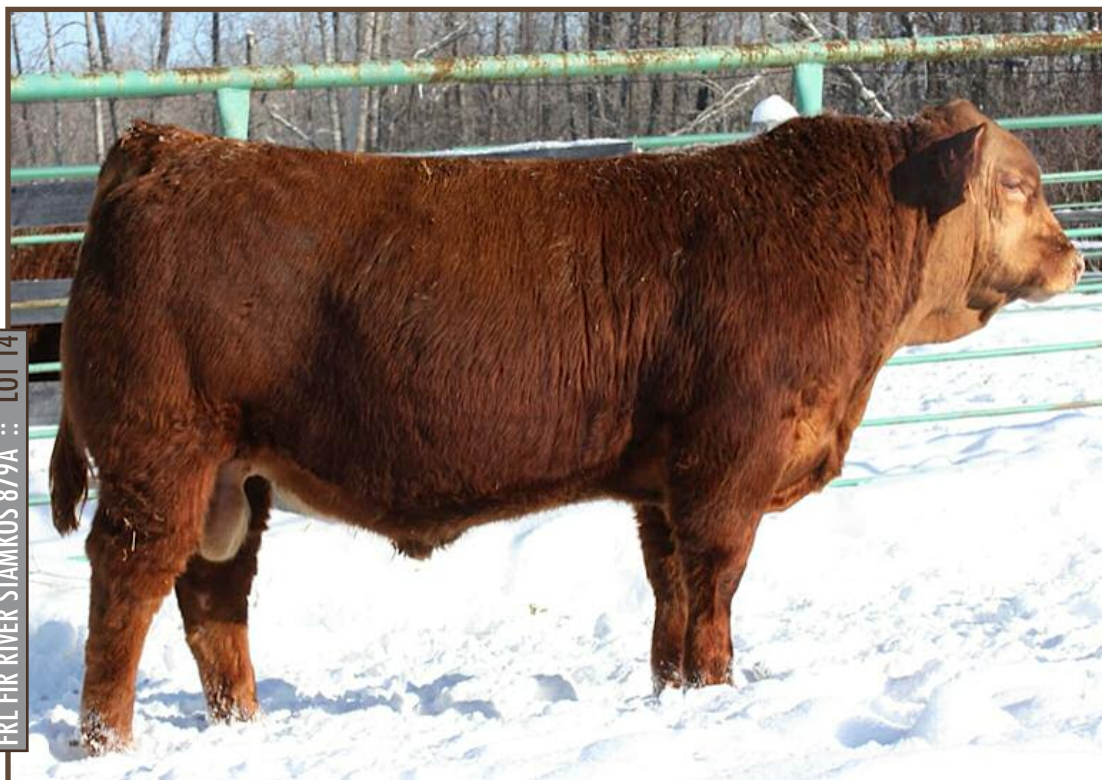
FRL FIR RIVER STAMKOS 879A :: LOT 14