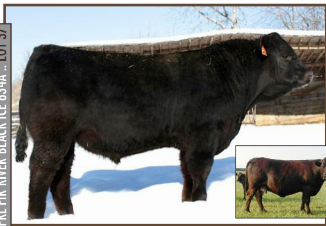
FRL FIR RIVER BLACK ICE 834A :: LOT 37