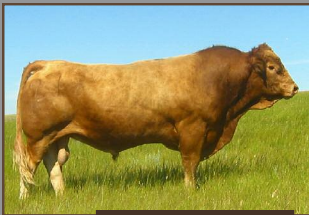
DAVIDSON SHOWTIME 10U :: REFERENCE SIRE