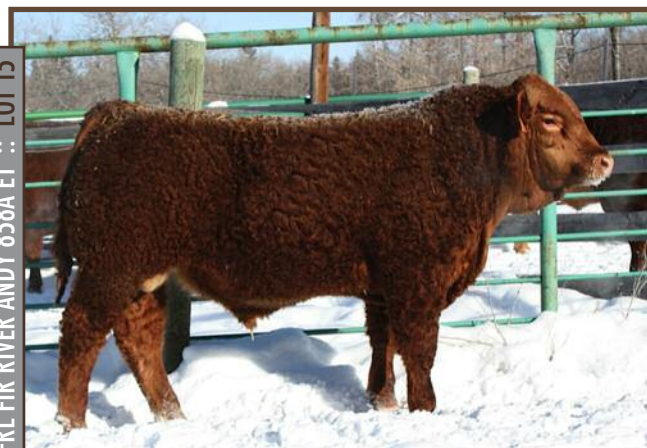
FRL FIR RIVER ANDY 858A ET :: LOT 15

SLC LATIGO 118L BTI MS CHARLA 2191F XZR C342 (STUBBY) SLC BLACK LASS 98D