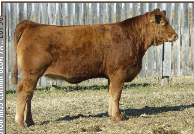
STON MISS CERTAIN GLOW 7A :: LOT 50