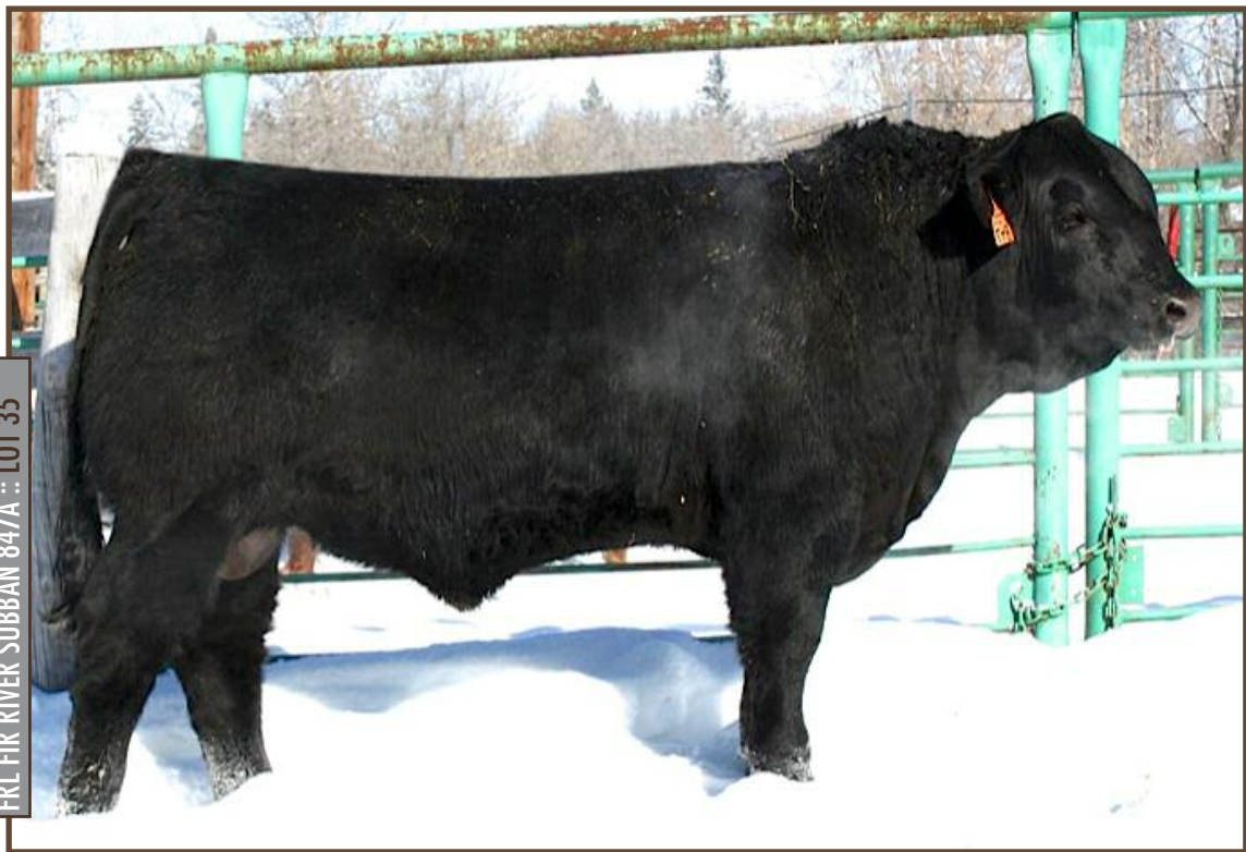
FRL FIR RIVER SUBBAN 847A :: LOT 35