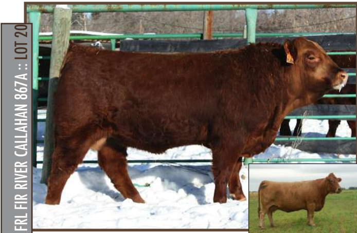
FRL FIR RIVER CALLAHAN 867A :: LOT 20