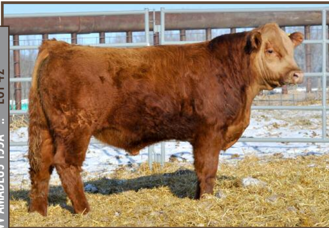
WV AMADEUS 155A :: LOT 42