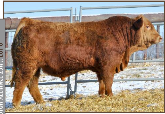
STON ALLIANCE 25A :: LOT 6

Ambush 17A was mothered by a member of our Certain Glow cow family, and has generations of dominant females behind him. He will provide more than adequate growth and pounds to weaning, and then moderate the yearling weights to an acceptable level for additions to the cow herd.