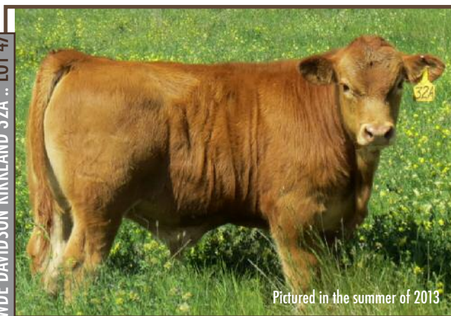
Pictured in the summer of 2013