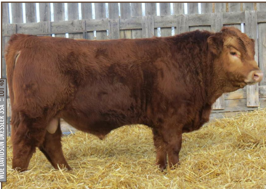
WDE DAVIDSON DRESSLER 35A :: LOT 48