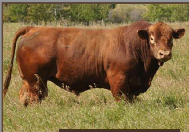
CES DECKA OUTBACK 75S :: REFERENCE SIRE