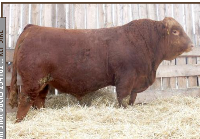
JRI STAR BUCKS 254Y82 :: REF SIRE