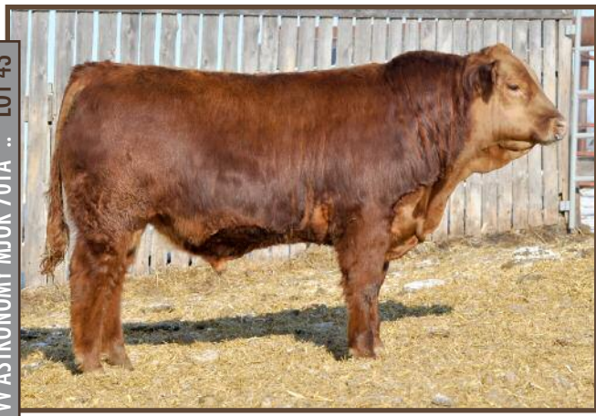
WV ASTRONOMY MJOR 701A :: LOT 43