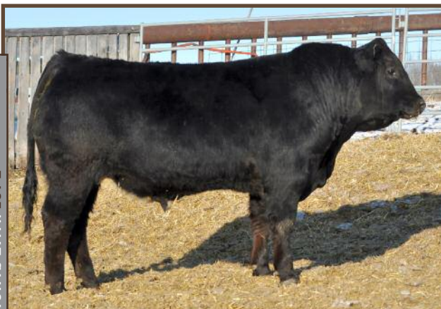
STON AJ 29A :: LOT 2