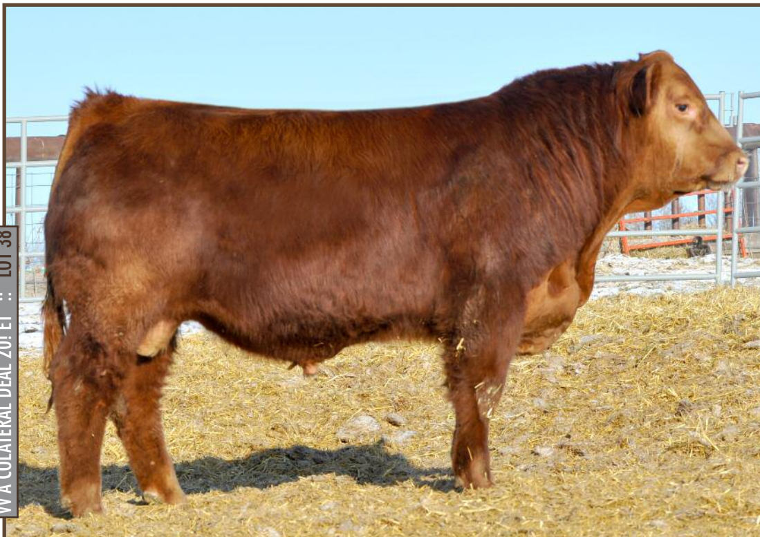
WV A COLATERAL DEAL 20A ET :: LOT 38