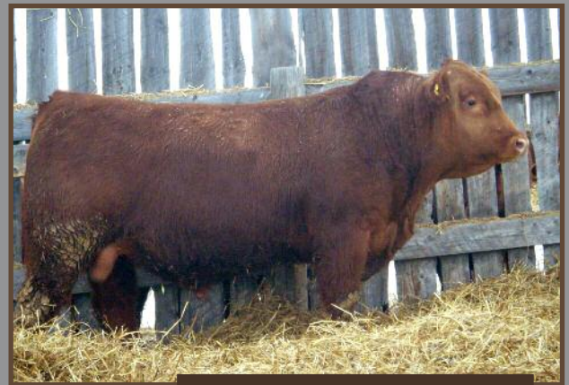
SLC TOUCHDOWN 66W :: REFERENCE SIRE