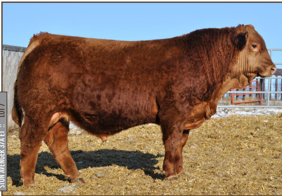
STON AVENGER 37A ET :: LOT 7