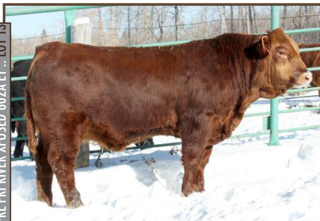
FRL FIR RIVER XPOSED 802A ET :: LOT 13