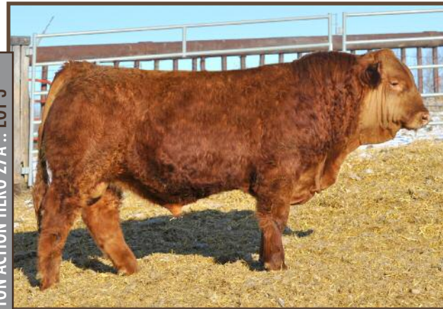
STON ACTION HERO 27A :: LOT 3

Our first Balancer lot, and one we think you will easily find. He is a black 3/4 bull who will calve like a dream, and add a touch of Angus influence to smoothen things down a notch. He was mothered by one of our best, the original Paradee cow we acquired from my father in law. She has made a tremendous impact on our program, as well as several other purebred herds across Canada. If you would like to try something a little different, take the step and I promise you will not be disappointed!