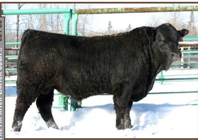
FRL FIR RIVER CARTER 833A :: LOT 36