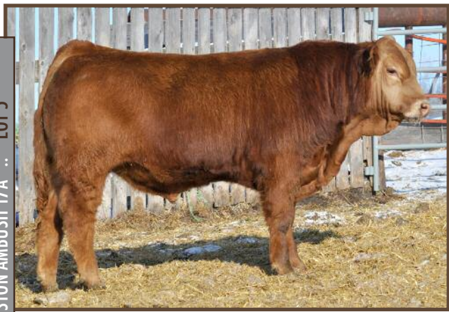
STON AMBUSH 17A :: LOT 5