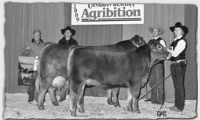
DVE Davidson Peterbilt 7N at Agribition 2009