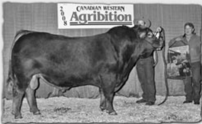
FRL Fir River Santana 62S

FRL 109W is another excellent brood cow prospect. 109W will be an easy keeping, hard working cow.