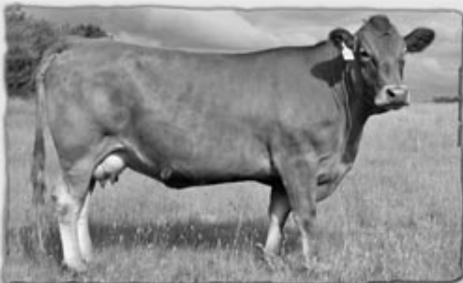
Dam of Lot 9

Mayweather is a Stockman son that is doing wonders for his age. He is a good looking, deep bodied bull out of a terrific dam; a picture perfect female. Mayweather would be an awesome bull to raise replacement heifers with outstanding cow families on both sides of his pedigree. He should enhance your herd.