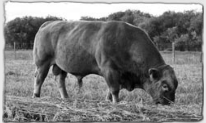
DVE Davidson Pld Lucky 295P

FRL 2W is an excellent calving ease son of the great sire at Judd Ranch, Free Agent. Lots of hair and eye appeal.