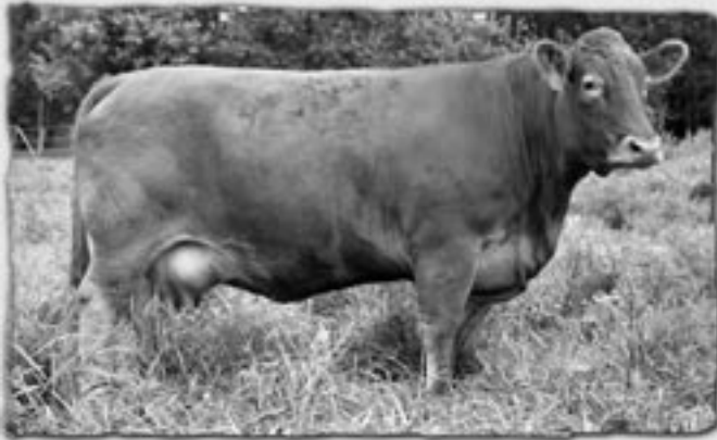
Dam of Lot 28