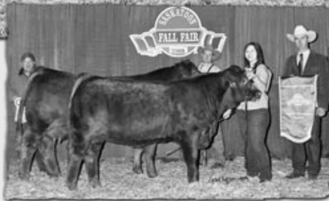
Grand Champion Pair at Saskatoon Fall Fair FRL Fir River Zahara 5U A Fully Exposed daughter sold at the 2008 Canadian National Sale for $30,000