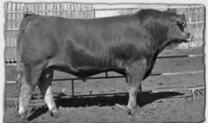
DVE Davidson Pld Romeo 73T