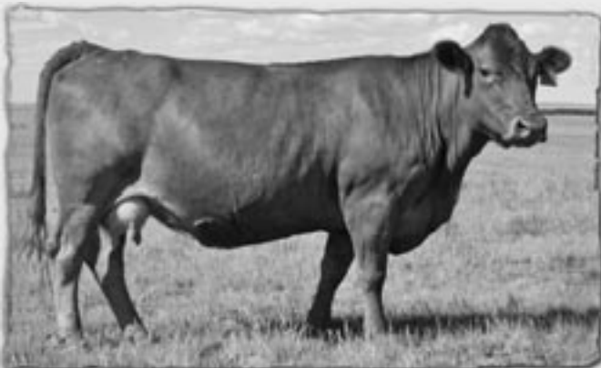
Dam of Lot 2