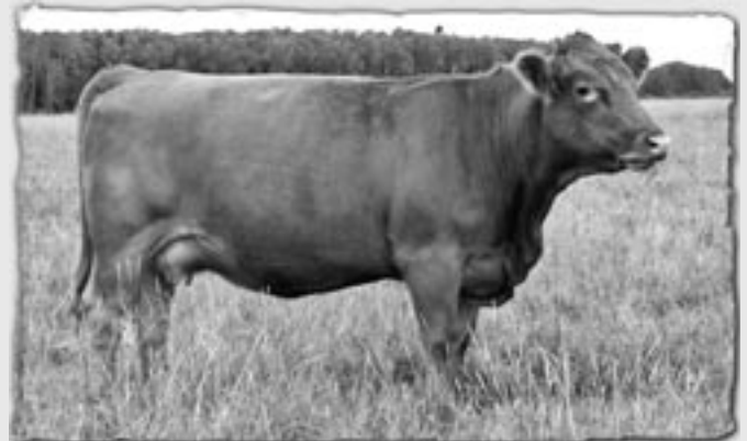
Dam of Lots 32 & 33

Arrive early, inspect the cattle & be our guests for lunch prior to the sale