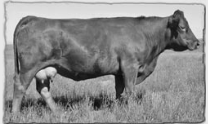
Dam of Lot 3

Hopkins likes to stand up, demanding your attention. He is very structurally correct. He has that mix of eye appeal and beef with a square hip and a pattern that will make a tremendous mold to create every bull in the pen.