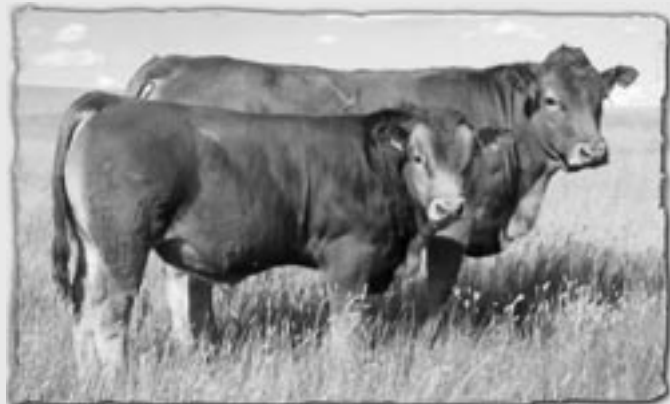
Dam of Lot 10 pictured with a maternal brother

This pretty young gal is a daughter of Davidson Romeo, a sire who puts lots of style into his heifers. His daughters would make a great start for a new breeder or a super addition to an established herd. Everyone would like to own their dream girl.