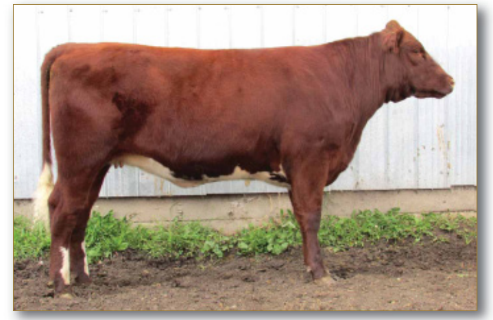
Lot 19 - Prospect Hill Amay-Lou 11A