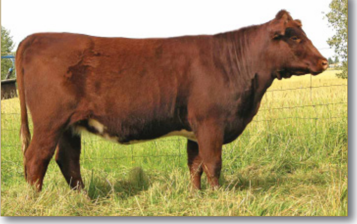
Lot II - Crooked Post Rosette 50A