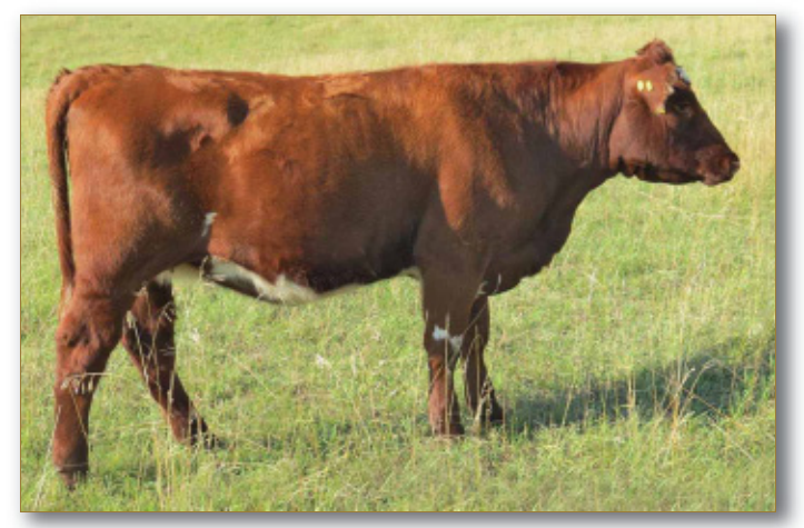
Lot 16 - Silverwillow Serg Sparrow 7A

Silverwillow Sparrow 7A is a moderate framed, feminine daughter of Sergeant York, our herd bull from Diamond Shorthorns. We are very happy with the way Sergeant has developed and feel his daughters will only get better with age. 7A is hard to part with. Muridale Sparrow 54J, her grandmother, was a real favourite of ours . Sells bred to Muridale Nickel.