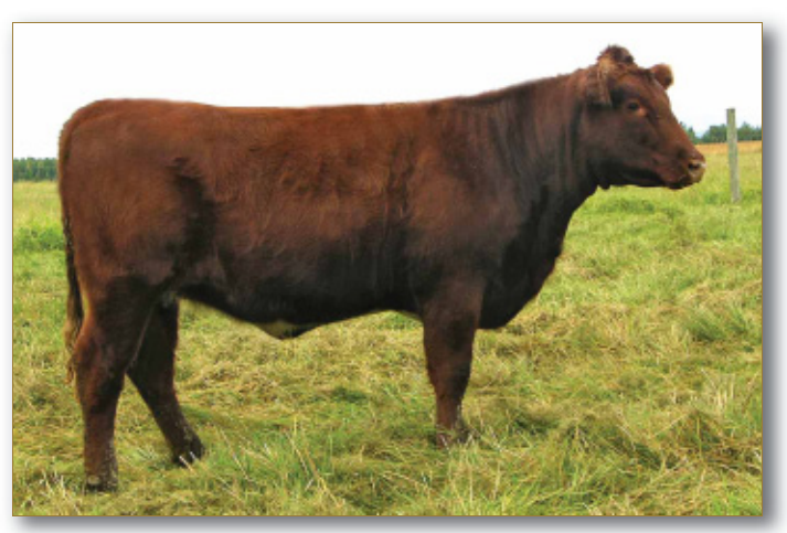
Lot 7 - Crooked Post Minnie 30A