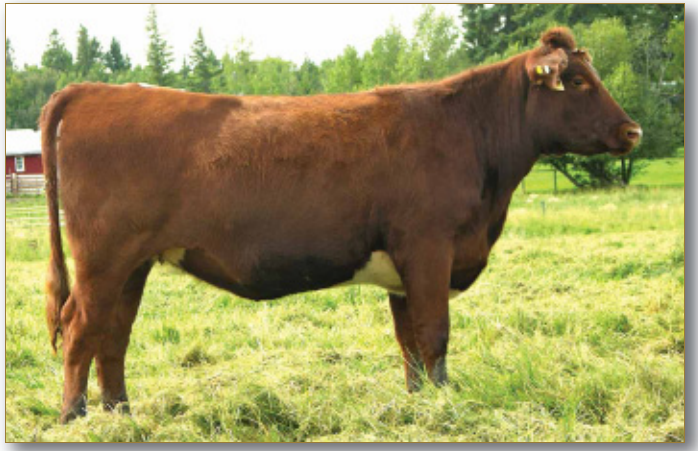
Lot 10 - Crooked Post Forester 48A

Minnie 45A really bends the rules of carcass trait antagonisms. Compared against her contemporaries, she indexes (105) back fat measure, (109) on marbling scan and a huge (136) for REA/cwt. We are very proud of our Belmore Jackaroo daughters, these figures help indicate why that is!