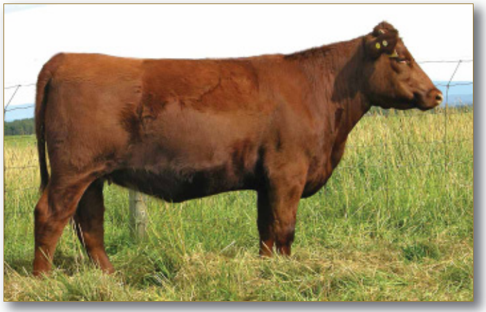
Lot 5 - Crooked Post Minnie 27A