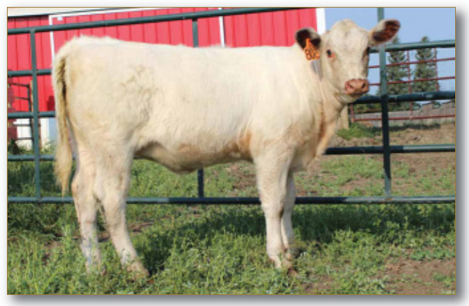
Lot 31 - Sharom Snowbelle 308B

The Sugar cow family is a quickly becoming a foundation in our herd. No matter what bull you breed to these cows, big and broody is what you get. Sugar Biscuit is no exception. She has the frame and depth to continue this tradition. We have retained females and herdsires from this line with great success. In the 2012 Hill Country Classic Sale, this heifer's half-sister sold to Matlock Farms.