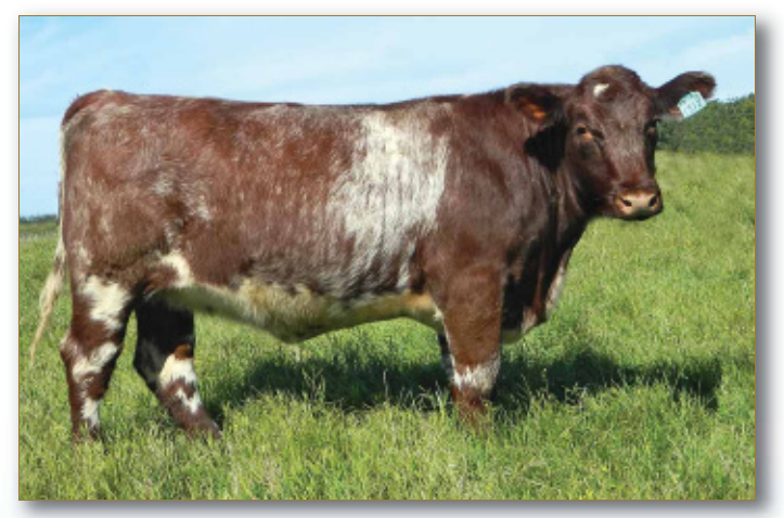
Lot 24 - Hargrave 1312 Samantha 17A

1312 is a granddaughter of the 2006 National Champion female, Crooked Post Sam 2P, her dam being the full flush sister to our Sam 13X bull. We really shouldn't let this heifer leave the herd, but her dam is still young and will be entering a flush program in the future. She is our most powerful bred heifer and that roan colour will please anyone. Bred to our calving ease bull, Muridale Rooster 57Z for an early March calf.