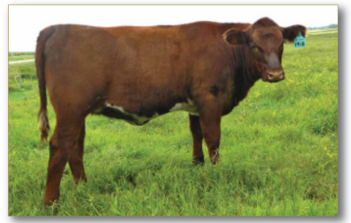
Lot 33 - Dollar Creek 1418 Maid 18B