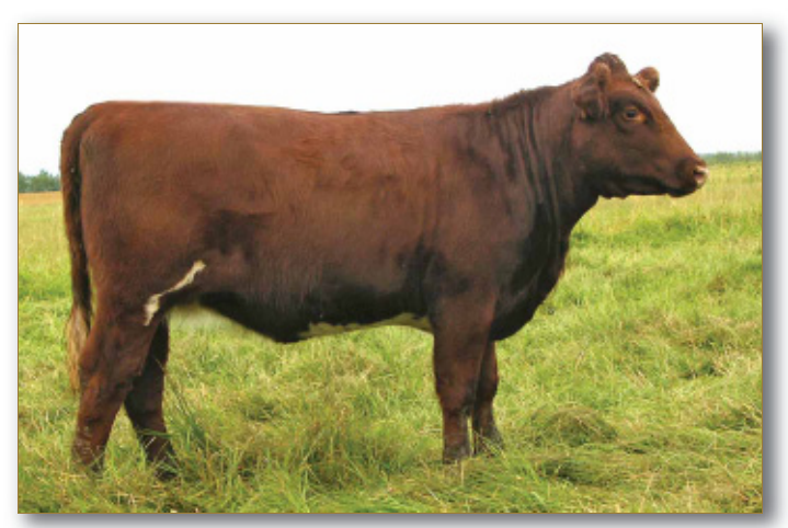
Lot 14 - Crooked Post Catalina 54A