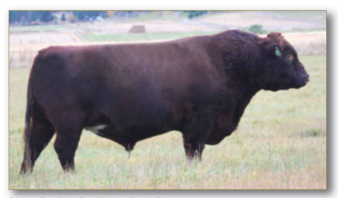
Sire - Coalpit Creek Leader 6th