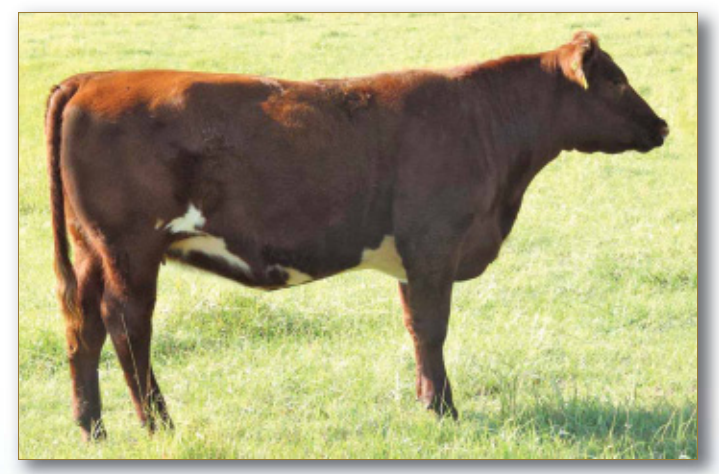
Lot 18 - Silverwillow Serg Helen 13A

Silverwillow Helen 13A is a neat and tidy, moderate framed daughter of Sergeant York. Her mother is an awesome little daughter of Paintearth Solution. Sells bred to Muridale Nickel.