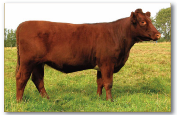
Lot 12 - Crooked Post Maria 51A