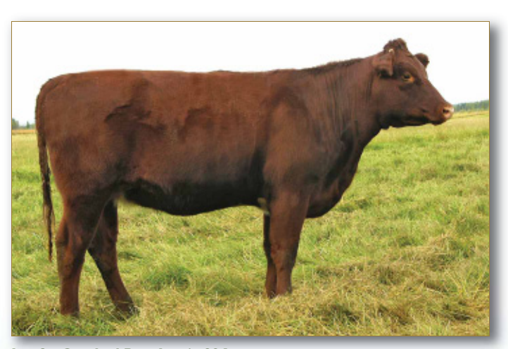
Lot 8 - Crooked Post Lassie 32A