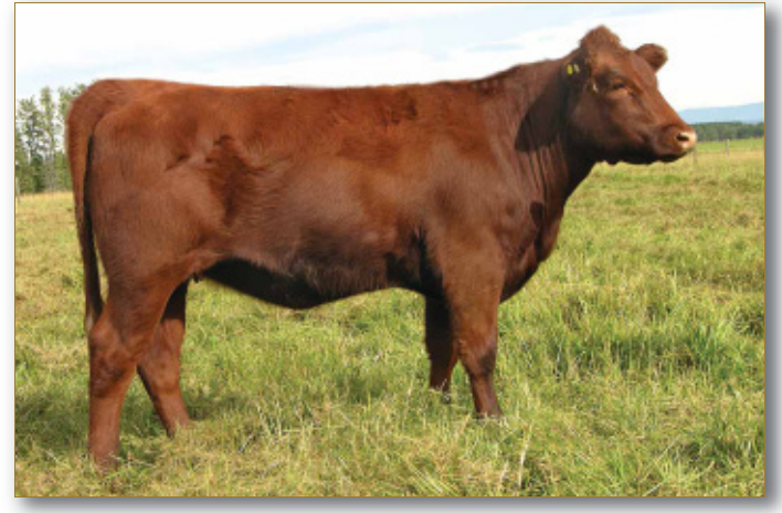
Lot 3 - Crooked Post Red Rose 7A