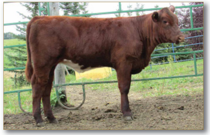
Lot 26 - Strilchuk Buttercup 12B

Prospect Hill Bliss Pearl 13B is a dandy roan heifer with Balmoral Oaks Eagle on the top side and a Paintearth Buckeye daughter on the bottom. It's a great combination. We feel she will make a great show prospect. Don't miss out!