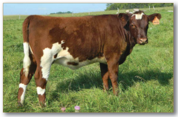
Lot 32 - Hargrave 1403 Melba Niam 3B

When selecting heifers for a sale such as this one, sacrifices must be made. We were reluctant to part with this heifer because she shows such potential but her mother is a young Paintearth cow with many years ahead of her and we retained Bee's half sister last year. Bee is a classy, feminine young lady that should mature into a productive brood cow like her mother.