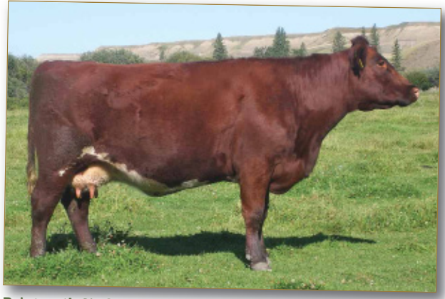
Paintearth Sindy 41R