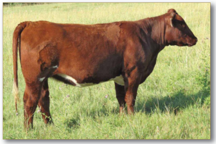
Lot 17 - Silverwillow Serg Jewel 11A

Silverwillow Jewel IIA is a powerful bred heifer out of the Sergeant York bull. Her mother is a massive cow with a super udder and IIA is definitely cut from the same mould as her mother. Sells bred to Muridale Nickel.