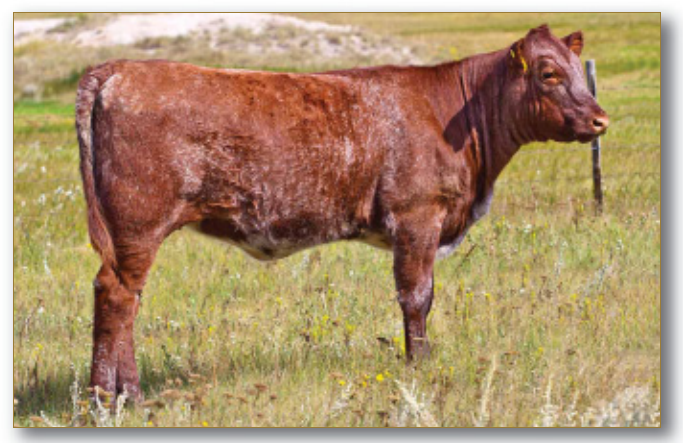
Lot 25 - Paintearth Jeanette 6B