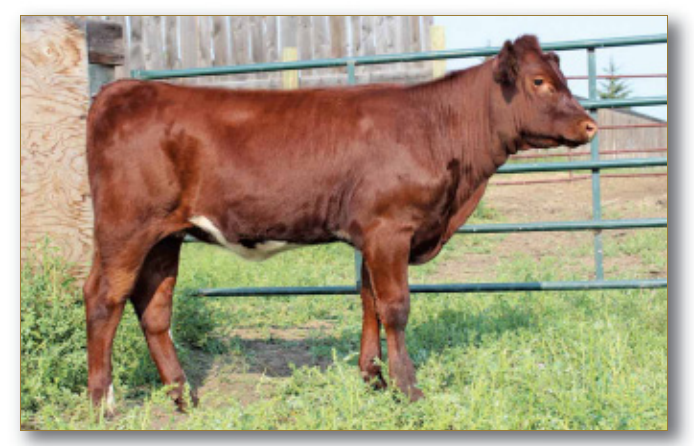
Lot 29 - Sharom Sugar Biscuit 293B