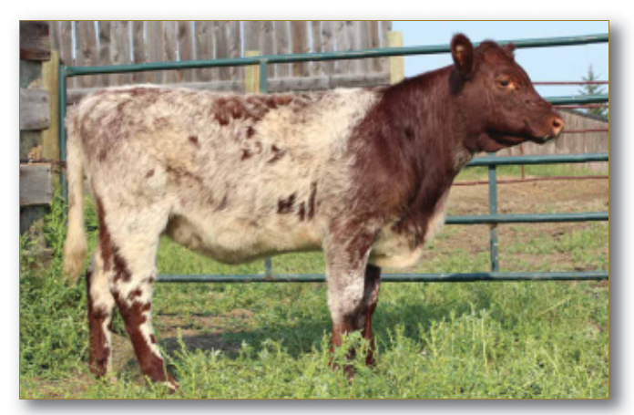
Lot 28 - Sharom Butterfly 276B

Strilchuk Buttercup 12B is a solid red heifer who has Prospect Hill blood on both the top and bottom of her pedigree. Her dam has been a solid producer and is the foundation of this small herd.