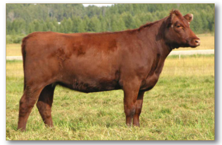
Lot 6 - Crooked Post Goldie 29A