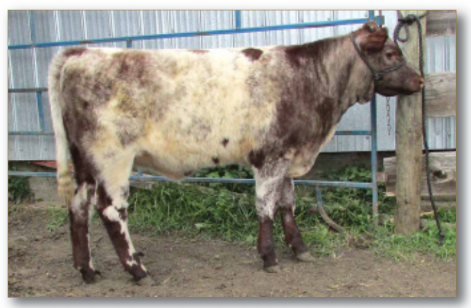
Lot 27 - Prospect Hill Bliss Pearl 13B

If you are looking for a heifer prospect, take a second look at this one. She has what it takes to go a long way in any Shorthorn program. She is a Boomer daughter out of a first calf heifer. We will not be selling many Boomer daughters, so this is a rare opportunity.