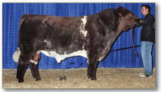
Sire - Paintearth Rama 53U