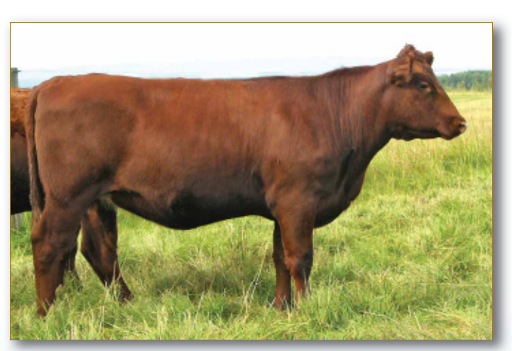
Lot 15 - Durham Red Tag 40A