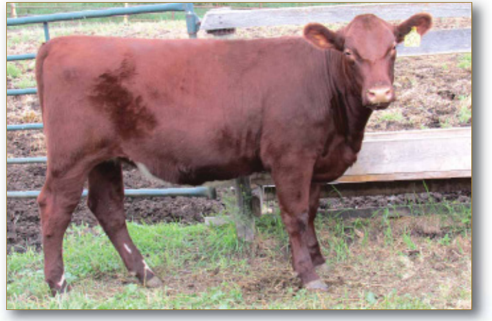
Lot 21 - Rafter W Amanda 3A

Prospect Hill Hallie May 35A is a top prospect. Her dam has not missed producing a top calf yet and her bulls have sold quickly. Due to cutting back in numbers are unable to retain her. Pregnancy checked to calve in February.