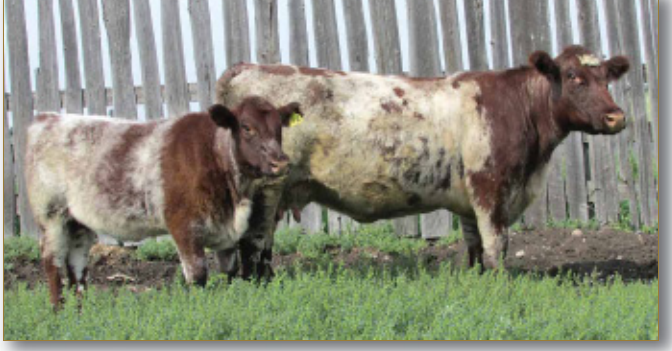
Lot 34 Recip - Paintearth Maid 41Y with her 2014 natural calf