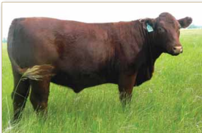
Lot 12 - Hargrave 1207 Tiffany 7Z