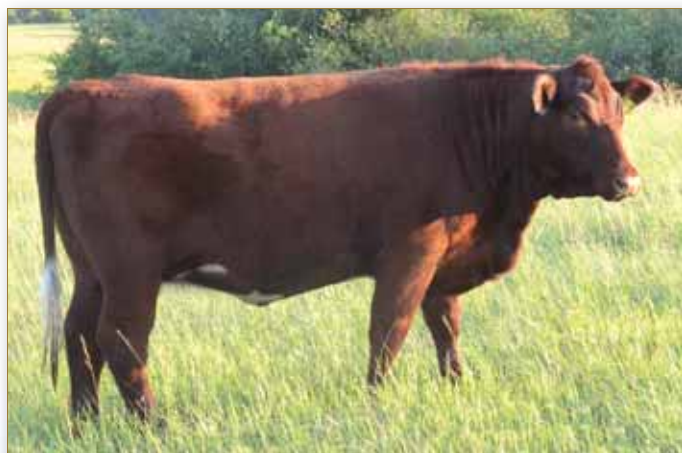
Lot 5 - Silverwillow Trans Silvia 17Z

17Z pairs up nicely with 10Z. These broody Transformer daughters make great cows, as they get older they just get better.