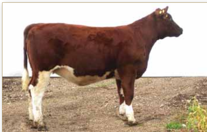
Lot 31 - Paintearth Rosebud 50A

A beautiful cherry red heifer, very feminine, and very showy. Her dam is a maternal sister to CP Grissom and has two other daughters in the herd. Her sire, 13X, is perhaps the only natural son of Byland Mission walking in Canada and is leaving calves that are deep and wide and grow like crazy.