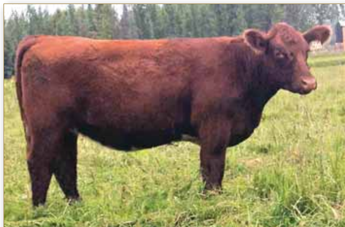
Lot 9 - Crooked Post Maria 56Z

Another solid Maria heifer on offer, we continually strive to produce this type of female. Our bull market demands that our mother cows deliver on calving ease, growth performance, maternal strength, carcass quality and physical soundness. Maria 56Z is consistent with here genetic contemporaries but is absolutely unique when compared against the Shorthorn population. She lands in the top 5% of the breed for Calving Ease, Maternal Calving Ease, Weaning, Yearling Weight, Milk and Maternal Weight Traits.