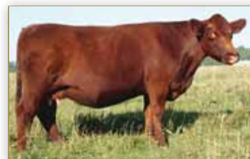
Maria 38U - Dam of Lot 7