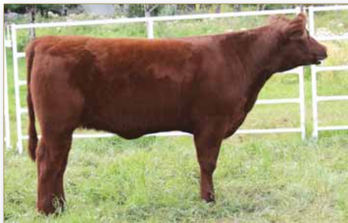
Lot 23 - Lehne Elizabeth 1A

ELF 1A is a very impressive calendar year heifer calf sired by the popular show bull Hill Haven Platinum and out of a great maternal line on the dam's side including Butterfield Elizabeth. This sweet gal will make an awesome addition to your program.