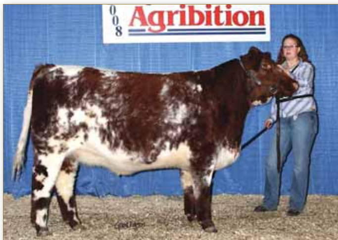
Lot 32 Donor Dam - HC FL Elsie's J-Lo 3T