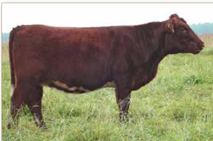
Lot 7 - Crooked Post Maria 48Z