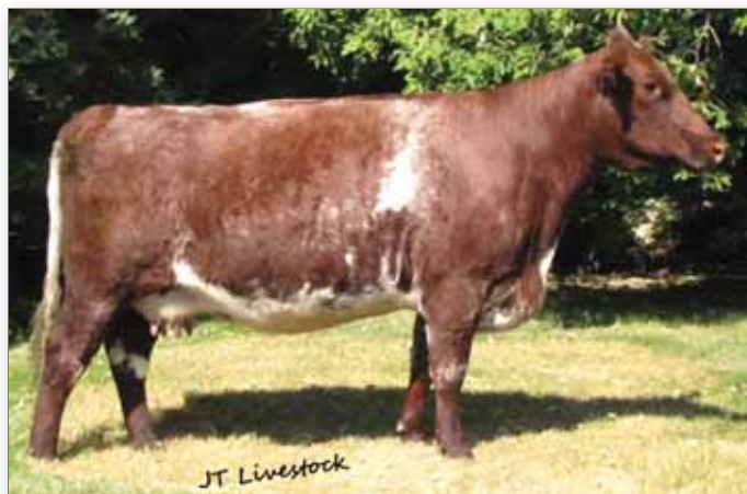
Lot 22 - Fraser's Xena Ruby 2X