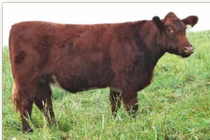
Lot 11 - Crooked Post Orange 70Z

We purchased her mother from Shadybrook as a bred heifer at the 2011 All Star Classic, she's proven to be a great female with a bright future here at Crooked Post. Orange 70Z was her first calf and another classy heifer this year.