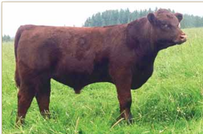
Lot 1 - Crooked Post Weiser 26A