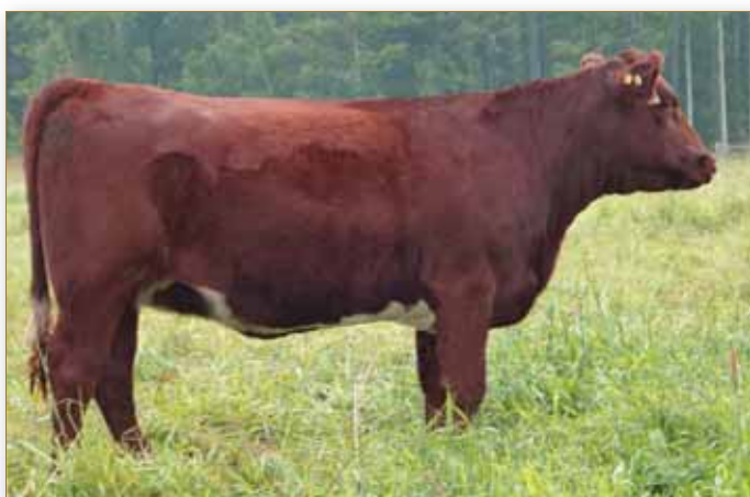
Lot 8 - Crooked Post Minnie 52Z