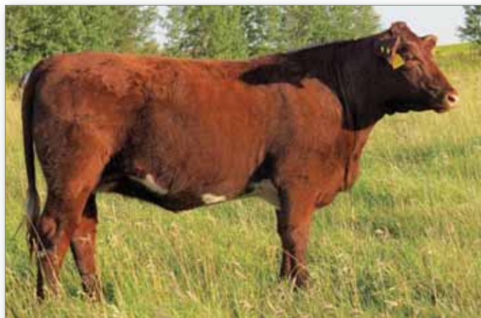
Lot 4 - Silverwillow Trans Fancy 10Z

10Z is a powerful red heifer that has a lot of potential and natural thickness. This easy doing heifer is the kind we need more of which makes it hard to let her go.