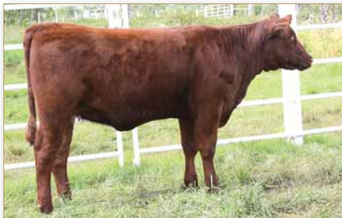
Lot 25 - Lehne Jennette 41A

ELF 24A is a very clean made, clean fronted feminine daughter of Saskvalley Vigilante and out of the top producing Princess female. You will appreciate the value in this pedigree.