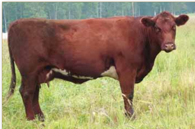
Lot 21 - Crooked Post Minnie 4IU