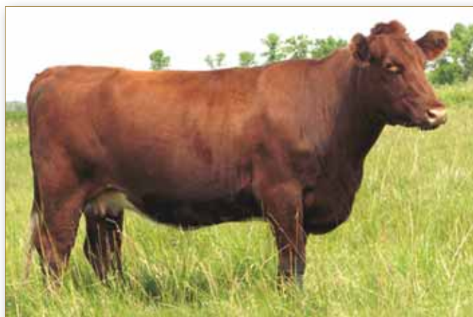
Lot 16 - Foxwillow Yew 10Y

This cross with Major Leroy and Buster 14K has proved so reliable. We already have some proven cows doing a fantastic job. Just a great powerful female deep bodied yet retaining that real feminine look. We hope we can produce more like her.