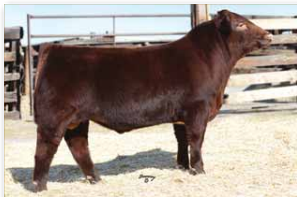
Waukaru Orion - Sire of Lot 33 Embryos

These four embryos will be the first to be offered in Canada from Orion. Orion was one of the most talked about bulls in Denver last year and I was so impressed with his muscle expression, capacity and soundness that I immediately purchased a syndicate interest in him. After thinking about my decision I decided I should purchase a second syndicate interest as he impressed me so much. I consider Sparkle Delight 2X to be the best daughter of Pioneer we have had and she is also the best daughter of Prairie Lane Sparkle 1K we have produced. We will have several ET calves born next spring from Orion and 2X. We will guarantee 2 pregnancies from these 4 embryos provided they are implanted by an experienced technician. These embryos are also exportable to many countries.