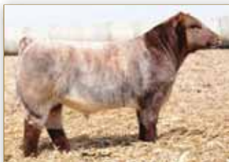
DF Talladega - Service Sire to Lot 16

Ruby Xena 2X was purchased out of the stalls at the 2010 CVWA, since then she has developed into a structurally correct, angular heavy milking young female. Her first bull calf was sold thru this very sale just last year. She has been mated to the new and very exciting DF Talladega, we feel this is a cross that will work on her combining the muscle and mass of Talladega and the maternal traits that Ruby has exhibited so far.