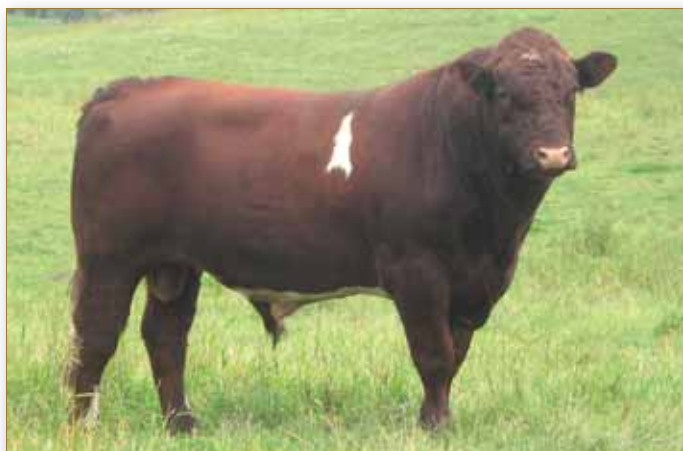
Lot 2 - Six S Yager 17Y