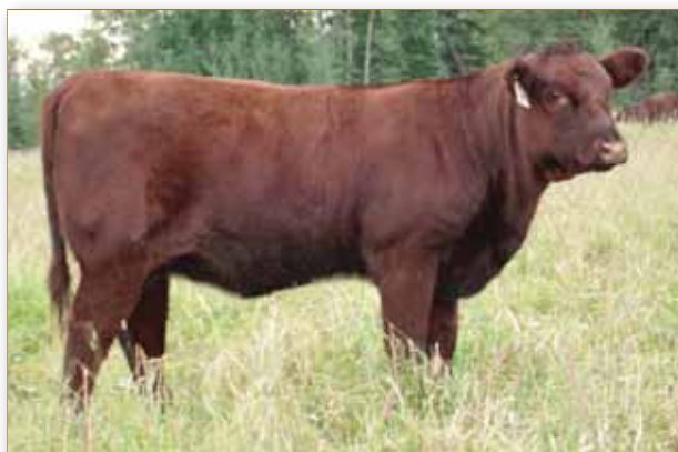
Crooked Post Lass 14Z

In the 2012 All Star Classic we offered the impressive pair of Crooked Post Lass twins selling to Tom Green Farms Ltd., Calgary, AB, and to Westridge Shorthorns, Valley City, N. Dakota. Now we present to you a full brother to this pair, Crooked Post Weiser 26A. For his age he is bold and expressive in his skeletal structure and muscle mass, good testicle development, square tracking and sound made. Serious herdsire potential.