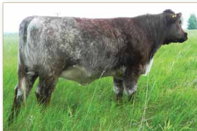
Lot 13 - Hargrave 1209 Fantasy 9Z