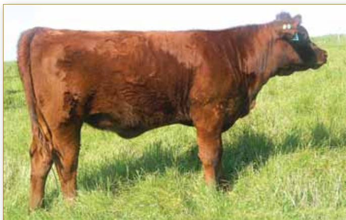
Lot 30 - Hargrave 1308 Red Rose

Paintearth Walter has put a real stamp on his first calf crop at Starbright Shorthorns. 13A is another fancy female who you will love to add into your program.