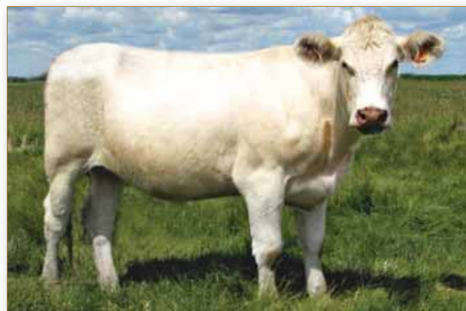
Lot 19 - Foxwillow Yewberry