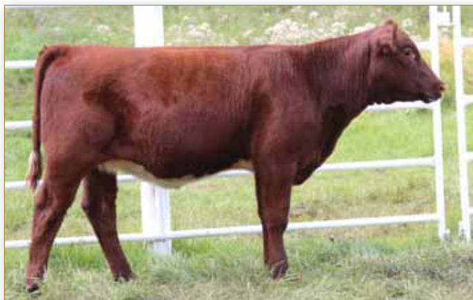
Lot 26 - Lehne Princess 124A

Evergreen Lane Farm has consigned four sweet heifers including ELF 41A. She is another powerful daughter of Hill Haven Platinum and out of the great producing Jeanette line on the dam's side of her pedigree.