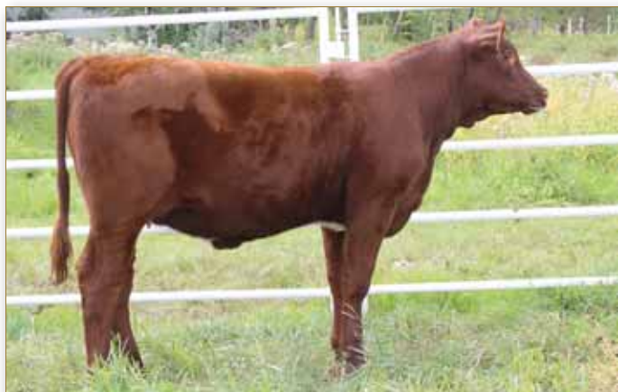
Lot 24 - Lehne Duchess 24A