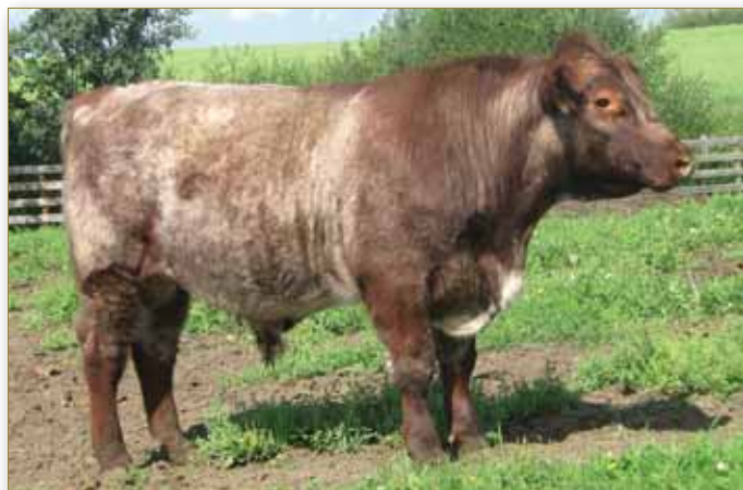
Lot 3 - Six S Zed 37Z

A chip off the old block, Zed looks just like his dad. Super patterned, rugged and muscular with a great hair coat, the type the commercial cattlemen are looking for. He has the features that a herd bull should possess and the genetics to back it up. A bull we are proud to put our name on.