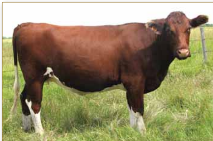
Lot 15 - Foxwillow Yokel 4Y

Foxwillow Yokel is by Ultrasonic a Major Leroy son and out of Star P Josie by Gold Spear the breeding says it all. She is a deep bodied female with loads of femininity. We have had some great females by this sire and these are the first we have offered for sale. Yeates is out of HC Raggedy Ann 24W by Hillside Leader a calving ease sire, low birth weight calves with plenty of muscle and growth, yet ideal frame.