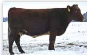
Minnie 20T - Dam of Lot 8

Her sire, CP Jackaroo 36X, saw use at Crooked Post on 30 females in 2011 before Lund Farms scooped him up for their 2011 fall breeding season. They claim he is the ultimate heifer bull that doesn't compromise pay weight and his daughters are held as replacements.