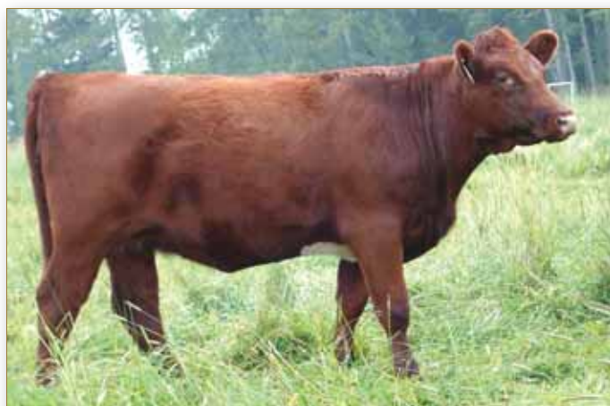
Lot 10 - Crooked Post Minnie 60Z