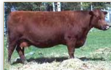
Red Rose 48S - Dam of Lot 20

The Shorthorn breed has been noted as the breed to turn to in order to increase fertility rates, mothering ability and marbling traits in a cowherd. The American Shorthorn Association recognizes the superior bulls that pass on these relevant traits as Pacer Performance Sires. In the decades that this award has existed, there has been only three bulls in the breed that have qualified, Waukaru Gold Card 5042 is the third bull and the youngest bull to have earned this prestigious title. All facts and figures aside, Red Rose 17Y is also a great specimen.