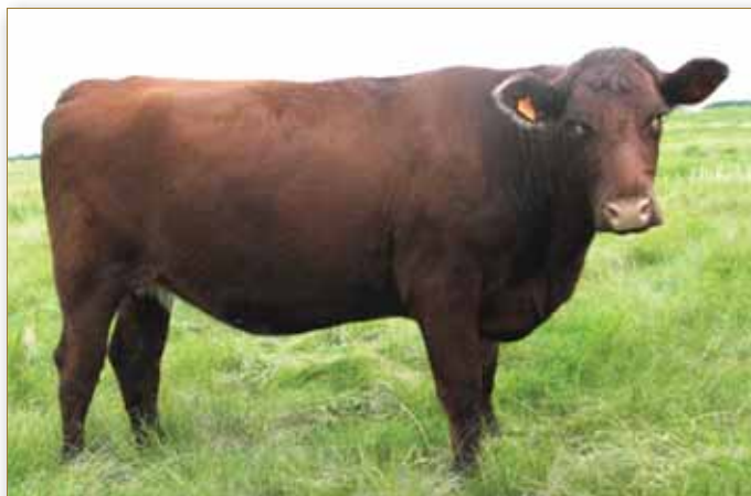
Lot 18 - Foxwillow Yuppy 18Y