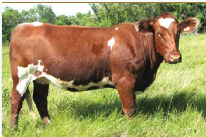
Lot 17 - Foxwillow Yonder