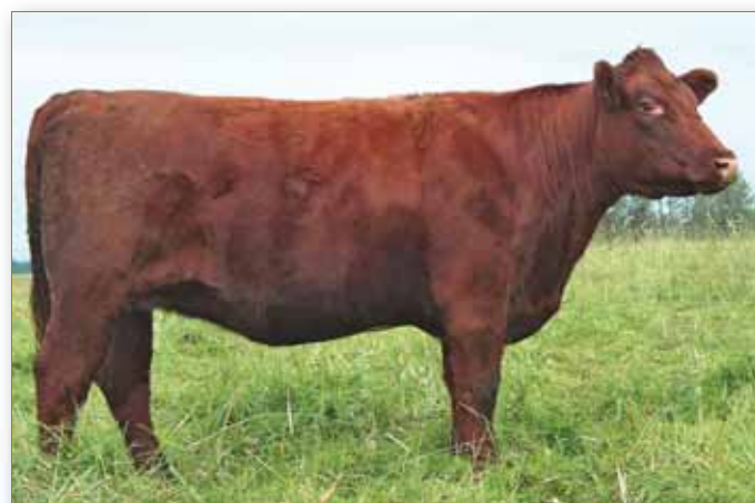
Lot 20 - Crooked Post Red Rose 17Y