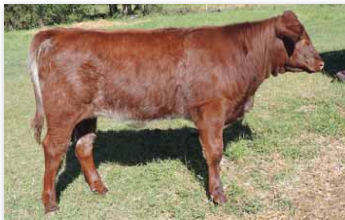
Lot 29 - Starbright Alice 13A

Abigail 11A is a fancy, sweet made daughter of Paintearth Walter who is sure to catch your eye. Her dam consistently produces excellent progeny.