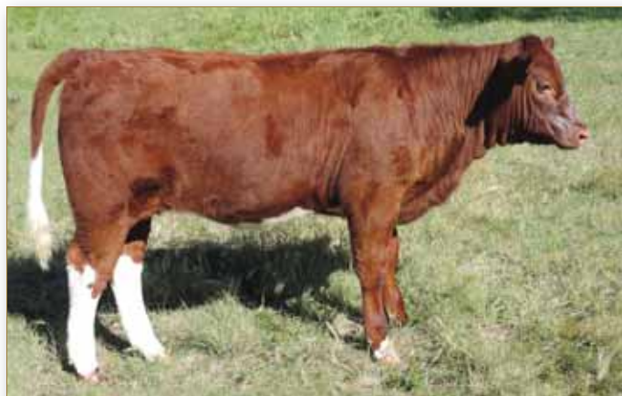
Lot 27 - Starbright Ginger 10A

When you combine the top Shorthorn sires of Paintearth Rama and Saskvalley Vigilante the results are fantastic. Lehne Princess 124A is a granddaughter of Gar-Lind Princess 51S, also the dam of lot 24.