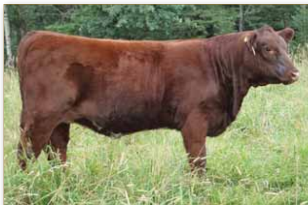
Crooked Post Lass 15Z