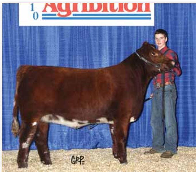
Lot 33 Donor Dam - HC FL Sparkle Delight 2X

We felt mating Primo with our J-Lo donor would result in some pretty good offspring and after having an excellent flush, we have decided to share four of them in this sale. J-Lo is a full sister to our Elsie Jade female that has been so popular with breeders in many countries. J-Lo has produced some excellent offspring for us and she possesses tremendous thickness and fleshing ability herself. Primo was the senior herd sire at Alta Cedar and Diamond for several years and he is recognized as a sire of superior progeny. We offer our standard pregnancy guarantee of 2 pregnancies at 70 days from these 4 embryos providing an experienced embryo technician is used. These embryos are exportable to most countries.