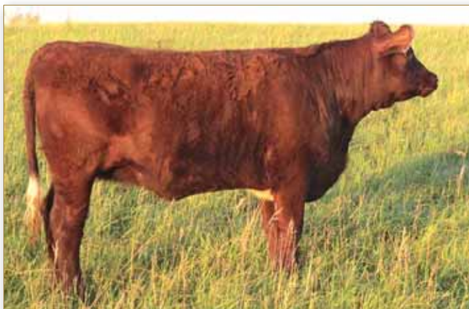
Lot 6 - Silverwillow Trans Dawn 21Z