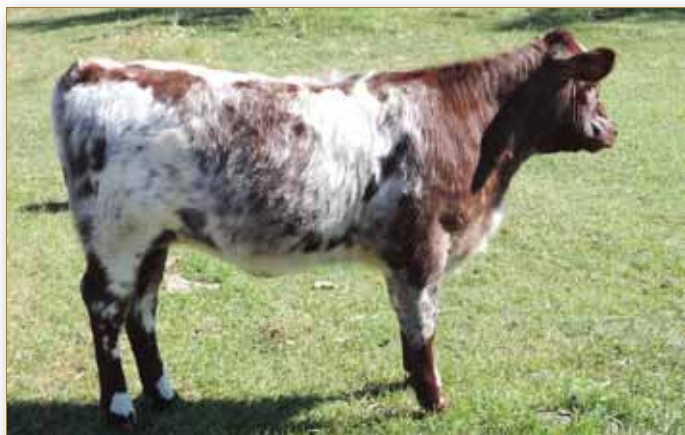
Lot 28 - Starbright Abigail 11A