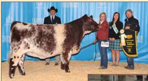
JTPH After Party 588

This is the second of our two flush mates to the 2016 National Champion Female. 101D is soft in his makeup with mass and bone. He still has the look that made his sister such a crowd favorite all fall but cross that with his 83 lbs. birth weight and this bull should be a great asset to any program. TH/PHA/DS Free by Pedigree