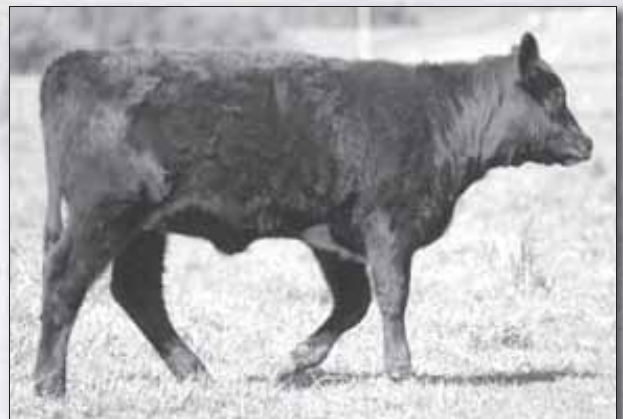
Lot 37 - UR Yvette 51Y

Consignor: UR RANCHES - Ardrossan, AB She is well put together with the genetics to back up her up. Her sire, Big Sky Addictive, is a powerful bull whose calves are always consistent and her dam is a moderate framed easy-going cow.