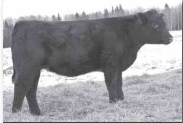
Lot 42 - Crooked Post Hope 58Y