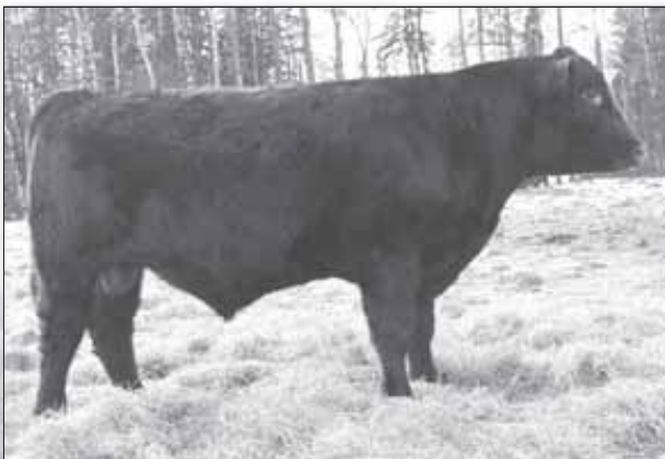
Lot 10 - Crooked Post Gauge 26Y