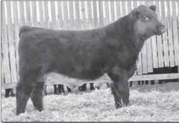
Lot 1 - Kenlene Yogie 6Y