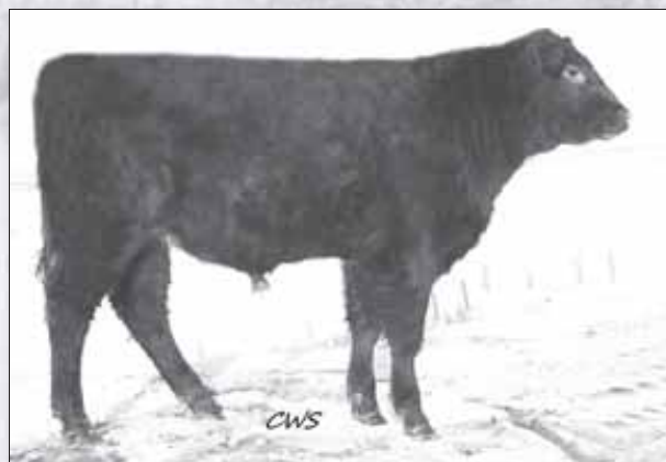
Lot 22 - Diamond Yamen 5Y

Consignor: DIAMOND SHORTHORNS - Okotoks, AB Here is a roan polled son of ACC General 4U out of a paternal sister to Diamond Prophecy 21P. Both his sire and full brother are herdsires at Anwender Cattle Company - Radville, SK.