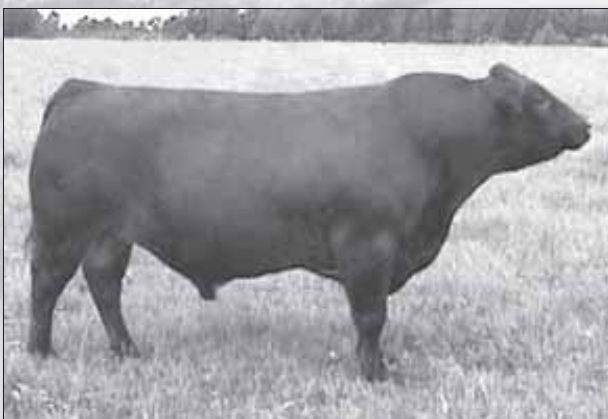
Crooked Post Grissom 24T - Sire of Lot 10