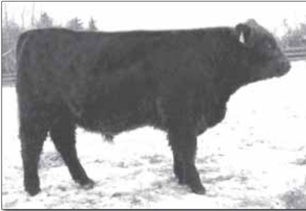
Lot 15 - Paintearth Tony 43Y