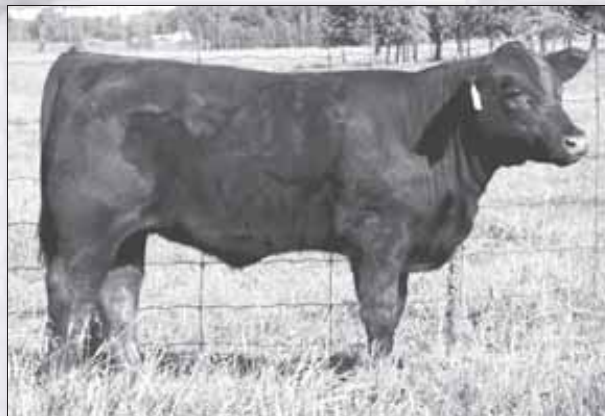
Crooked Post Red Rose 15W - Dam of Lot 40