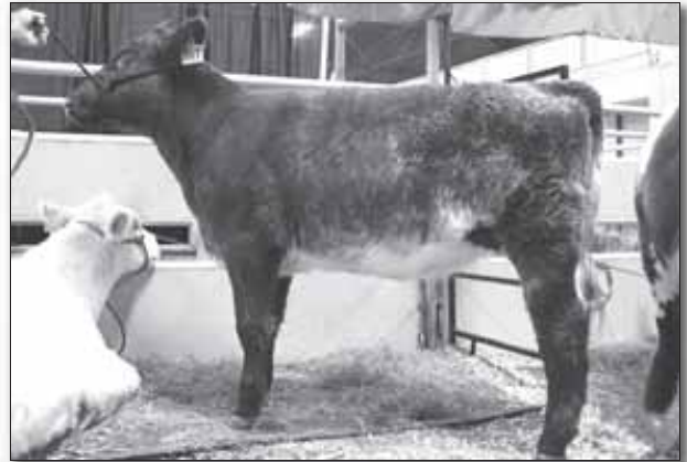
Lot 36 - YR Ysabel 31Y

Consignor: UR RANCHES - Ardrossan, AB A large framed heifer who comes from a moderate good milking cow.