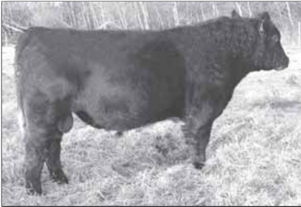
Lot 24 - Silverwillow Trans Zeld 6X