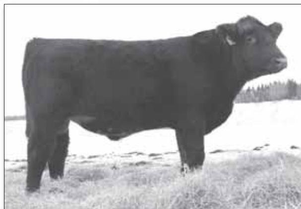
Lot 11 - Crooked Post Pueblo 32Y

Consignor: CROOKED POST SHORTHORNS - Rocky Mountain House, AB His dam Minnie 30U is another ET daughter from CP Minnie Capri. 30U's first bull calf we used ourselves and he is now seeing service at Lund Farms Inc. who have used over 20 Crooked Post bulls in the last decade.