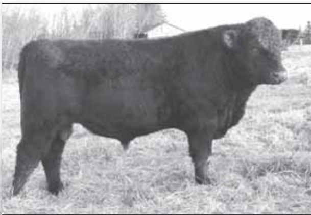
Lot 25 - Silverwillow Trans F Cory 9X