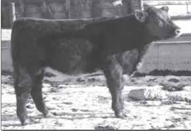
Lot 2 - Kenlene Yancy 2Y