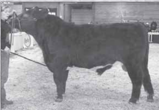
Lot 33 - Kenlene Whatz Up 8W

Here's your chance to purchase a proven herdsire. Matlock Watchman 79W was my herdsire in 2010 and 2011. His calves possess length of body, eye appeal, growth and natural thickness. Watchman was the sire of our heaviest steer calf that sold in 2011.