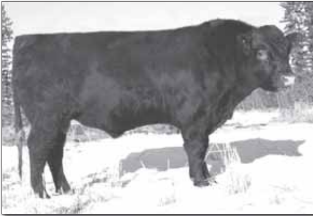
Crooked Post Pueblo 77U - Sire of Lot 38