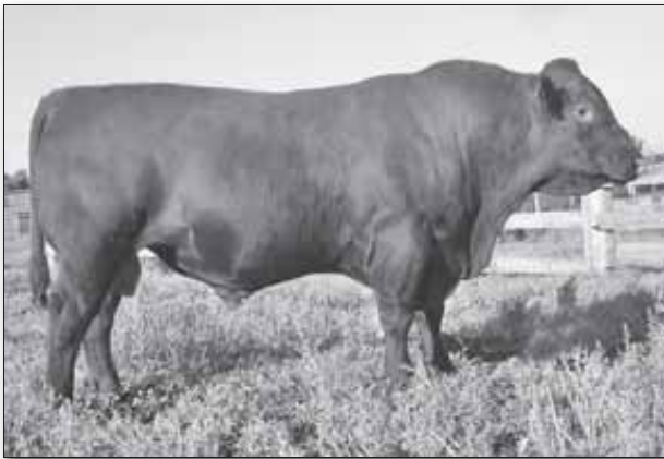
Paintearth Walter 58W - Sire of Lot 16

Consignor: PAINTEARTH SHORTHORNS - Castor, AB 48Y is a direct son of the high selling bull at the 2011 All Star Classic Sale and who was 3-time Alberta High Point Show Bull - Paintearth Walter 58W.