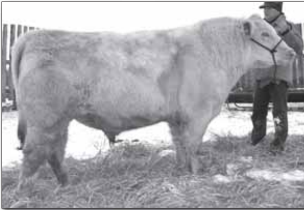
Lot 32 - Matlock Watchman 79W