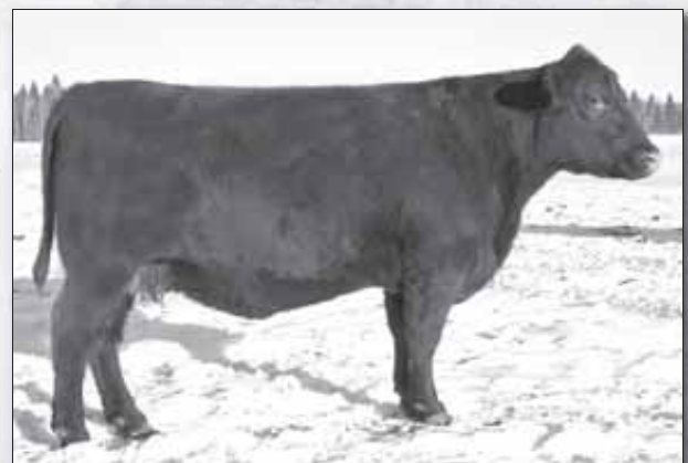
Crooked Post Hope 8T - Dam of Lot 10

Consignor: CROOKED POST SHORTHORNS - Rocky Mountain House, AB The Grissom sire is seeing service in 3 continents. In the latest Shorthorn Sire Appraisal Summary, he's a trait leader in six traits. When it comes to highly proven sires who carries calving ease, growth performance, fleshing ability, maternal and carcass traits, Crooked Post Grissom 24T stands among very few. Gauge's dam gave a great contribution to the All Star Classic sale last fall sending one daughter to Y Knot Shorthorns of Cochrane and another to Huron Grove of Ontario. Gauge ranks in the top 10% of the breed for all seven basic trait predictors.