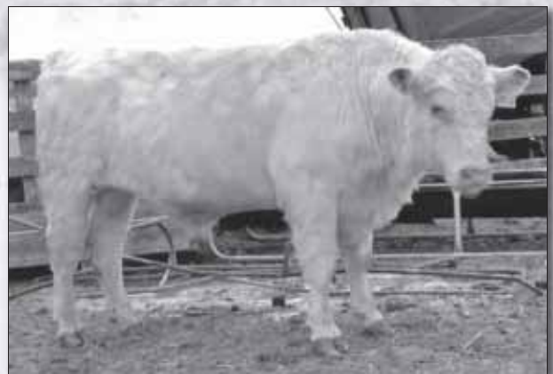
Lot 29 - Glory-Jay Shamrock Xavier 8X

JGC 8X is a smooth made, white son of Shamrock 1S - a sire that adds performance into his calf crop. He sired the high gaining, high indexing Shorthorn bull at the 2011 Lakeland Bull Test Station.