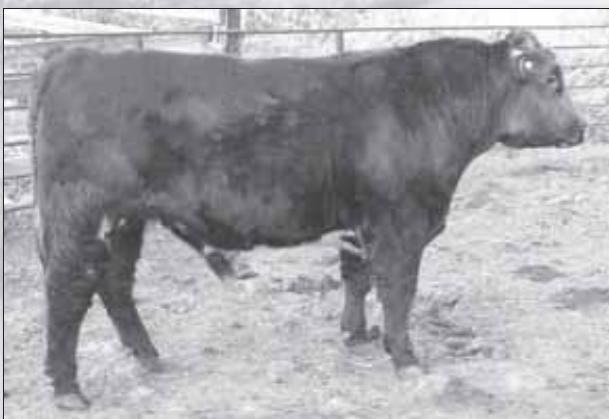
Lot 26 - Lazy H J Cha Ching 7X