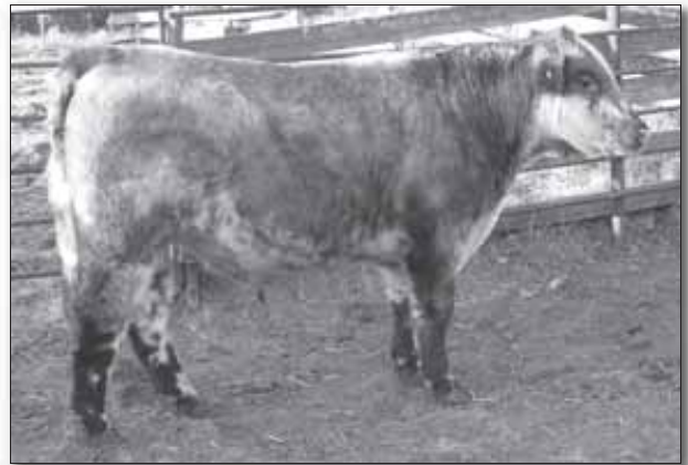
Lot 28 - Lazy H J Nitro 18X

This twin is a deep bodied bull with a good temperament. His mother is admired by visitors for her depth of body and thickness wrapped in beautiful roan hair. Nitro 18X's sire, Nitro 11N, is easy calving in our herd.