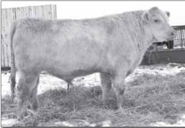
Lot 31 - HH Panther 60X