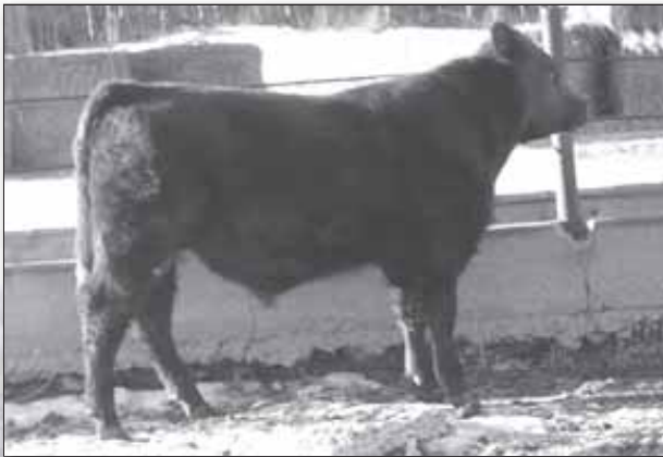
Lot 3 - Kenlene Yoyo 8Y