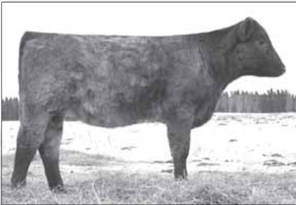
Lot 40 - Crooked Post Red Rose 46Y