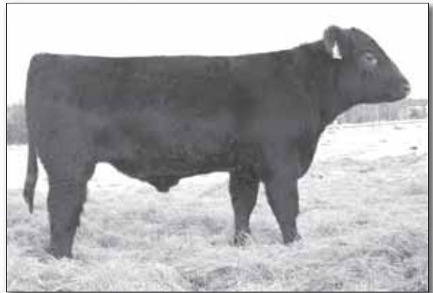
Lot 4 - Crooked Post Tillerman 4Y

Consignor: CROOKED POST SHORTHORNS - Rocky Mountain House, AB The first Grissom 24T daughters were a pleasure to calve out. They are structured for calving ease, are level-headed strong mothers, plenty of milk, great udder structure; 'hands-free' calving! Tillerman is a long spined, smooth bodied, well muscled bull. He ranks among the top 5% for calving ease, weaning, yearling growth and milk production predictors.