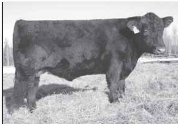
Lot 12 - Crooked Post Tamworth 37Y

Consignor: CROOKED POST SHORTHORNS - Rocky Mountain House, AB Raised by one of our finest heifers and sired by Crooked Post Tamarack 17W. Tamarack saw service across our heifer group in 2010. We have had this last year to reflect and admire his calf crop since we sold him to Cedar Grove Shorthorns in Quebec; we should have collected him. Tamworth is a powerhouse yearling; he is full of dimension, ruggedly constructed and moves about like a champion.