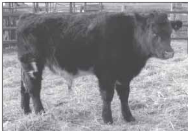
Lot 19 - Glory-Jay Shamrock Yale 14Y

Consignor: GLORY JAY SHORTHORNS - Alix, AB JGC 14Y is a top pick of Glory Jay's 2001 bull pen. He has the performance of the sire's genetics and the strong maternal values on the dam's side of his pedigree.