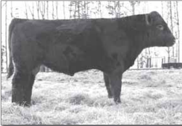
Lot 8 - Crooked Post Powell 19Y