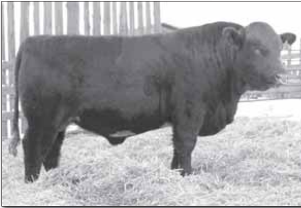
Lot 23 - Silverwillow Trans Sparing 3X