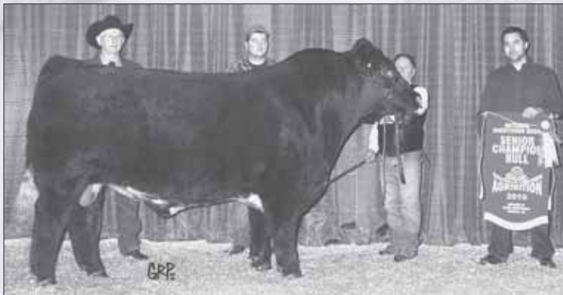
JSF Addicted 82U - Sire of Lots 1, 2 & 3