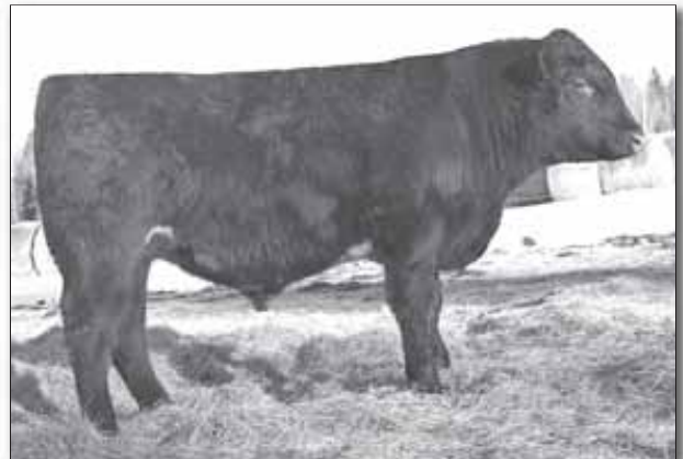
Lot 5 - Crooked Post Cascade 8Y