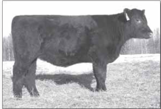
Lot 41 - Crooked Post Goldie 55Y

Consignor: CROOKED POST SHORTHORNS - Rocky Mountain House, AB From a cash generating cow whose first heifer gave us the Tillerman bull, second heifer was purchased by Tom Green Farms, and now Goldie 55Y. She is full of power, placing in the top 3% of the breed for all trait predictors, and indexes over 111 on weaning weight against her peers.