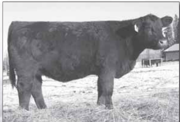
Lot 43 - Crooked Post Hope 71Y