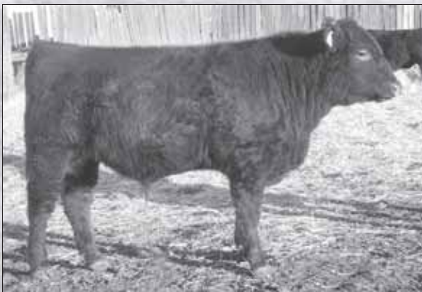
Lot 18 - Paintearth Nick 82Y

Consignor: PAINTEARTH SHORTHORNS - Castor, AB 60Y is a clean fronted, easy moving prospect who will add growth into your calf crop.