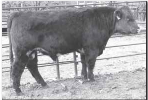
Lot 27 - Lazy H J Diesel 9X

Diesel 9X is a very free moving athletic bull will great length of spine. His dam is a maintenance free, fertile, excellent uddered easy to handle individual. His sire, Ultra 7U is described as discerning cattlemen as a moderated framed, easy fleshing, deep girthed package and a proven sire.