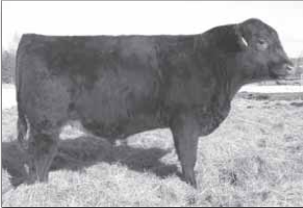
Lot 9 - Crooked Post Fergus 20Y