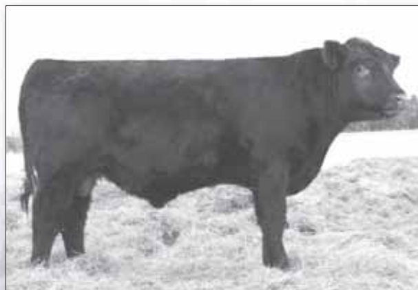
Lot 13 - Crooked Post Anchor 39Y

Consignor: CROOKED POST SHORTHORNS - Rocky Mountain House, AB We have been producing the Durham Reds for a few years now and our customers have been very pleased with them. This combination can complement the best of both breeds. Anchor 39Y is solid in his makeup, docility, good footed and deeply made.