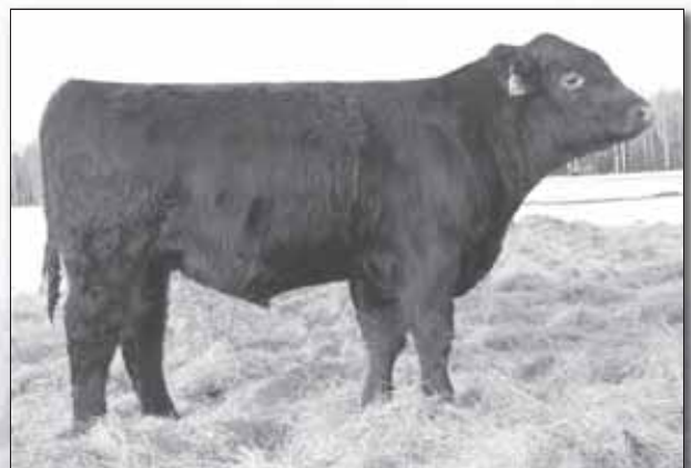
Lot 6 - Crooked Post Mahogany 10Y

Consignor: CROOKED POST SHORTHORNS - Rocky Mountain House, AB An outstanding individual from his beginning; his dam is a really sweet first calved Belmore United Chief U21 daughter. We treasure our U21 daughters and Mahogany is one of the reasons why. Within the measured Shorthorn population, Mahogany 10Y easily ranks within the top 10% for calving ease, growth performances and milk production traits. He is massive in capacity, full of muscle and style.