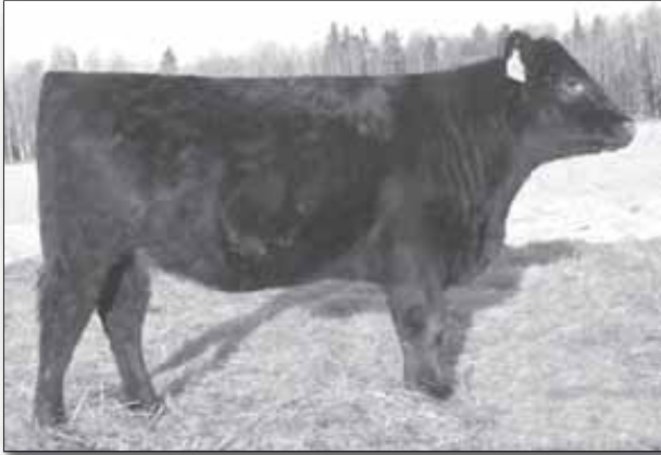
Lot 39 - Crooked Post Rosette 41Y