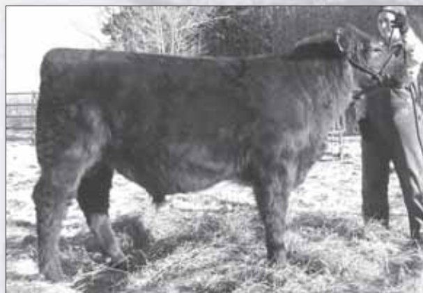
Lot 14 - HH Jackaroo 1Y

Consignor: HAYDOCK, HEATHER DAWN - Elk Point, AB HH Jackaroo is out of a first calf Grissom daughter. Crooked Post Hope 5W, Jackaroo's dam, had the highest REA and IMP scan out of the 2010 Crooked Post heifers. Jackaroo had an 80 lb unassisted birth weight. He could be your next red, polled heifer bull.