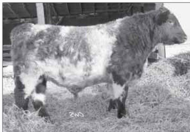
Lot 21 - Diamond Sergeant York 10Y

Consignor: GLORY JAY SHORTHORNS - Alix, AB JGC 16Y is a moderate made, thick prospect that has great breeding on both sides of his pedigree. Be sure to check him out sale day.