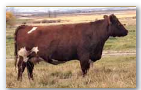
DRS Emerald Rock 24W - Dam of Lot 31