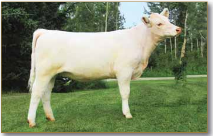
Lot 32 - Lilac Lane Spirit Elsa 2E