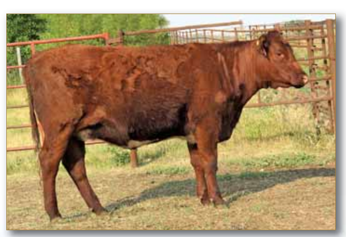
Lot 12 - Diamond Dream Baroness 20D

I had never planned on parting with this Diamond Braveheart 21B heifer. She is out of one of my favorite female lines which combines productivity with longevity. Dream is impressive over the top with a great spring of rib. Sells bred to Diamond Dundee 26D for an April calf.