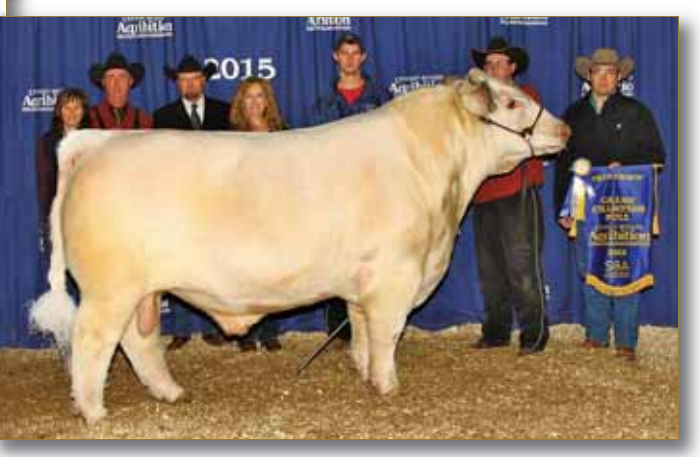
Lot 46 Embryo Sire - Bell M Foreman 30A

A genetic combination of two outstanding beef animals. Melba Niam 8T is a daughter of Saskvalley Pioneer 126P and one of our all time favorite cows, HC Melba Niam 98H. 8T has produced several outstanding calves including two heifers that won their class at Agribition but she is also known as being the dam of Shady Lane Rockstar 9X, who was an Agribition Grand Champion bull. 8T is a model female with a moderate frame, great muscling and an excellent udder. She is well balanced and smooth. She is the kind of cow everyone wants to have their herd bull from. This mating with Bell M Foreman 30A should produce some exceptional offspring. Foreman was Grand Champion Bull at Agribition in 2014, but more Importantly, he is one of the best commercially oriented bulls to be shown in many years. He is massive, thick and sound structured as well as being loose hided and soft made. These embryos could produce your next herd bull or a front pasture female for your herd.