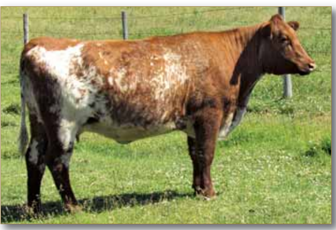
Lot 27 - River Acres Talcott Joyful 22C

Crooked Post Margot 14C measured up with exceptional fat and muscle scores with her marbling index at 108, backfat 135 and ribeye/cwt at 115. From a solid and dependable female from Hill Haven combined with the functionality and performance power of Tobermorey, expect a terrific production career from Margot 14C.