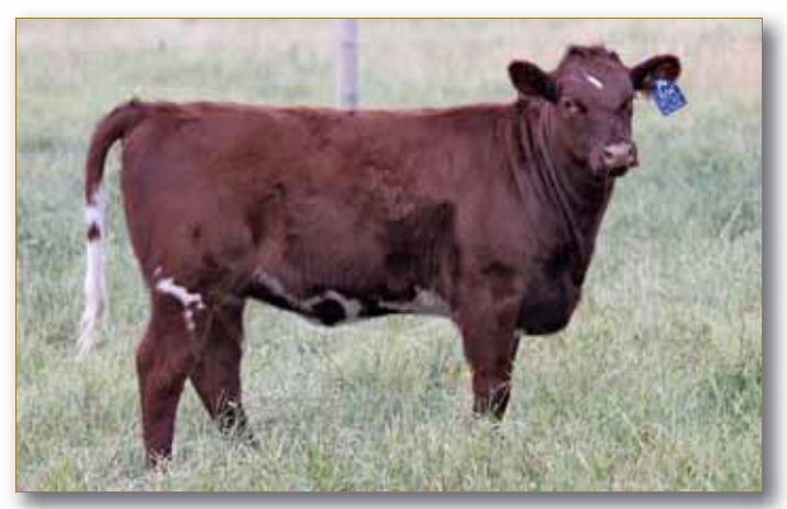
Lot 33 - Janell's Emilia 53E

This fancy female has been an eye catcher from the start. Her pedigree is stacked with top producing females. She is already showing the depth of body and rib to make a great brood cow like her dam. We sold her maternal sister, Janell's Macy at last year's 6th All Star Classic Shorthorn Sale.