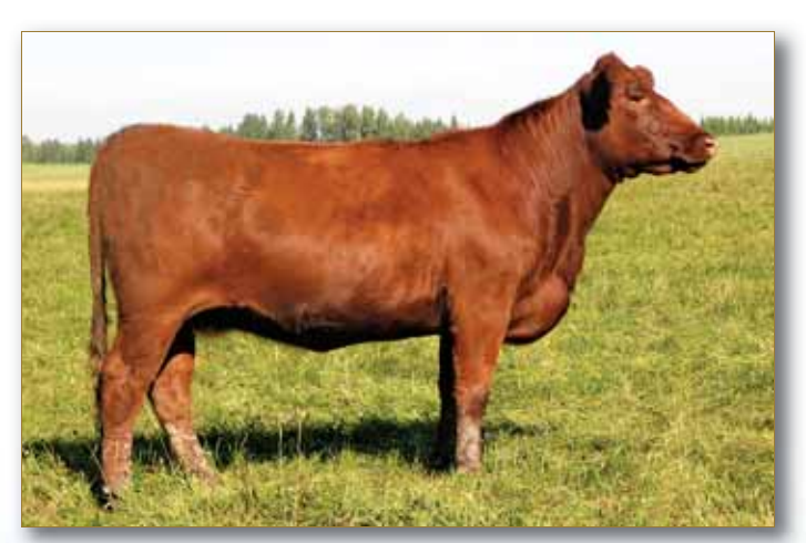
Lot 25 - Crooked Post Red Rose I2C

Another example of the very capable and prolific Yamburgan Tobermorey F90. We don't sell many F90 females but in an effort to demonstrate the maternal aspects that the bloodlines deliver we offer Red Rose 12C. Through 2016-17 seasons our Tobermorey sons have averaged at public auction and privately off the farm just over $7000