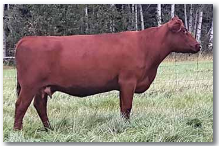
Lot 24 - Crooked Post Lassie IOA

Here is another strong Minnie that we should be hiding at home for the next 10 years. Ultrasound Indexes found her at 136 for Lean Meat Yield and 127 for REA/cwt; a true beef cow with strong maternal influences ranking in the top 4% of the breed for British Maternal Index, a rare combination.