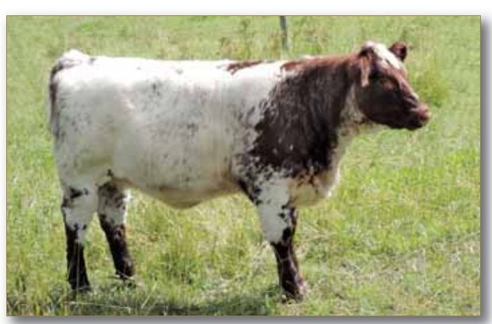
Lot 41 - Kenlene Doreen 2E