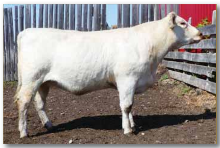
Lot 5 - Paintearth Nina 59D

What a combination! RAMA and RAMROD. We are offering this fantastic combination only once.