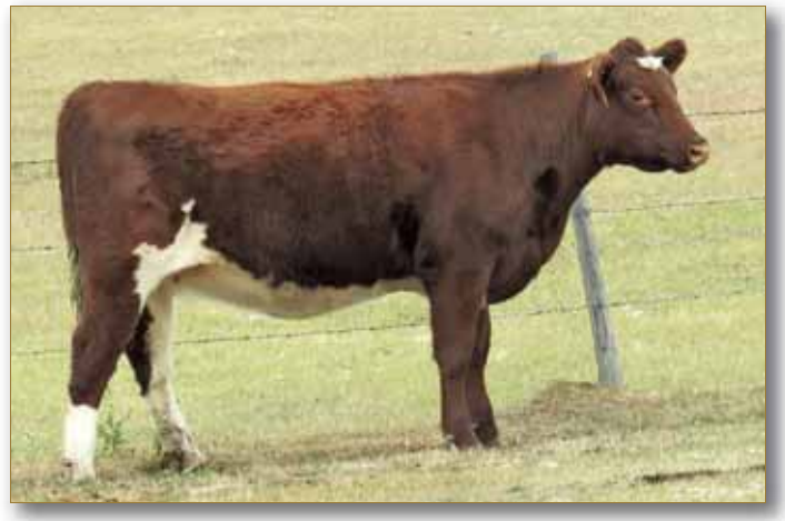
Lot 10 - Diamond Minnie Daffodil 60D

A good young heifer by Diamond Lord Belmore 56B and out of a daughter of Diamond Zulu 3Z. She is a granddaughter of the great producing Diamond Minnie Searle 11S still producing in the herd. Zulu sold to Lonny Flack and Family, Oakview Shorthorns in lowa where he has left some excellent offspring. We think 60D will make someone an excellent young brood cow.