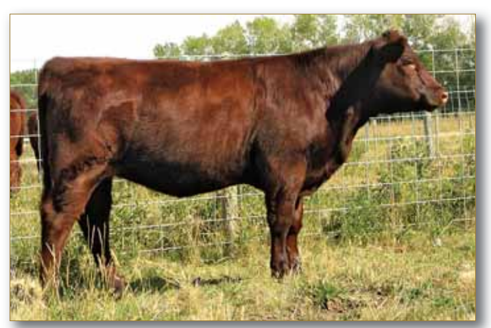
Lot 29 - DRS Picture Perfect 14D