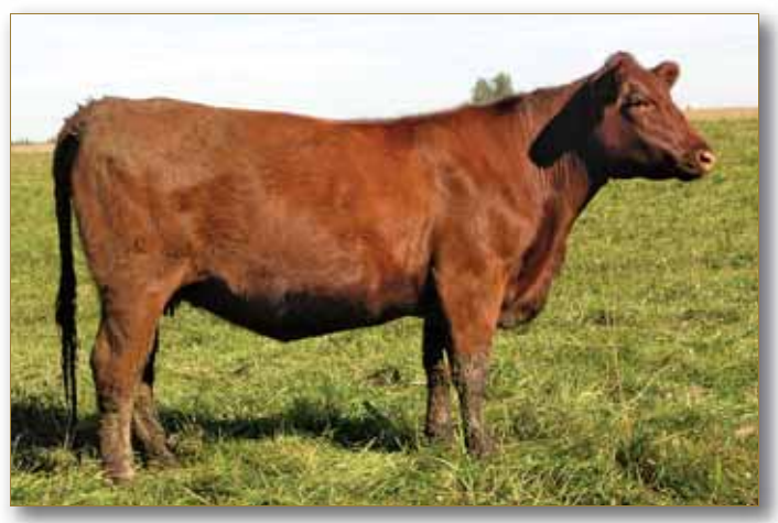
Lot 26 - Crooked Post Margot 14C