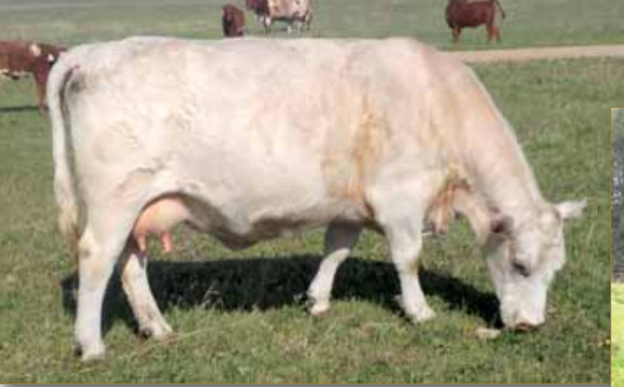
Lot 45 Donor Dam - Frimley Rene Dottie 72R

HORSESHOE CREEK FARMS LTD. - Weyburn, SK