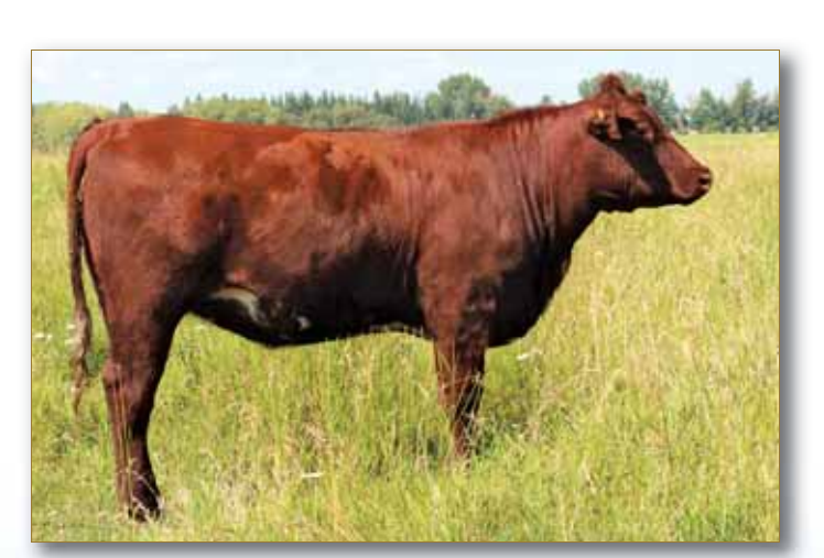
Lot 9 - Sharom Dierdre 98D