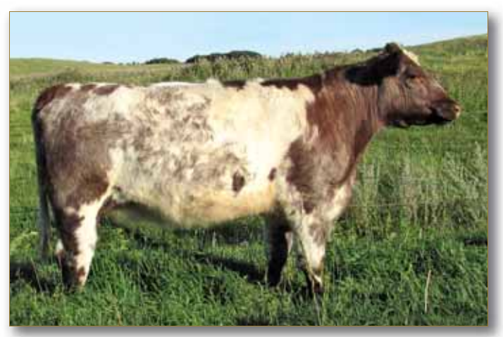
Lot 17 - Prospect Hill Dance Butterfly 20D

This April 1st heifer is long and tall and will be an excellent cow. Her dam is a larger cow and her sire is Admiral 36A who has been herd sire for 4 years and isn't going anywhere. Delta Dawn is bred to RCS Carbide 11C who is a proven easy calver and is a son of JSF addicted. Polled and TH free.