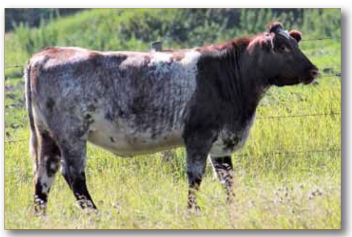
Lot 7 - Sharom Sugar Drop 57D