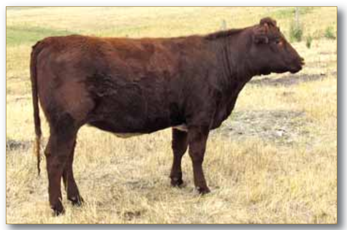
Lot II - Diamond Desired Baroness 61D