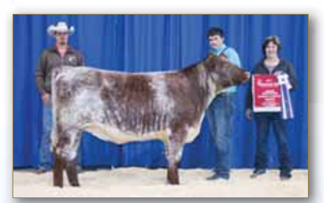
Sharom Dewdrop 67D High Selling Heifer Calf All-Star Classic 2016 Reserve Grand Champion Female Red Deer 2017

Interesting pedigree on this young gal. Byland Gold Spear and Captain Obvious make an appearance. She is a very feminine looking heifer and is shaping up very nicely on pasture. This is the first heifer her dam has produced and we are proud to offer her in this sale.