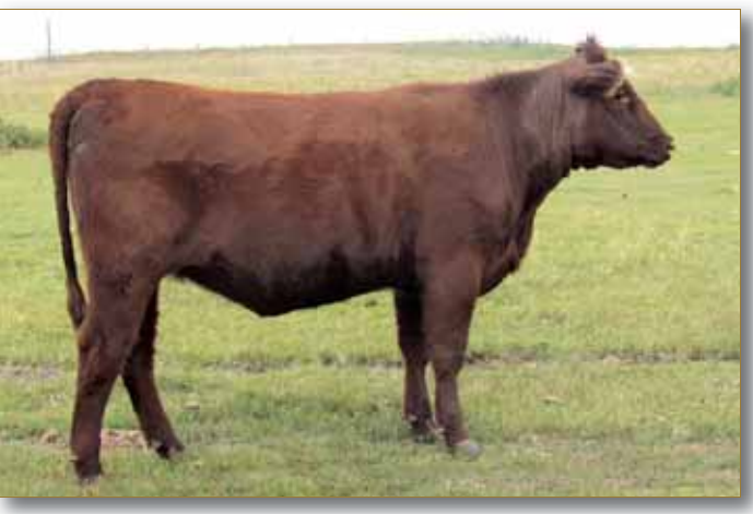
Lot 14 - Double Star MT LU 53D

Crocus 31D was purchased this spring as part of the herd expansion from the Double Star program. Unfortunately dry weather has put that plan on hold! Crocus combines a number of influential sires from a number of great cattle operations, Alta Cedar Ultimate 130K, Alta Cedar Signature 41S and being by Saskvalley Wholesale 114W she is a paternal sister to Saskvalley Yesterday 116Y. She saw service to one of the best bulls we have ever bred Diamond Dynamite 6D for a March calf.