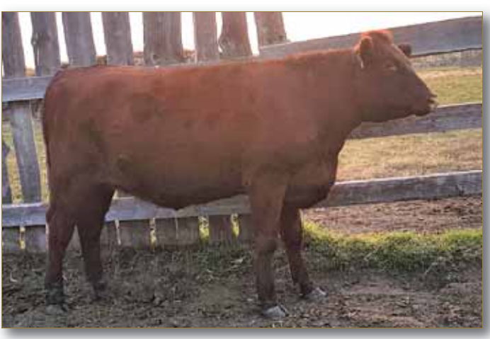
Lot 18 - Prospect Hill Delphine 21D