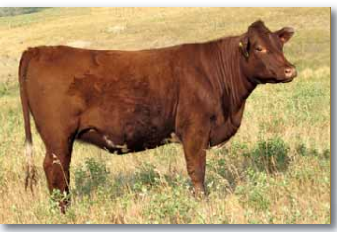
Lot 15 - Double Star SVW Rose 66D

Lu 53D is one of the most docile females I've come across. Double Star Shorthorns imported her sire from the States giving an outcross to a number of Alberta pedigrees. Lu has performance, fleshing ability, and eye appeal. She should have an outstanding calf in early February by Diamond Dundee 26D. Dundee is a light birth weight (79 lbs.) son of Diamond Braveheart 21B.