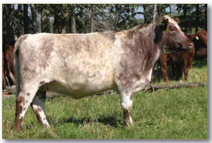
Lot 2 - Crooked Post Minnie 7D