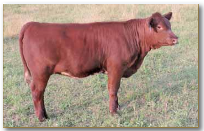
Lot 39 - Starbright Ellie May 19E

A showy AI heifer sired by Rockstar, Grand Champion bull at Agribition in 2011. Her dam is a Walter daughter out of our favorite cow family. Her dam's full sister was very well received as the donation heifer here in Lacombe in 2015. This cow line, going back to the Australian bull, Spry's True Blue, are all good uddered, good footed, good tempered, good producing females. Their offspring are always at the top of the pen.