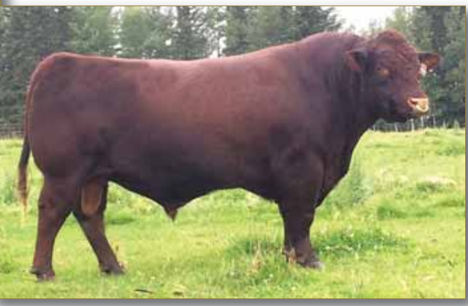
Lot 45 Embryo Sire - Crooked Post Stockman 4Z

HORSESHOE CREEK FARMS LTD. - Weyburn, SK