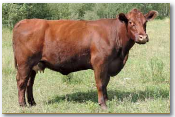
Lot 28 - Kenlene Elizabeth IB

We purchased this lovely two year old heifer as part of our herd expansion this spring from the River Acres dispersal sale. She had a 80lb bull calf the day she arrived home and has been a easy female to work around. We are only offering her as the drought has forced us to cancel growing our numbers for this year. She is sired by a son of the great cow maker Highfield Irish Mist! Joyful is bred to the pure Australian bull Diamond Down Under 3D for an April calf which we feel will be extremely exciting.