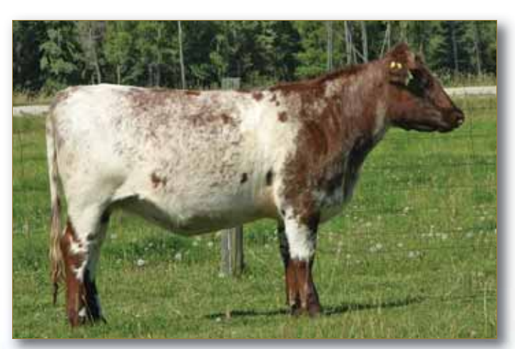
Lot 3 - Crooked Post Red Rose IOD