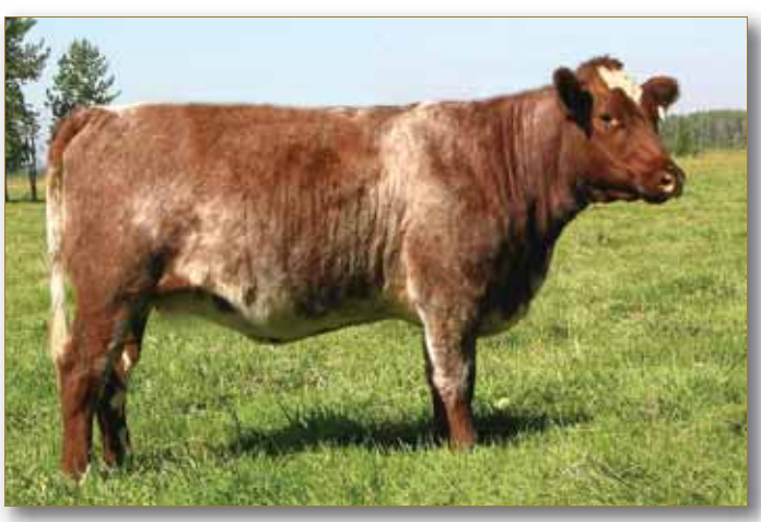
Lot 4 - Crooked Post Lassie 19D

A powerful, red meat Detail daughter with a measured index of 115 for ribeye area; the highest of the Detail daughters. Her dam is a hard working JT Exclusive 65X daughter and whose first calf is perhaps one of our finest Stockman daughters in production.