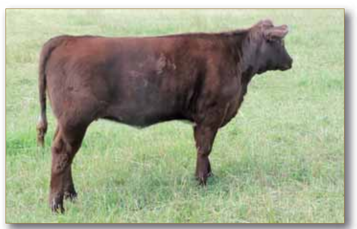
Lot 36 - Starbright Eva 5E