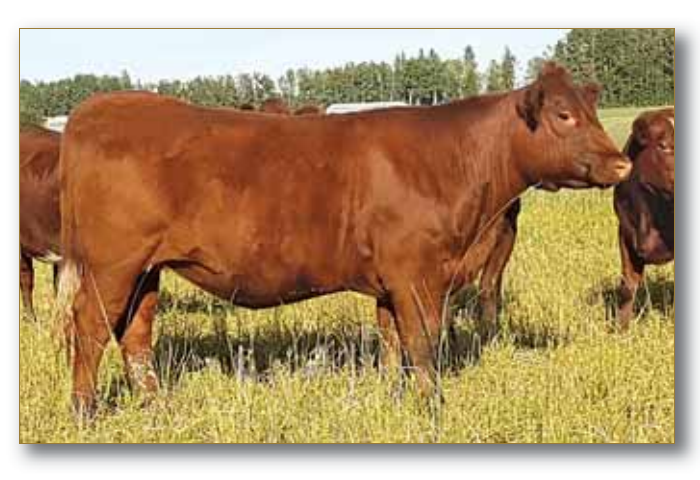
CROOKED POST SHORTHORNS - Rocky Mountain House, AB