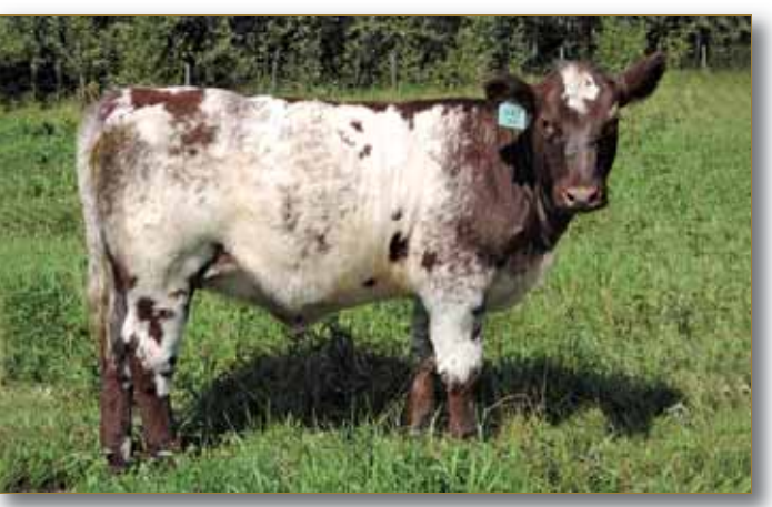
Lot 35 - Starbright Cheer 4E

This red female has the femininity and performance to be a solid producer in any breeding program. Her mother is an easy keeping young cow with an excellent udder and temperament.