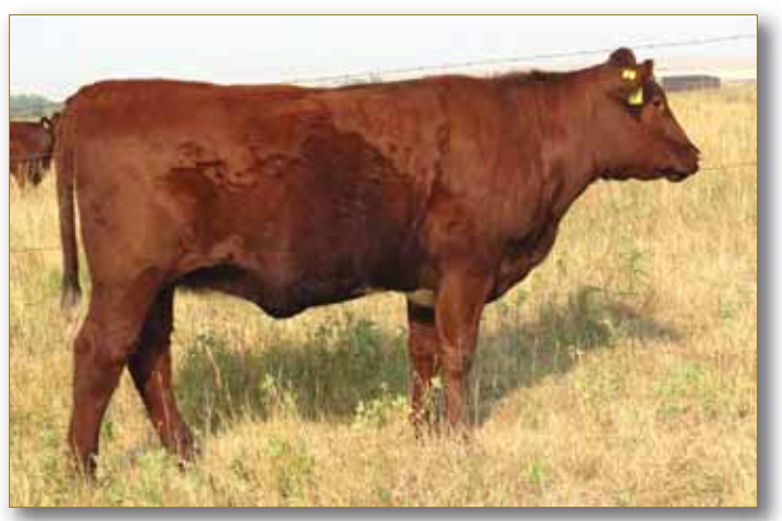
Lot 13 - Double Star SVW Crocus 31D