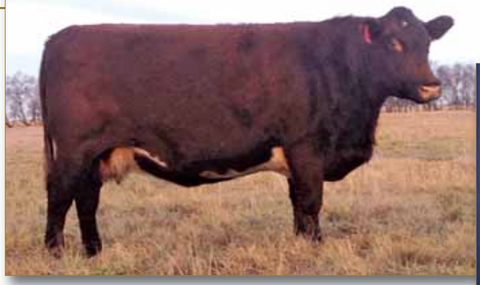
Lot 46 Donor Dam - HC Melba Niam 8T

These embryos are exportable to most countries and sell with our standard minimum guarantee of 50% pregnancy rate at 70 days provided an experienced embryo technician is used. (ie: we will guarantee a minimum of 2 pregnancies at 70 days from these 4 embryos).