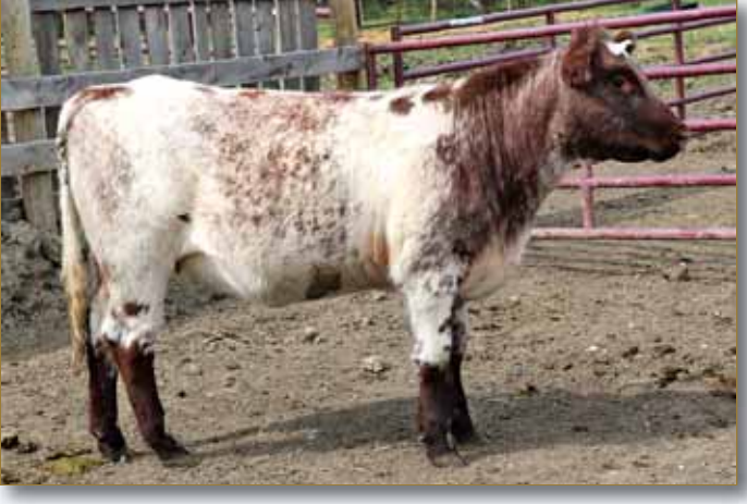
Lot 22 - TGN Dolly Rose I2D

A fine heifer out of a foundation cow. Her dam has excellent form and is great milker. Her full sister sold to Diamond Shorthorns in 2015 and is raising a fine first calf. She is safe in calf to RCS Carbide 11C who is a proven easy calver and is a son of JSF addicted. TH free.