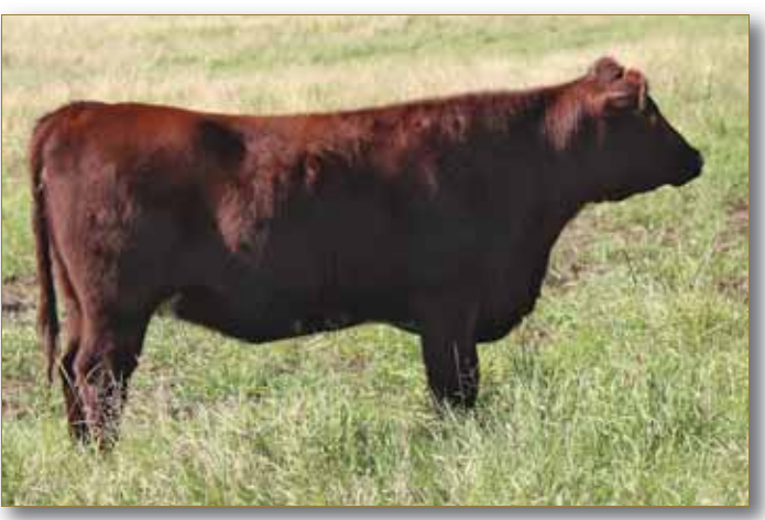
Lot 8 - Sharom Shy Dame 68D