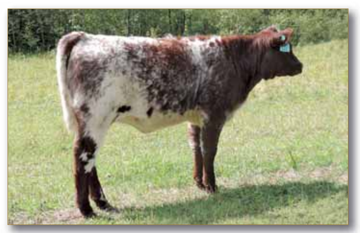
Lot 40 - Starbright Susie Sue 25E