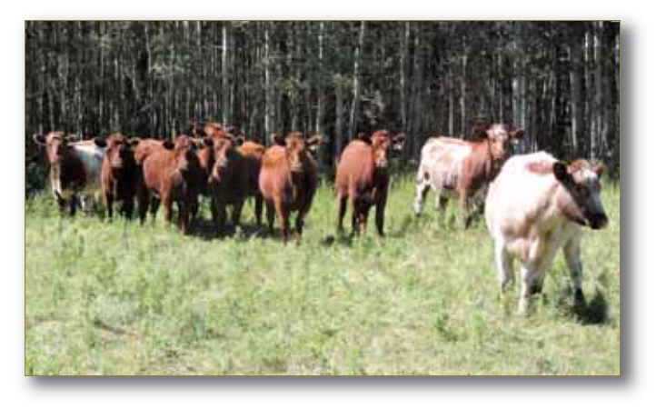
STARBRIGHT SHORTHORNS - Bonnyville, AB