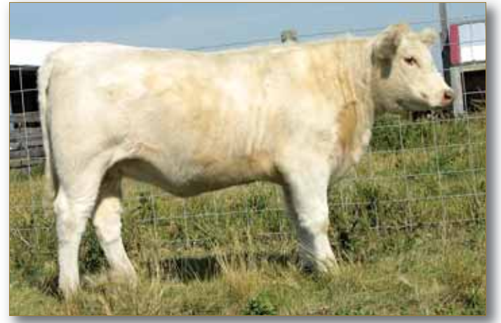
Lot 30 - DRS Picture Perfect 32D