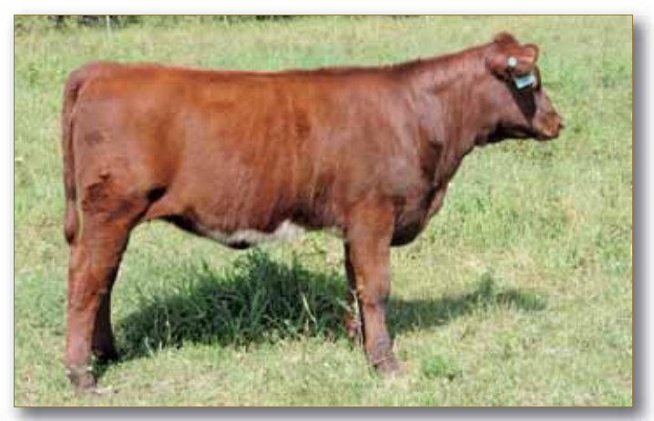
Lot 37 - Starbright Rockette 8E

A smaller framed, nice roan heifer out of an honest easy keeping, good producing cow, who goes back to the beginning of my breeding program. This heifer too would be in my keeper pen on a different year. I am confident she will make an excellent female.