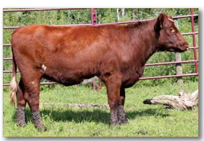
Lot 19 - TGN Delta Dawn 2D