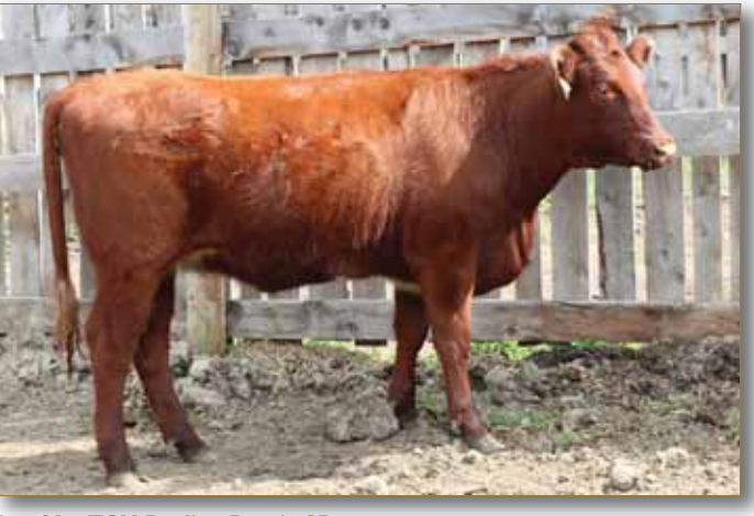
Lot 21 - TGN Darling Dottie 8D

A gorgeous white heifer out of phenomenal line. She is a keeper. Her mother has a perfect udder, excellent legs and has stunning calves year after year. Bred to RCS Carbide IIC who is a proven easy calver and is a son of JSF addicted. Polled and TH free