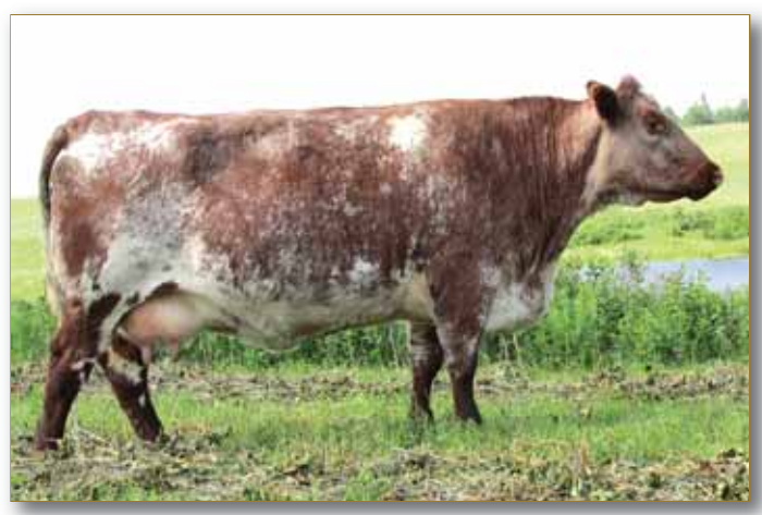
Lot 6 Donor Dam - Paintearth Nina 66U