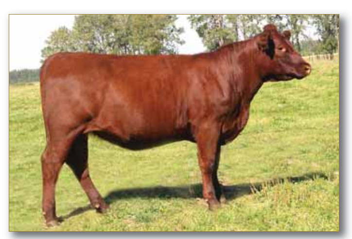
Lot I - Crooked Post Red Rose 38D