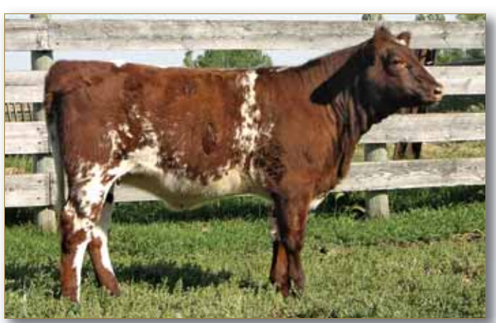
Lot 31 - DRS Emerald 24E