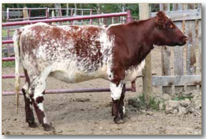
Lot 23 - TGN Calandra 17C

A late calf out of a first calf heifer, Calandra caught late last year so we aborted her and she is now bred for an early March calf. The extra time gave her lots of growth and she is going to be a stout cow with all kinds of maternal volume. Her line has excellent udders and temperaments. Bred to RCS Carbide IIC who is a proven easy calver and is a son of JSF addicted. Polled and TH free.