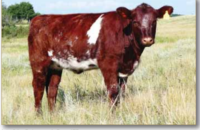
Lot 34 - Paintearth Dee 47D

This heifer will make a fancy show or 4H project.