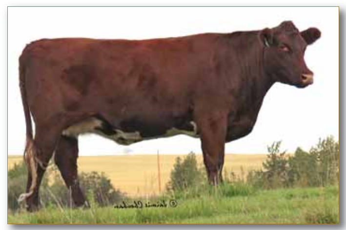
Lot 8 - Diamond Anna 45A