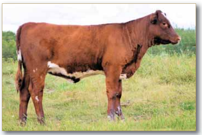
Lot 27 - Top Rank Flower 18D

From the heart of our breeding program, the genetics behind this heifer just work. Eye appeal, temperament, good milk, easy keeping, and top producing brood cows trace back for generations on her pedigree. This sweet girl is only on offer because my herd carries a lot of her genetics. Her maternal half brother from dam was the first bull to leave the bull pen last year. I am confident she will go on to make a female you will be glad you purchased.