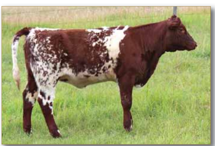
Lot 20 - Sharom Dobbin 52D