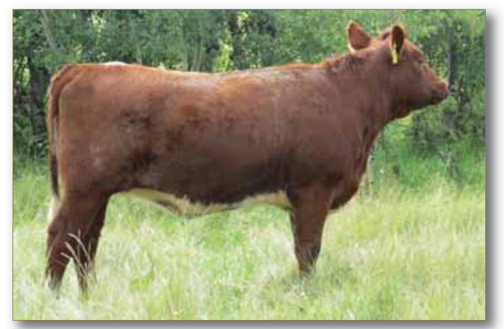
Lot 17 - Silverwillow Nickie Hazel 7C

A "Nickel" heifer with more frame, but like her dam will mature nicely into it. This Morison cow has really developed into a good cow for us.