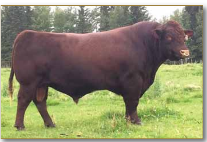
Crooked Post Stockman 4Z