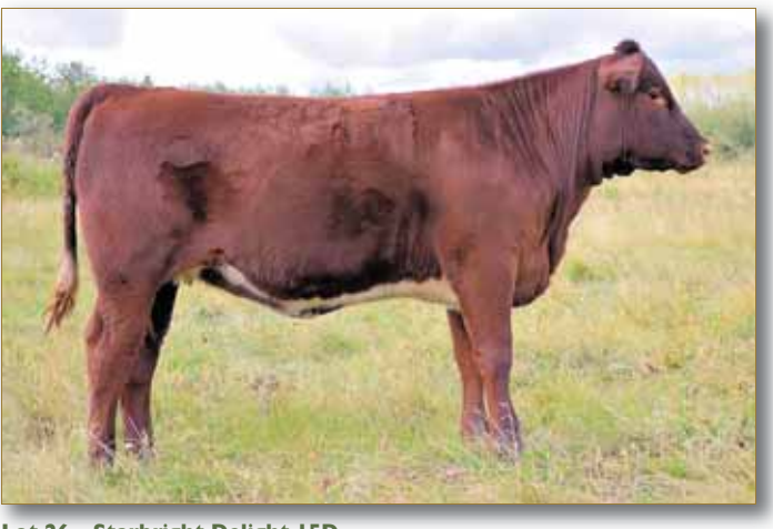
Lot 26 - Starbright Delight I5D

This is likely one of the last Walter daughters to be offered for sale. They have proven themselves to be excellent uddered, good footed gentle tempered, outstanding mama cows. Exactly what I have been looking for in replacement females. This heifer is a full sister to our high seller consigned to the 2015 All Star Classic. Her dam consistently weighs off the big ones year after year.