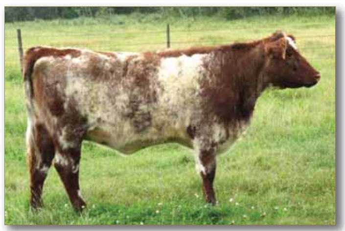
Lot 19 - Silverwillow Nickie Helen 22C