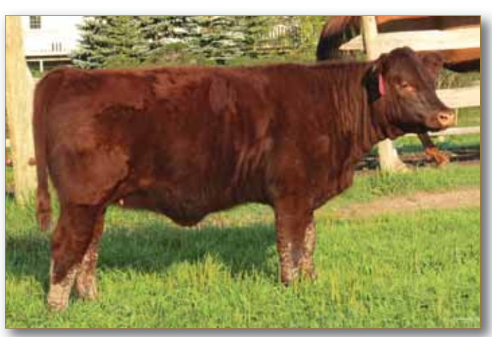
Lot 29 - Diamond Darling Baroness 9D

One of the first heifer calves by Diamond Lord Belmore 56B and out of a good two year old daughter of Eionmor Piper 23Z. As her dam and grandam are both young we can offer this heifer from the top of the calf crop. We are very excited with Lord Belmore's calves and she is one of the reasons so many females in our herd were bred to him this year.