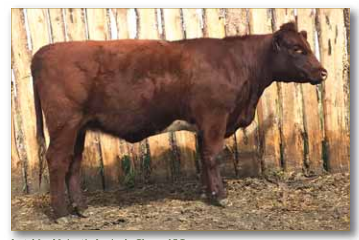
Lot 16 - Majestic Janice's Cheer 15C

This bred heifer has grown a tremendous amount this summer on pasture. She has great muscle shape and a really smooth front end. She also sells bred to HC Bankroll 21B