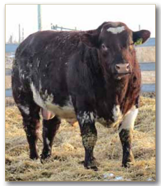
Diamond Lord Belmore 56B