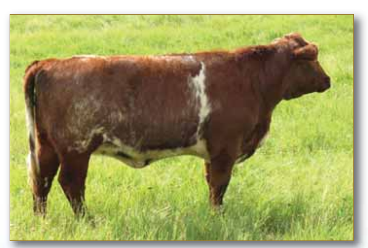
Lot 18 - Silverwillow Nickie Rosey IIC

Nice broody" Nickel' female here, her mother is a really impressive daughter of Lehne Transformer.