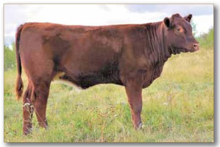
Lot 25 - Starbright Diana 14D