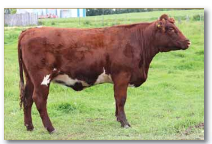
Lot 9 - Sharom Caramel IIC