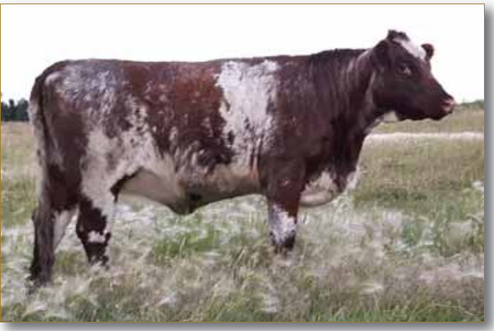
Lot 14 - Prospect Hill Cindy 28C

This heifer was shown by our 10 year old grandson Tristan at the Westerner Days in Red Deer. She is wide, deep and dark red. Here is a Balmoral Oaks Eagle daughter who will be hard to replace and will make an outstanding brood matron. THF