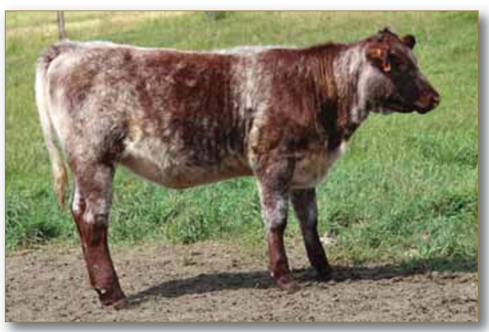
Lot 23 - Sharom Dewdrop 67D

It seems that every year we end up picking a heifer from our Sugar cow family to be in the sale. We have several females in our herd from this cow family and more in the pasture this year. These calves will grow well and become good brood cows for a new herd. We have had good luck with her sire Eionmor Masterpiece 81A as he has produced many more calves like this one.