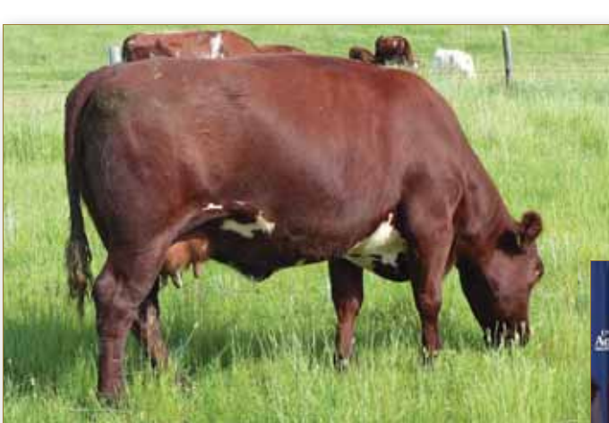
Lot 35 Donor Dam - HC Sparkle Delight 77W