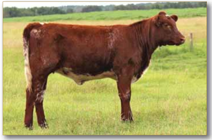
Lot 22 - Sharom Diva 63D

We can't say enough about our Blizzard calves. Like this heifer they were all born unassisted with lighter birth weights but are growing very well. They are all off of first calf heifers who are doing tremendous work to raise these calves. This is just a good heifer!