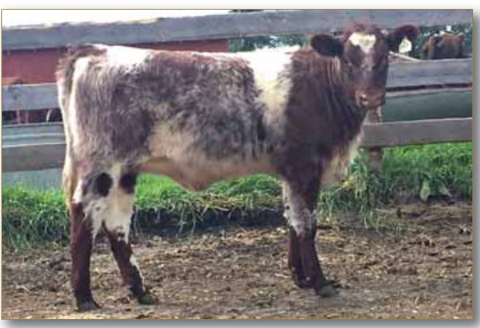
Lot 32 - Majestic Janice's Damsel 9D

Ariel 34D is a beautiful heifer whose dam has been a strong producing female. We expect great things from this female. She is also a half sister to the highest selling yearling bull in the Cowman's Advantage Bull Sale.