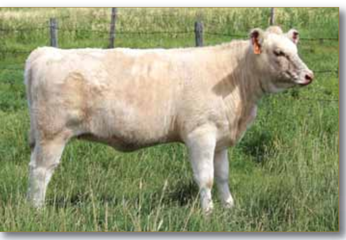
Lot 21 - Sharom Diamond 61D

This is one of the calves off of Sharom Blizzard, a bull we used on heifers last year with great success. We are impressed with the calves style and growth. This beauty will be a great addition to anyone's herd. Her dam is a first calf heifer and did a wonderful job with her.