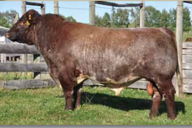
Lot 37 Embryo Sire - Paintearth Rama 53U

Consignor: HORSESHOE CREEK FARMS LTD. - Weyburn, SK