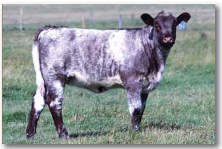
Lot 31 - Janell's Ariel 34D