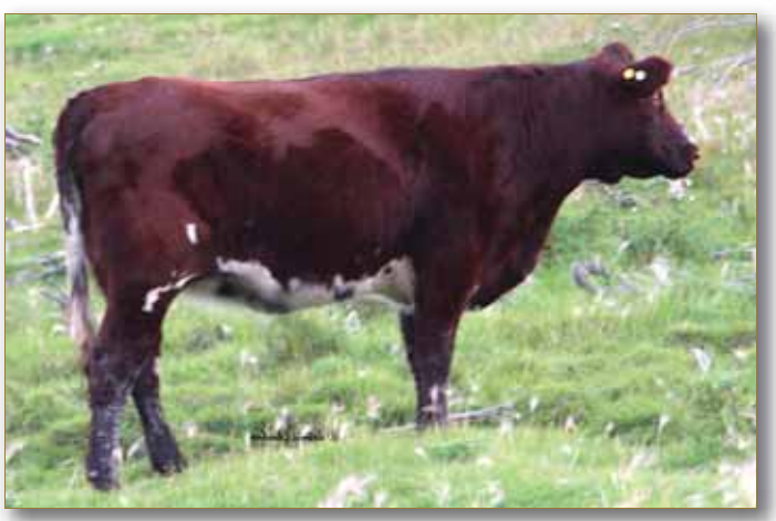
Lot 7 - Newbiggon Caitlin Susan 26C