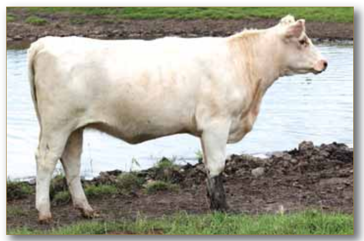
Lot II - Sharom Chickie 33C

This heifer is just plain good. Feminine yet broody off of one of our mainstay cow families. Her bloodlines run back to the Eionmor herd through her sire's side.