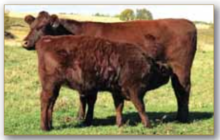
Lot 8 with her 2015 heifer calf