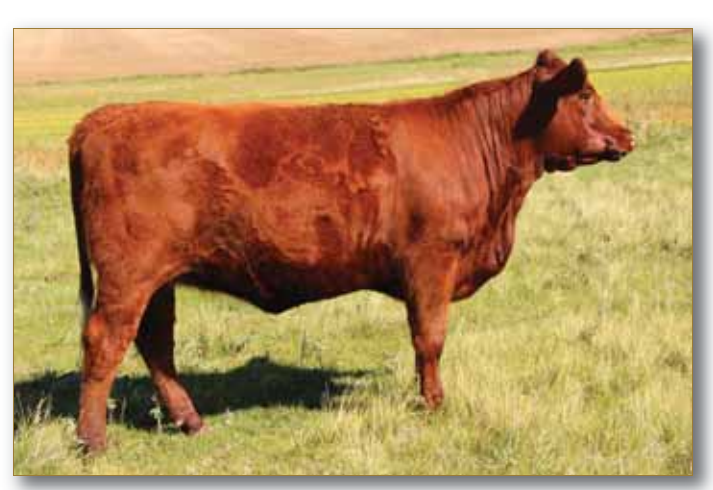
Lot 2 - Diamond Crimson Maid 12C