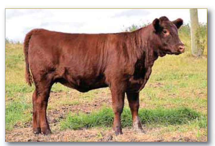
Lot 24 - Starbright Elizabeth IID

This showy heifer calf sired by Little Cedar Cabrera 24 out of a Kenlene Elizabeth heifer, will likely make a great junior show project. Her dam was shown successfully as a heifer and her grandam Butterfield Elizabeth 17R has definitely shown her worth in the show ring and in producing top quality show prospects. As Elizabeth 17 R is deceased I expect her genetics will only increase in value.