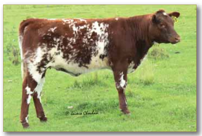
Lot 28 - Diamond Delightful Maid 34D

A lovely daughter of Gus from our good producing Maid line. We are retaining a look alike paternal sister out of her grand dam. Her mother is an easy keeping young cow with a very good udder. A maternal sister to her dam also sells.