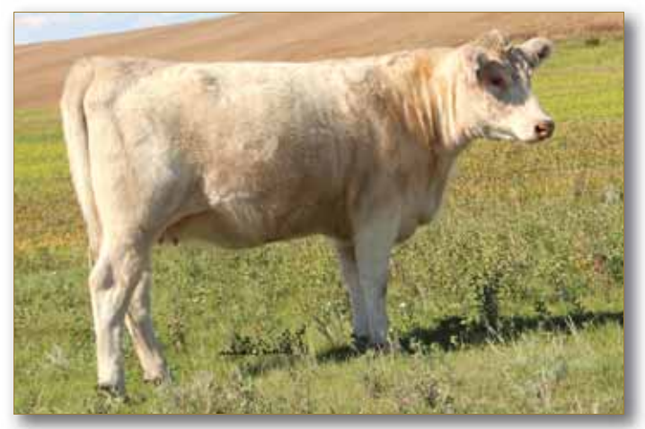
Lot 4 - Diamond Minnie Carrie 21C

Diamond Minnie Carrie 21C is a excellent opportunity to acquire a powerful female from the highly productive Minnie cow family. 21C is a proven combination of genetics that have been constantly top producing front pasture cows. Carrie 21C is only being offered as a feature because we are retaining her outstanding two year old full sister, her dam and grandam, Diamond Minnie Searle 11S, who has been a successful donor for our program. She sells bred AI to Coalpitt Creek Leader 6th which should produce an excellent roan calf