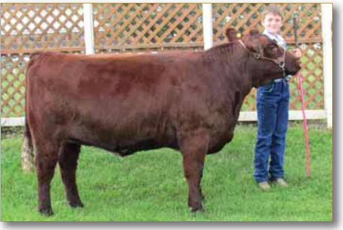
Lot 13 - Prospect Hill Cinderella 19C