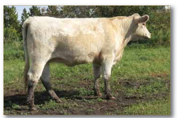
Lot 5 - Diamond Caring Baroness 23C

Diamond Caring Baroness 23C is a excellent combination of great phenotype, and proven genetics. Her young dam has had one of the top calves every year in her production. 23C's first calf was a bull that was the first pick out of our pen. We are only able to reluctantly part with this potential brood matron as we are retaining her dam, and maternal sister. She should have an excellent Lord Belmore calf.