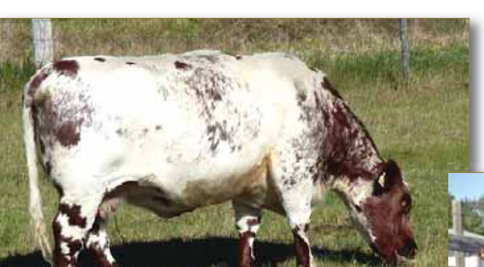
Lot 37 Donor Dam - HC FL Sparkle Delight IX

IX has proven to be an outstanding producer, and her mating with Paintearth Rama ensures the resulting offspring will be tremendously thick, deep bodied and easy fleshing. She is one of the easiest fleshing females we own. Embryos from this flush have already sold to New Zealand. We will guarantee a minimum of I pregnancy at 70 days providing an experienced embryo technician is used. They are exportable to most countries.