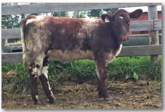
Lot 33 - Majestic Delectable I5D

This heifer calf is full of depth and style. She comes from a very moderate framed dam. HC Bankroll has left a very good looking first calf crop at the Diegel's Do not miss this stylish girl.