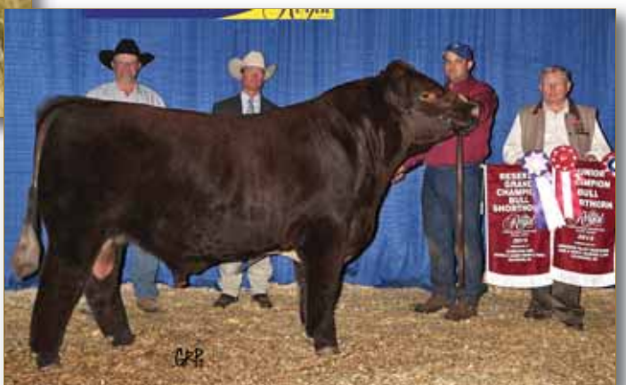
Lot 36 Embryo Sire - HC Bluebook 22B

Breeding Sparkle Girl to most any bull would result in a pretty good calf. Breeding her to Bluebook ensures something great! We think Sparkle Girl represents most everything most beef producers are looking for today. She is moderate framed, thick and like every Sparkle female we have ever produced, she is extremely easy fleshing. She is fertile with a tight trouble free udder and she milks well. Bluebook was our top selling bull in 2015 at $32,000 and his first calves prove he is going to be a great sire as well. We will guarantee the buyer a minimum of 2 pregnancies at 70 days providing an experienced embryo technician is used. The resulting calves will be eligible for the Closed registry in Canada. These embryos are exportable to most countries.