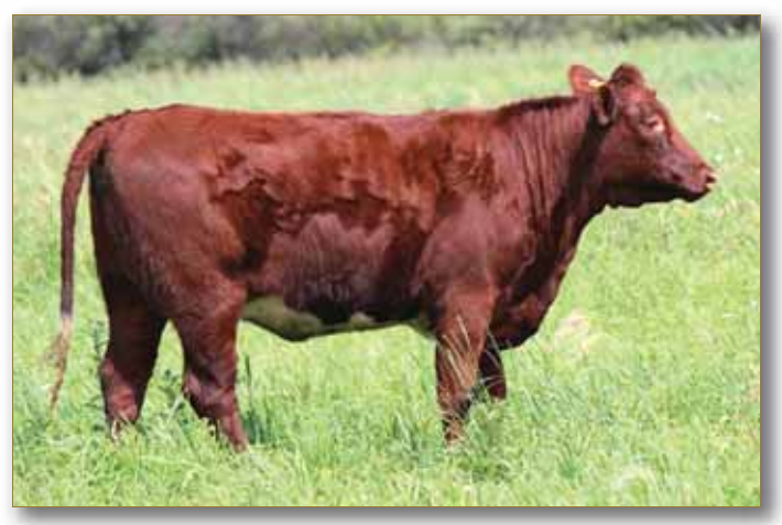
Lot 10 - Sharom Carrie 22C

There is lots of depth and frame in this heifer with style to boot. Being a Sharom Wolverine daughter she is sure to produce.